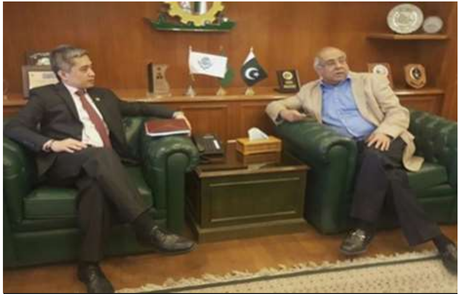
With FPCCI Senior Vice President