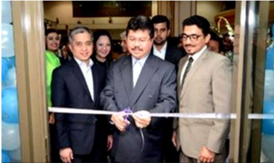
TYT Dato' High Commissioner officiating the Shaheen Air inaugural flight