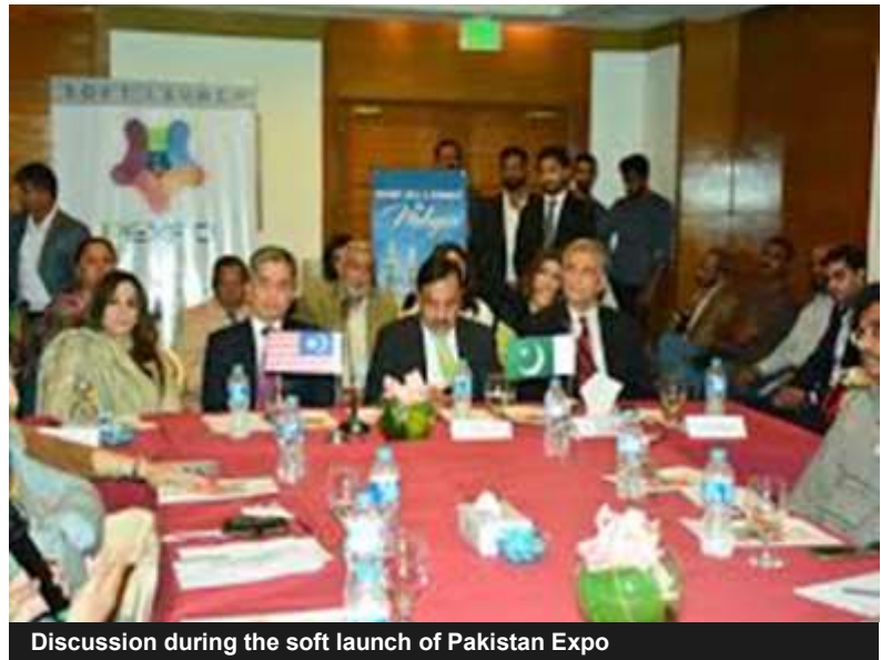
Discussion during the soft launch of Pakistan Expo

My Karachi is the biggest trade and commercial event held annually in Karachi. It was organized by the Karachi Chamber of Commerce and Industry (KCCI). The Consulate joined more than 300 others in setting up a booth at the expo.