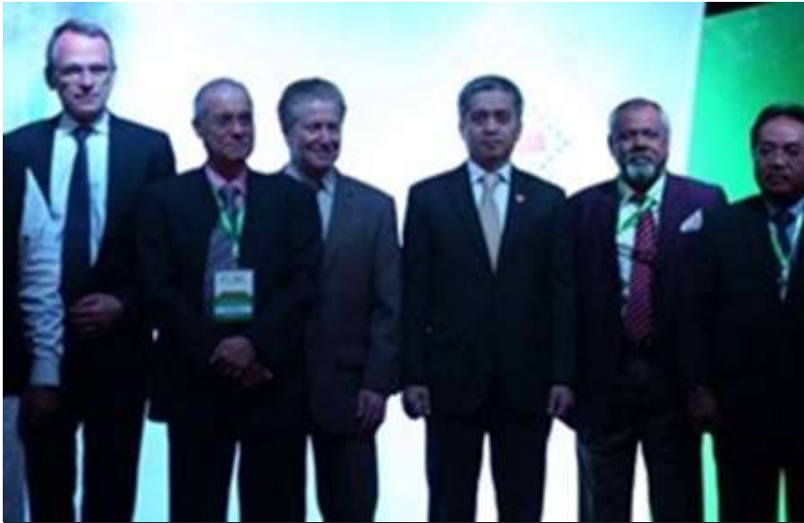
With guest speakers and other VIPs