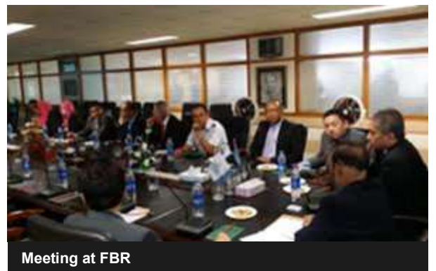
Meeting at FBR