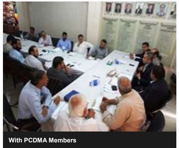
With PCDMA Members

CG Karachi hosted an Inter-Agency Meeting at the Royal Rodale Club on 12 May 2016. 8 officers from 5 agencies participated in the Meeting, namely Immigration Department, Tourism Malaysia (Dubai), Agriculture (Dubai), MATRADE (Mumbai) and the Malaysian Palm Oil Board (MPOB). During the meeting, each Agencies presented the activities that they had undertaken since January and programs to be implemented for the rest of the year. After the meeting, the delegation held meetings with the Sindh Investment Board, Federation of Pakistan Chamber of Commerce and Industry (FPCCI), as well as the Federal Revenue Board (FBR).