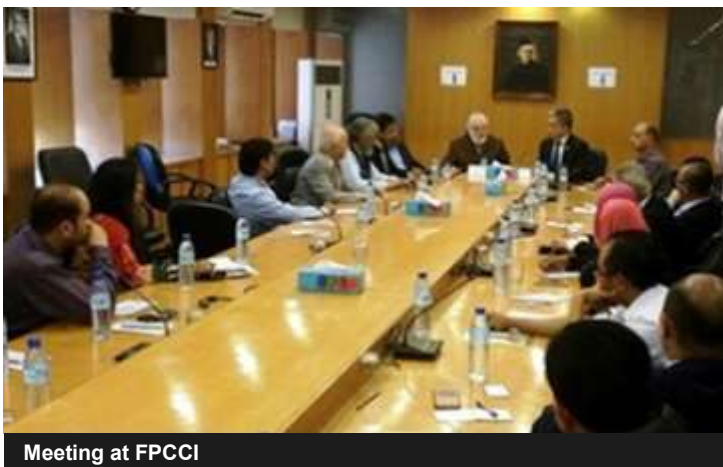
Meeting at FPCCI