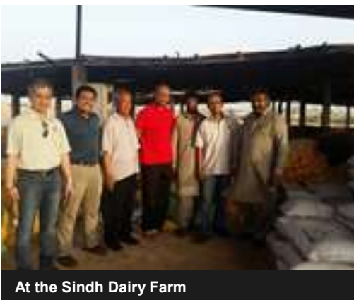
At the Sindh Dairy Farm

A delegation from the Consulate made a study visit to the Sindh Dairy Farm, Karachi. The main purpose of the visit was to observe the effective use of Palm Kernel Cake as an ingredient to feed the livestock. The product was imported from Malaysia.