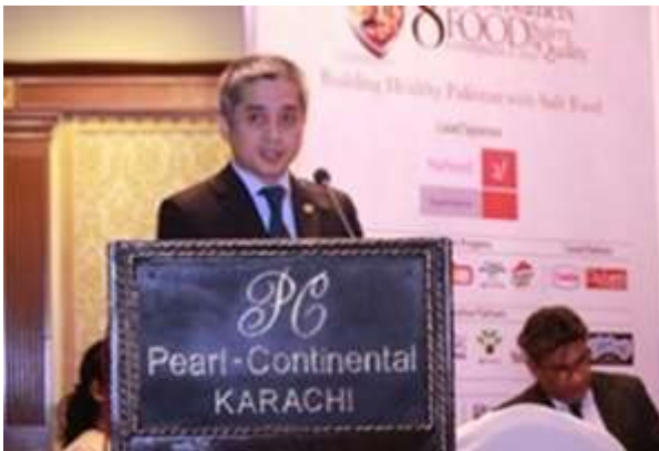
Delivering speech on the benefits of palm oil

Malaysia was represented by the Malaysian Palm Oil Board, Malaysian Palm Oil Council and several companies such as Felda, Sime Darby. Felda set up a booth, which displayed numerous palm oil-based food products.