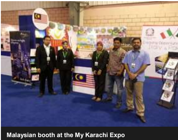
Malaysian booth at the My Karachi Expo