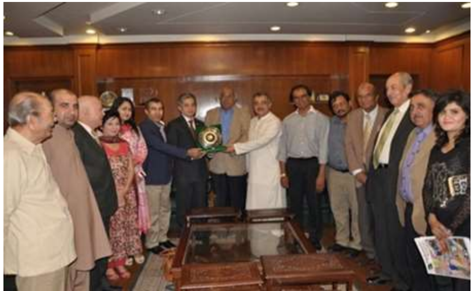
With FPCCI Committee Members

The FPCCI is one of the most influential non-governmental organization dealing with trade and industry in Pakistan. Based in Karachi, the FPCCI had just concluded their Annual General Meeting in December 2015 and the Consul General went to meet with the new office bearers. Among the issues discussed include enhancing bilateral trade between Malaysia and Pakistan as well as a number of issues of mutual concern, including tourism and Islamic finance cooperation.