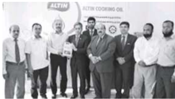
Launching Cooking Oil and Palm Kernel Cake products