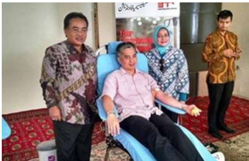
With CG of Indonesia

The Consulate participated in the Sindh Open Bowling tournament.