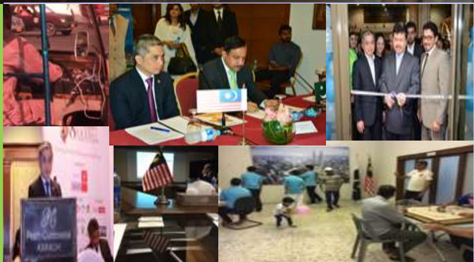
In and around Karachi