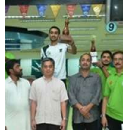
With winners and organiser