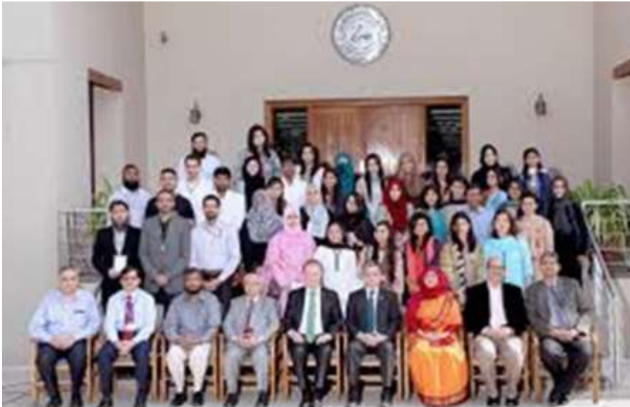
Group Photo with Management of Ziauddin University

In conjunction with Ziauddin University's new student intake for 2016, the Consul General was invited to deliver the keynote address. Among others, the Consul General touched on the excellent cooperation in education as well as strong bilateral ties between the countries.