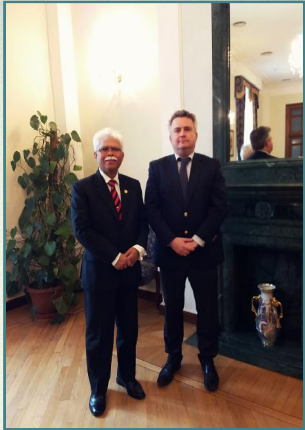
Datuk Ayauf Bachi and Deputy Foreign Minister, MFA