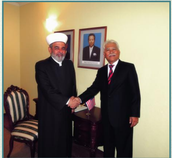
Datuk Ayauf Bachi received a courtesy call by Al-Fadil Al-Sheikh Ahmed Tamim, Mufti of Ukraine.