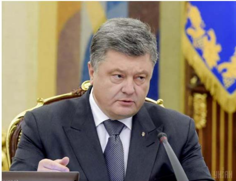
Poroshenko will visit Malaysia and Indonesia

The visit to Malaysia is slated for August 3-5, 2016, the administration's press service said.