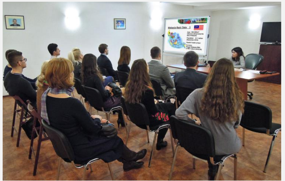
Students of the Diplomatic Academy of the Ministry of Foreign Affairs of Ukraine at the Embassy of Malaysia

The Embassy of Malaysia in Kyiv hosted 13 graduate students of the Diplomatic Academy of the Ministry of Foreign Affairs of Ukraine on 11 March 2016, making it the Embassy's inaugural outreach activity for this year under Malaysia's Outreach and Public Diplomacy Programme. The students were presented with a tourism promotional video on Malaysia and briefing on Malaysia's country profile. Besides, the students were treated to a few Malaysian desserts and savoury.