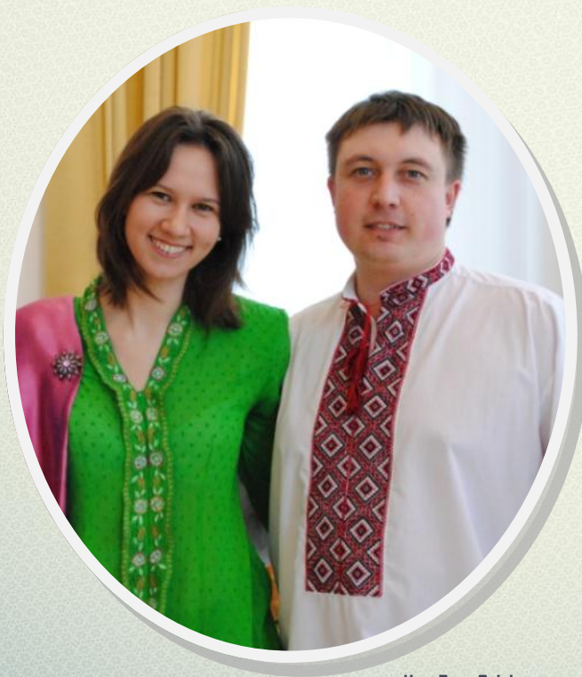
Hari Raya Celebrations

I must also confess that the Embassy of Malaysia became not only the place to be thankful for enriching my professional experience and advancement of the personal growth, but it was the meeting point with my future spouse. Working together first as colleagues became something bigger after a while. After realizing that our relations