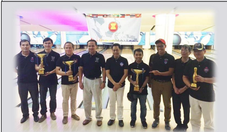
The ASEAN Committee in Kuwait (ACK) successfully held its 5th bowling tournament at the 360 Mall in Kuwait on 20 May 2016. This year's tournament was organized by the Embassy of Lao PDR, as ACK Chair for 2016.