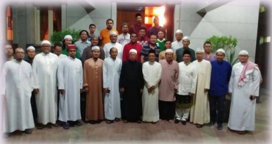
Mufti with Malaysian community in Kuwait

VISIT BY YBHG. DATUK DR ZULKIFLI MOHAMAD AL-BAKRI, MUFTI OF FEDERAL TERRITORY ON 23-27 JUNE 2016, AT THE INVITATION OF THE NATIONAL COUNCIL FOR CULTURE, ARTS AND LETTERS (NCCAL) OF THE STATE OF KUWAIT