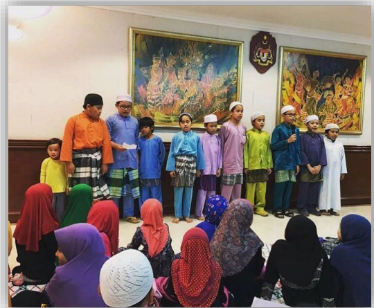
Nasyyid performance by the students