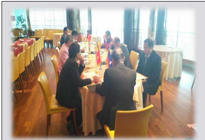
Second Secretary the Embassy of Malaysia represented the Ambassador of Malaysia at the 2nd ASEAN Committee Kuwait (ACK) Ambassadors Meeting, 12 April 2016