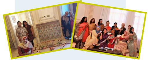
PERWAKILAN Muscat Ladies have an awesome time preparing rangoli (coloured rice) for Deepavali and receive special tutorial on how to wear Indian saree.