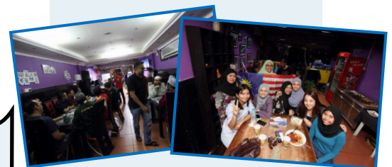
MERDEKA! MERDEKA! MERDEKA! Café Malaysia, Oman echoes with shouts of those glorious words from Malaysian community celebrating the 59th National Day.