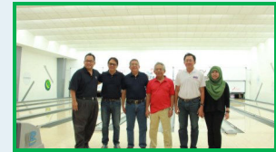
Bowling? It's what the ASEAN Committee in Muscat thrives! Every year without fail, the ASEAN Committee will participate in bowling competition and show off their skills in a fun-loving spirit.