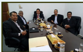
Meeting Malaysian businessmen seeking investment opportunities in Oman.