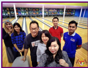
Home-based staff and families brush up their bowling skills in conjunction with Hari Sukan Negara 2016.