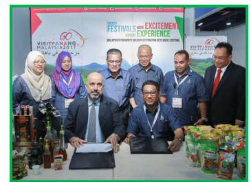
YAB Dato' Sri DiRaja Haji Adnan bin Yaakob, Chief Minister of Pahang, witnesses the signing of MoU between Mindinspire LLC and Cooperative Societies Commission of Pahang Branch for Superbest Coffee products and madu kelulut .

Fast Fact International Living ranked Malaysia as one of the world's top-four medical tourism destination.