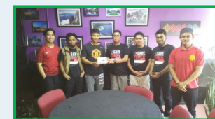
Well-known for their generosity, the Malaysian community in Muscat lends a helping hand to raise funds for humanitarian causes in war-torn Yemen.