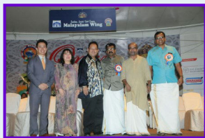
Ambassador and spouse enjoy a memorable afternoon with the Keralan community in Muscat during the feast of Onam celebration, a harvest festival in the State of Kerala, India.