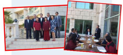
The ASEAN Committee in Muscat meets to celebrate the coming of the New Year. Welcome 2017!