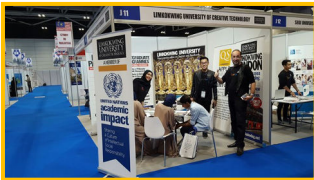
One of the private universities from Malaysia at the EduTrac Oman 2016

18-20 October 2016 - The Higher Education, Training and Career Expo (EduTrac Oman 2016) was held at the new Oman Convention and Exhibition Centre in Muscat. The event saw the participation of six private universities from Malaysia namely Asia Pacific University of Technology and Innovation, HELP University, KDU University College, Limkokwing University of Creative Technology, SEGi University and Sunway University.