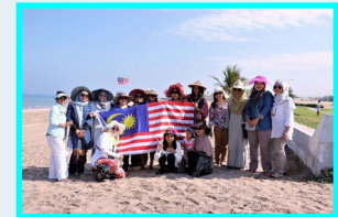
Beach picnic is popular in Oman during the winter months. The PERWAKILAN Ladies in Muscat pack their picnic baskets and enjoy one of the best picnicking spots in town.