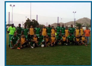
A friendly football match between Malaysia and Nigeria's community in Muscat during the sporting month of October.