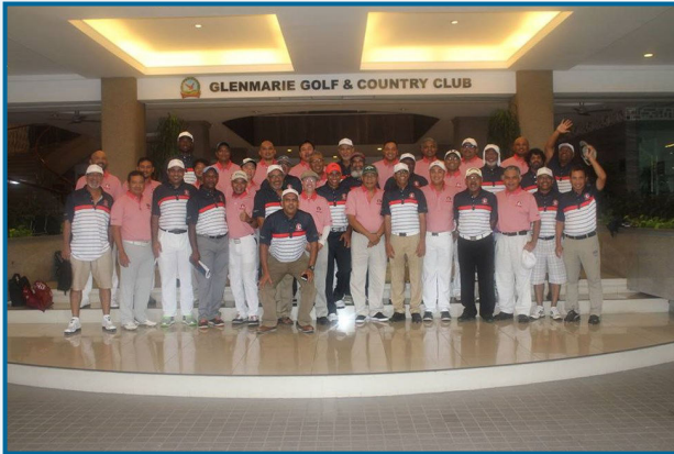
The Malaysian and Omani players of the 7 th Oman-Malaysia Golf Tournament at the Glenmarie Golf and Country Club, Shah Alam, Selangor, Malaysia which was held from 7-8 October 2016.

7-8 October 2016 - Congratulations! October was certainly a happy sporting month for Malaysia who emerged victorious at the 7th Oman-Malaysia Golf Tournament marking the third victory for the Malaysian team.