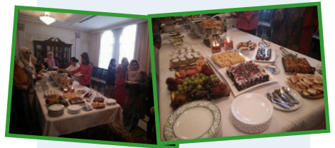
Selamat Hari Raya Aidilfitri dan Maaf Zahir Batin! PERWAKILAN Muscat hosts its own fiesta of makan-makan .