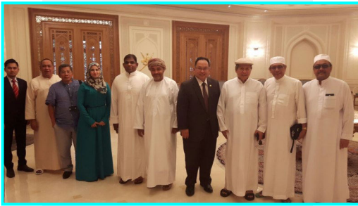
YB FM's in town! The Embassy was privileged to have spent some time with H.E. Dato' Sri Anifah Aman, Minister of Foreign Affairs, on 18 November 2016. YB FM was on transit in Muscat en route to Malaysia from Mecca. Thank you Dato' Sri for taking the time to meet us!