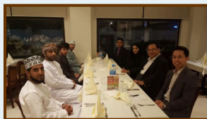
MTCP Alumni share their wonderful experiences in Malaysia and mind-boggling facts about Oman's history and culture.