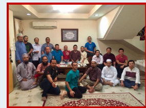
Majlis Ilmu Muscat welcomes all those interested to join the interactive Islamic session every Thursday night.