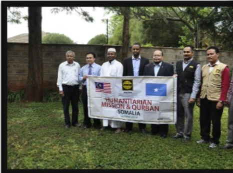
HALUAN Eidul Adha Charity Mission