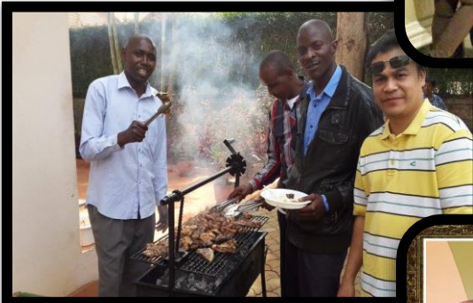
High Commission Year-End Gathering