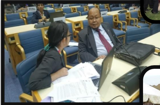
United Nations Environmental Assembly