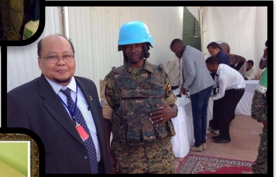
Second HLP Meeting in Somalia