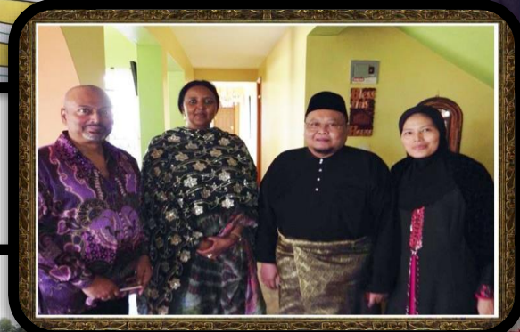
Eidul Fitr with Cabinet Secretary of Foreign Affairs