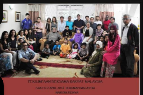
Program Mendampingi Rakyat Malaysia