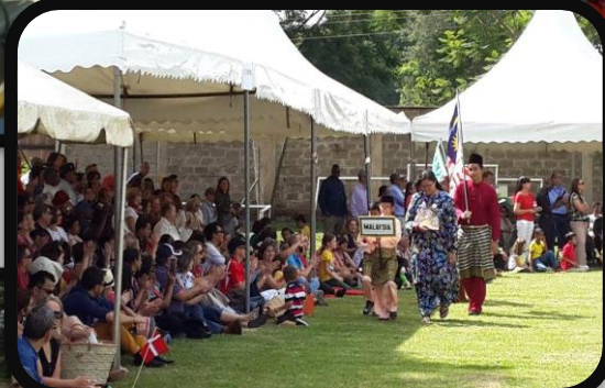
ISK International Day