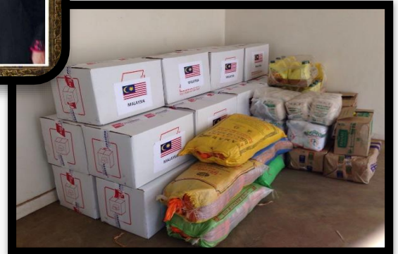
Foodstuff for Eidul Fitr Charity