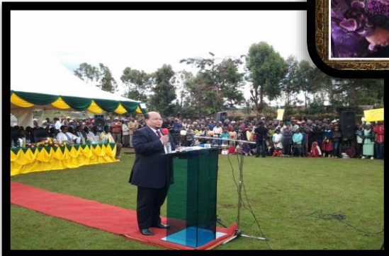
Probase Meru Road Project Opening Speech