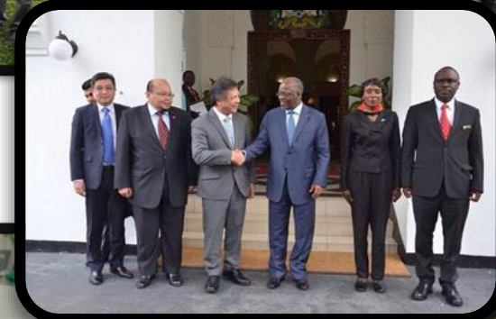
PEMANDU Meeting with President Magufuli, Tanzania