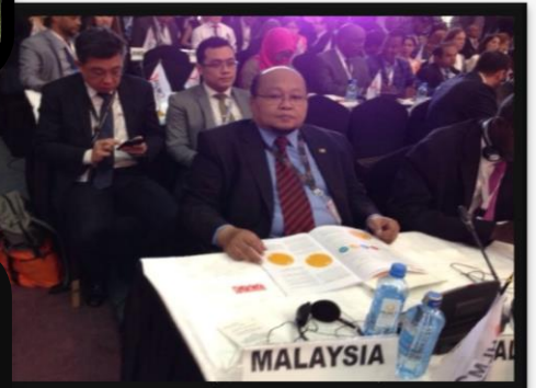
High Level Meeting of GPEC