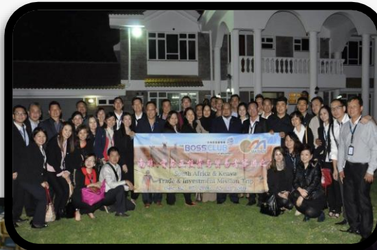
Boss Club Trade & Investment Mission in Kenya