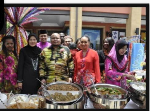
ASEAN Charity Bazaar and Food Festival