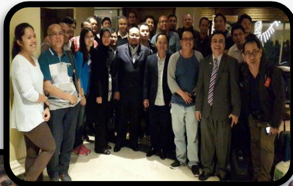
Petronas Evacuation From Juba, South Sudan