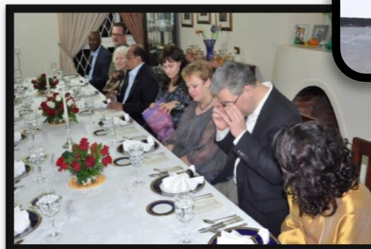
Dinner with Eastern European Missions