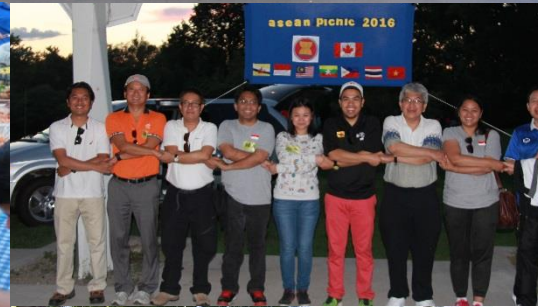
ASEAN Picnic 2016 coordinated by Malaysia, Vincent Massey Park, 29