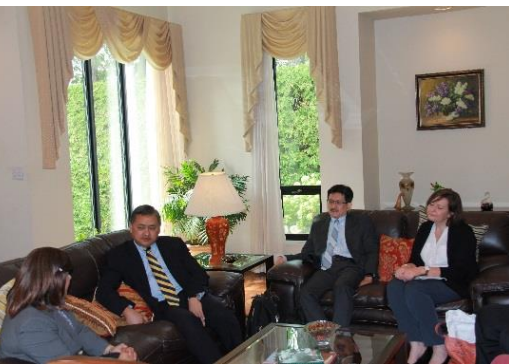
Courtesy call by Pacific Northwest LNG CEO and officials at Rumah Malaysia, 31 August 2016