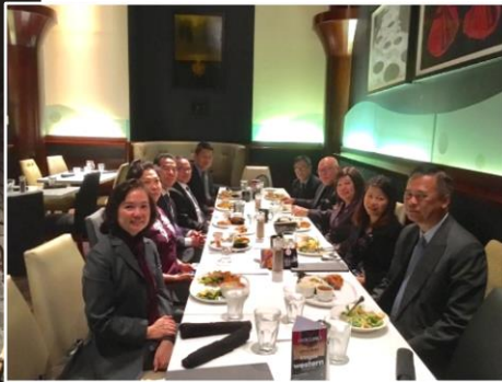
Farewell events of ACO Members coordinated by High Commission of Malaysia