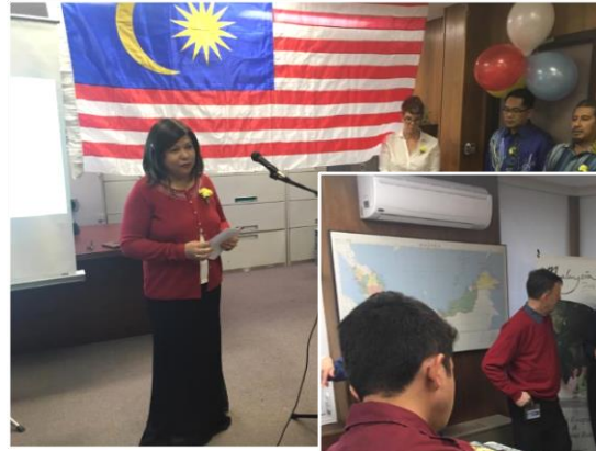
Year-End Gathering Event: Colours of Malaysia, 2 December 2016