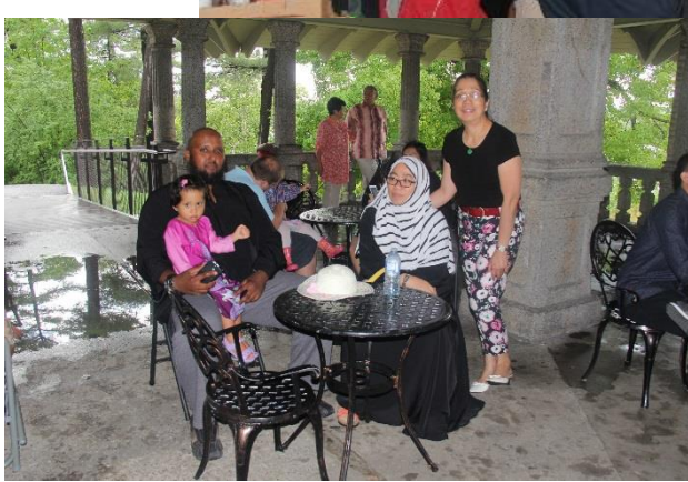
Hari Raya Picnic @ Rockcliffe Park, 15 July 2016