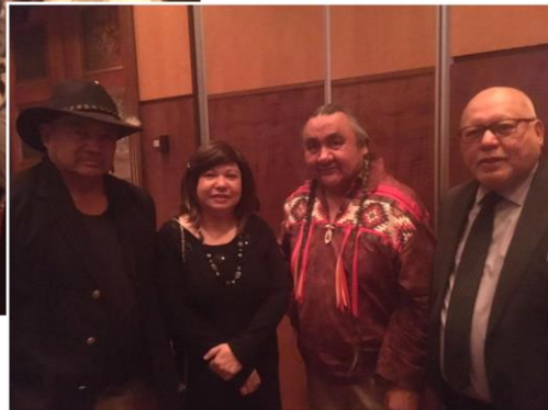
Assembly of First Nations (AFN) Special Chiefs Assembly, 6-8 December 2016