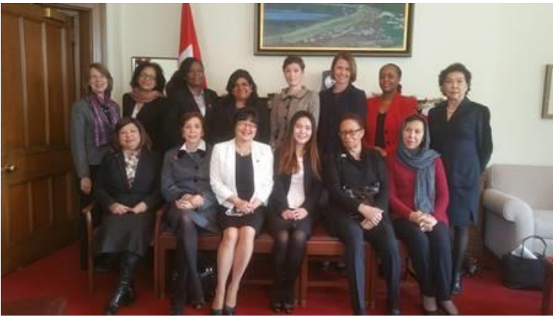
Meeting between Women Ambassadors with Senator Yonah Martin from British Columbia, 6 December 2016