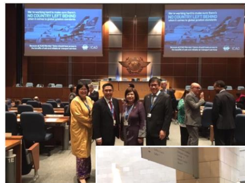
39 th ICAO Assembly, 27 September – 7 October 2016