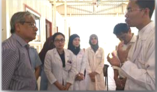
TYT Duta Besar sedang mendengar taklimat dari pegawai perubatan sukarelawan dari Cambodia di HBB