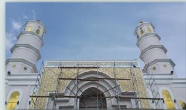
A new mosque in construction