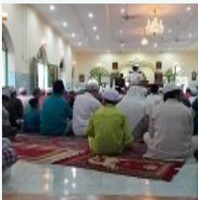
Para peserta melaksanakan Solat Sunat Aidiladha di Masjid Much Dach