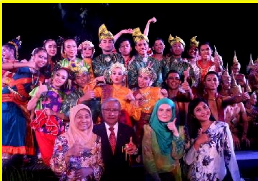
HE Ambassador, Datin Sri and dancers from Akademi Seni dan Warisan Kebangsaan (ASWARA) during the ASEAN-China Joint Cultural Performance on 28 December 2016 in the Province of Siem Reap.

Malaysia's presence in Cambodia began in 1969, although the diplomatic relations was first established in 1957 right after our country gain its independence. However, during the time of the Khmer Rouge, the diplomatic relations with the government of the Democratic Kampuchea was suspended and was only re-installed in 1991 with the signing of the Paris Peace Accord that brought peace and stability to Cambodia till today.