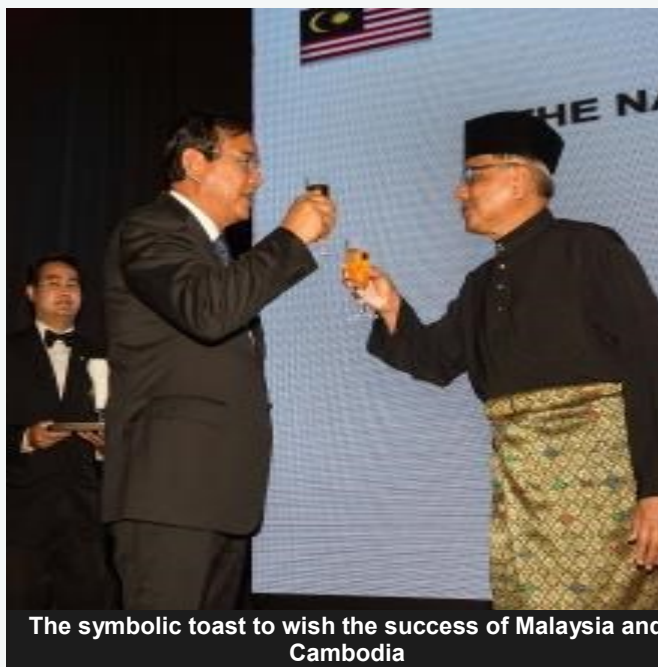
The symbolic toast to wish the success of Malaysia and Cambodia