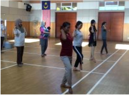
Latihan tarian turut disertai oleh ahli-ahli Perwakilan Kedutaan Besar Malaysia