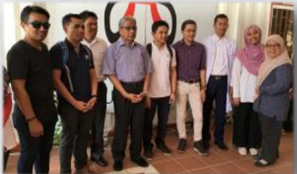
Pegawai-Pegawai Kedutaan tidak melepaskan peluang merakamkan kenangan bersama para sukarelawan HBB