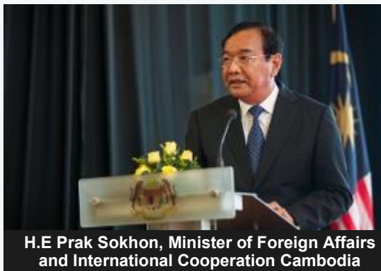
H.E Prak Sokhon, Minister of Foreign Affairs and International Cooperation Cambodia

The Embassy of Malaysia held its annual Flag Hoisting and National Day Reception on the 31st of August 2016. The Guest of Honour was His Excellency Prak Sokhon, Minister of Foreign Affairs and International Cooperation (MFAIC) of the Kingdom of Cambodia. The event was also attended by foreign diplomats, senior officials of the Cambodian government as well as fellow Malaysians.