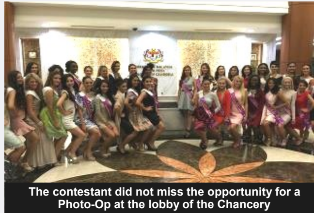
The contestant did not miss the opportunity for a Photo-Op at the lobby of the Chancery