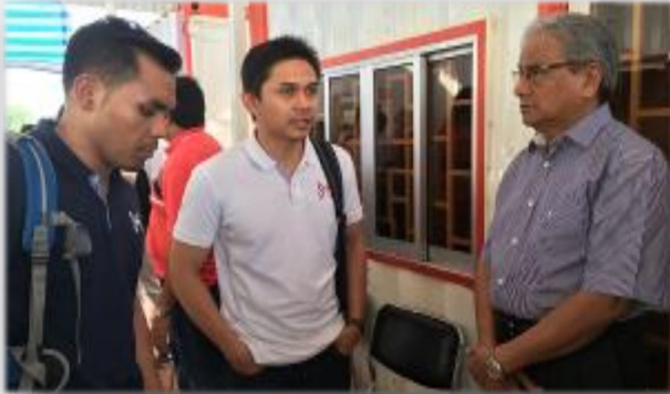
TYT Duta Besar dan para pengasas Hospital Beyond Boundaries