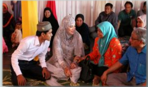
HE Ambassador spending time at a local Muslim Cham wedding in Tboung Khmum

On 28 and 29 September 2016, H.E Ambassador and the officers of the Embassy embarked on a road trip to the Provinces of Kandal, Tboung Khmum, Kampong Cham and Kampong Chnnang as part of his ART programme. The arduous trip was easily compensated by the charm of the rural areas especially by the people of Cambodia. Eating traditional foods by the roadside and attending a local wedding were among the experiences that we gained during the ART.