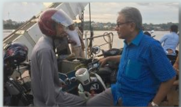
A 15 minute ferry ride from the Province of Tboung Khmum to the Province of Kampong Cham