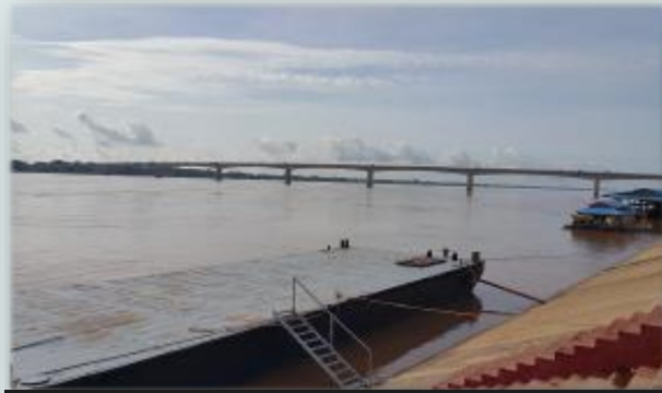
The landmark of Kampong Cham, the Kizuna Bridge