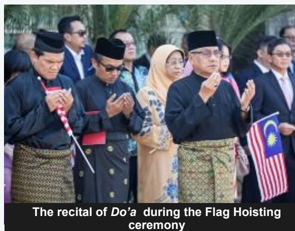
The recital of Do'a during the Flag Hoisting ceremony