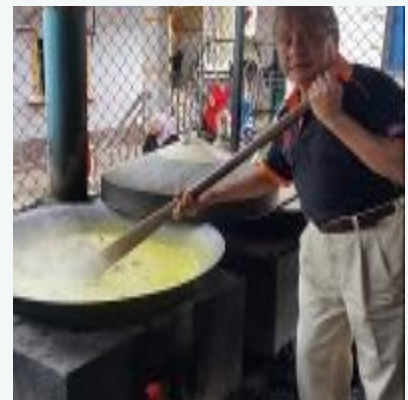
TYT Duta Besar turut membantu menyediakan juadah Lemak Cili Api

Sempena Hari Raya Aidiladha yang lalu, 50 orang Rakyat Malaysia telah menyertai Program Kembara Kurban Parlimen Kuala Pilah di Masjid Much Dach, Kampung Chroy Chongvar berhampiran Phnom Penh. Selepas proses penyembelihan, warga tempatan telah dijamu dengan masakan tradisi Negeri Sembilan seperti Lemak Cili Api.