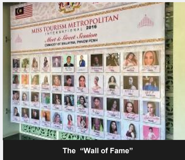
The "Wall of Fame"