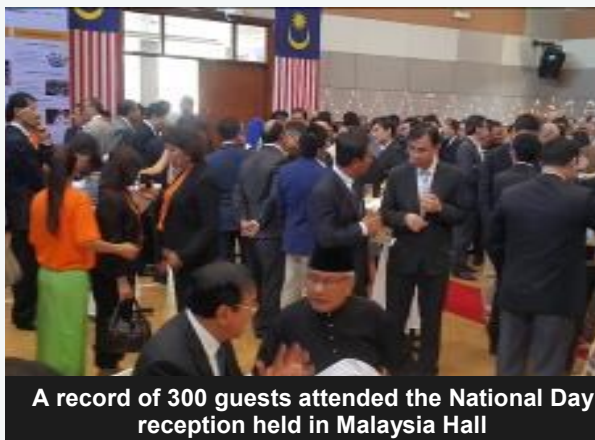
A record of 300 guests attended the National Day reception held in Malaysia Hall

2016 witnessed the first time that the Flag Hoisting and National Day Reception was held within the Embassy ground. This allowed more guests to be invited, particularly Malaysians, to be part of the patriotic celebration. The event was also covered extensively by the Cambodian media. Journalists from Radio Televisyen Malaysia (RTM) were also flown in from Kuala Lumpur for a special segment on the occasion. We are proud to inform that the celebration was well reported in the prime time news.