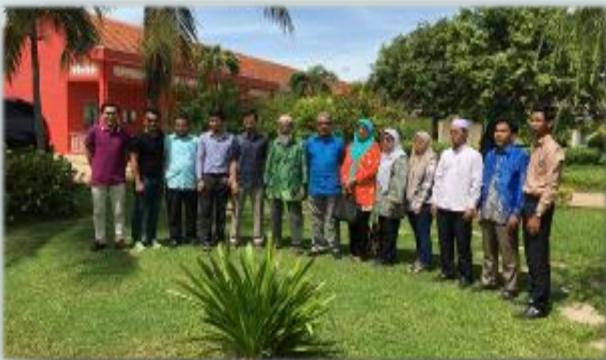
Stopping by at an Islamic School in the Province of Kandal