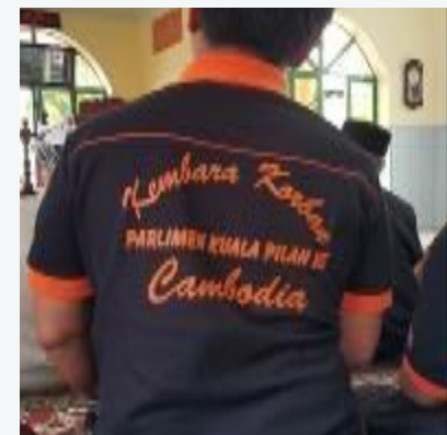
Program ini telah disertai oleh 60 peserta dari Parlimen Kuala Pilah