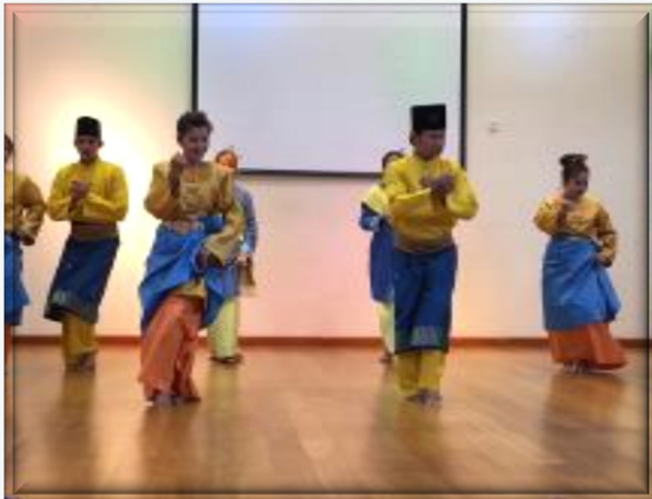
Sesi Persembahan Akhir yang dipertontonkan kepada pegawai-pegawai Kedutaan