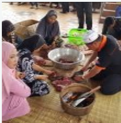
Gotong-royong melapah daging korban di antara peserta dari Kuala Pilah dan penduduk tempatan