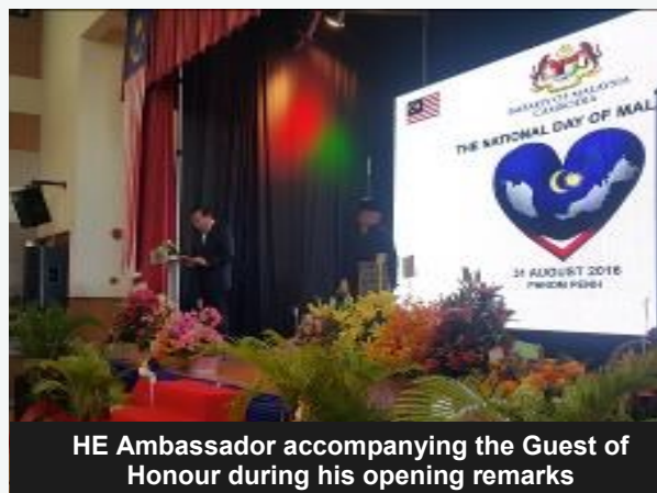
HE Ambassador accompanying the Guest of Honour during his opening remarks