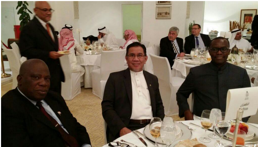
IFTAR HOSTED BY THE DEAN OF DIPLOMATIC CORPS, RIYADH

The Dean of Diplomatic Corps, Riyadh hosted Iftar for all Heads of Mission on 8 June 2016 at the Riyadh Marriott Hotel.