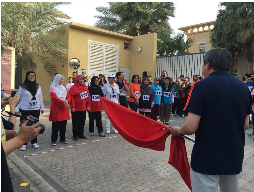
ASEAN-RIYADH COMMITTEE (ARC) ROAD RACE 2016

YAB Prime Minister hosted dinner with the Malaysian community in Riyadh on 3 March 2016 at the Four Seasons Hotel, Riyadh. The dinner was held in a warm and casual manner, with Malaysians taking the opportunity to personally interact with YAB Prime Minister. More than 250 Malaysians attended the dinner.