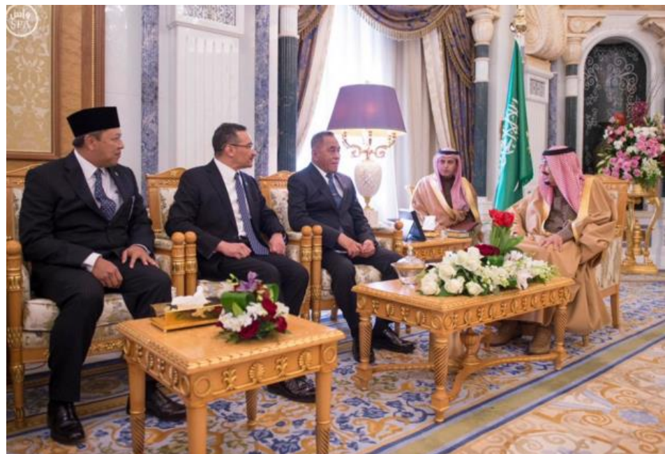
AUDIENCE WITH HM KING SALMAN ABDULAZIZ AL SAUD

YB Dato' Sri Hishammuddin Tun Hussein accompanied by his counterpart, HRH Deputy Crown Prince Mohammad Salman Abdulaziz Al Saud, Second Deputy Prime Minister and Defence Minister of the Kingdom of Saudi Arabia after their meeting in Riyadh on 29 January 2016. Both leaders discussed among others, bilateral cooperation in the field of security and defence.