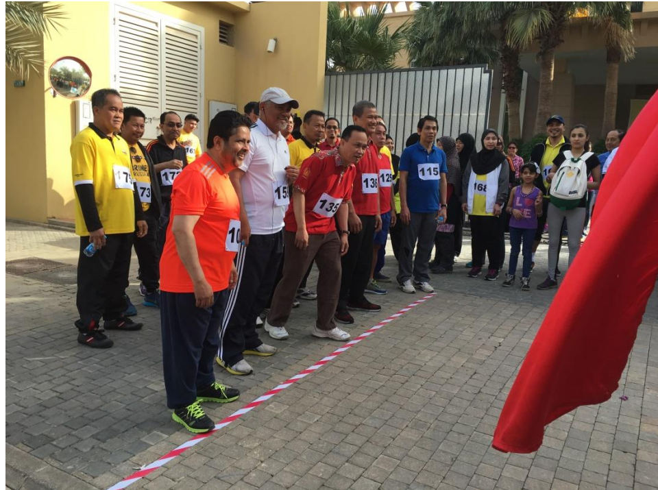
PARTICIPANTS OF THE MEN ABOVE 50 CATEGORY AT THE STARTING POINT