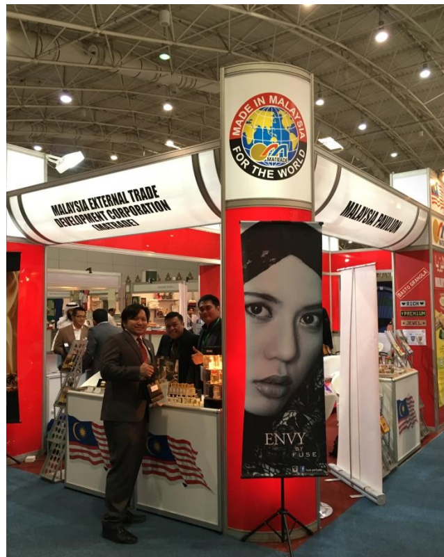
THE FUSE MALAYSIAN OUD-BASED PERFUME BOOTH

The Malaysia External Trade Development Corporation (MATRADE), Jeddah opened a Malaysian booth at the 15 th OIC Trade Fair, Riyadh Exhibition Center on 22 – 26 May 2016. The Malaysian booth comprises Malaysian businesses from various fields, namely food and beverage, engineering, advertising, and also perfumery promoting Malaysian oud-based products.