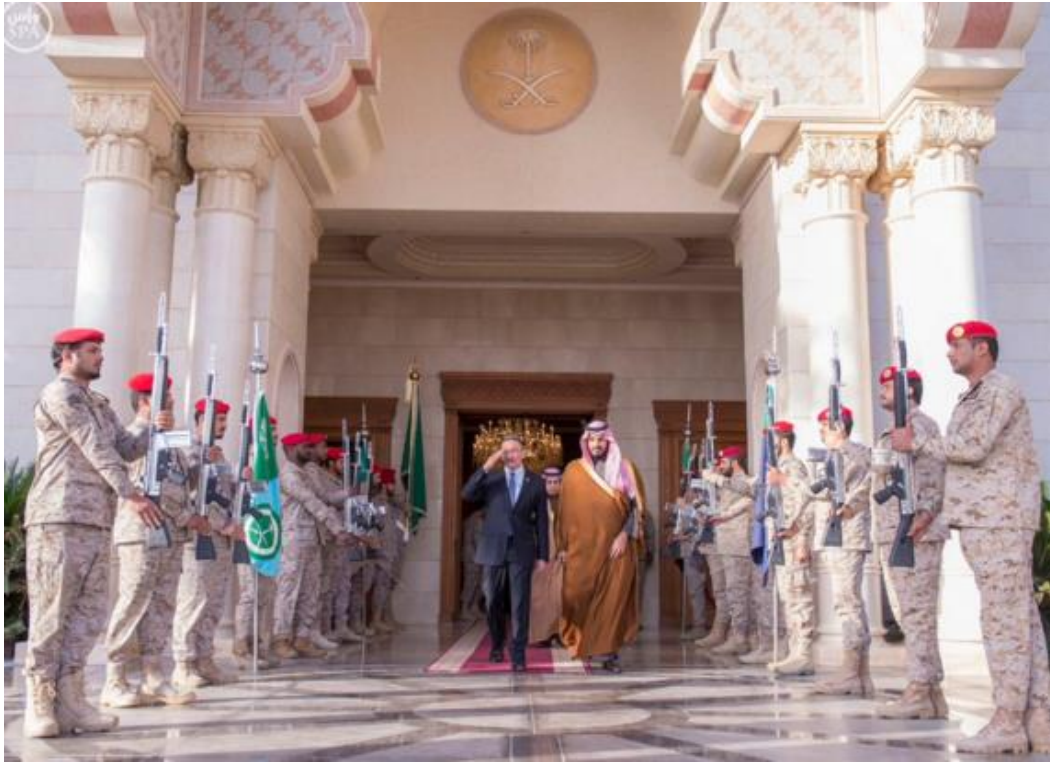
YB MINISTER OF DEFENCE WORKING VISIT TO THE KINGDOM OF SAUDI ARABIA

YB Dato' Sri Hishammuddin Tun Hussein accompanied by his counterpart, HRH Deputy Crown Prince Mohammad Salman Abdulaziz Al Saud, Second Deputy Prime Minister and Defence Minister of the Kingdom of Saudi Arabia after their meeting in Riyadh on 29 January 2016. Both leaders discussed among others, bilateral cooperation in the field of security and defence.