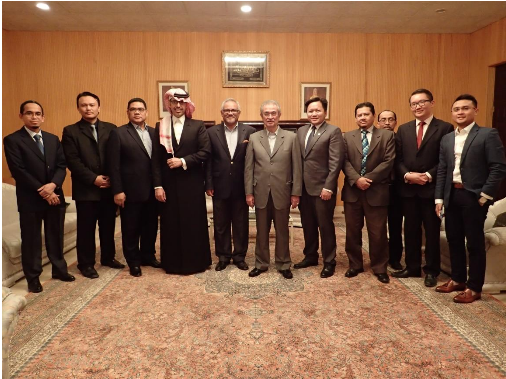
THE WORKING VISIT OF YABHG. TUN ABDULLAH AHMAD BADAWI TO RIYADH

YABhg. Tun Abdullah Ahmad Badawi, the Fifth Prime Minister of Malaysia undertook a working visit to the Kingdom of Saudi Arabia from 17 – 21 January 2016, to attend the 38 th King Faisal International Prize for Service to Islam in Riyadh and chair an International Development Bank (IDB) meeting in Jeddah.