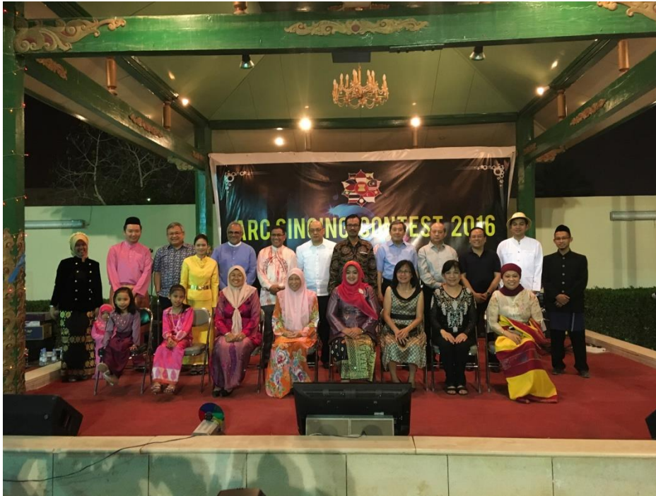
THE ASEAN-RIYADH COMMITTEE (ARC) SINGING CONTEST 2016

The Embassy of Indonesia in Riyadh in collaboration with the Embassy of the Philippines in Riyadh held the ASEAN-Riyadh Committee (ARC) Singing Contest at the Embassy of Indonesia in Riyadh on 20 May 2016. There were two categories in the competition; the ASEAN Songs and the Open Category.