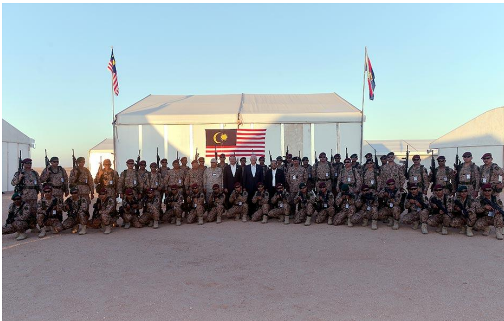
YAB PRIME MINISTER VISITS MALAYSIAN TROOPS IN HAFR AL BATIN CAMP

YAB Prime Minister undertook a working visit to the Kingdom of Saudi Arabia from 1 – 3 March 2016. His Majesty King Salman Abdulaziz Al Saud hosted a Royal Banquet for YAB Prime Minister at his private residence in Riyadh. It was also attended by Royal family member, Saudi Cabinet Ministers, prominent Saudi businessmen and high ranking Saudi officials in honour of YAB Prime Minister.