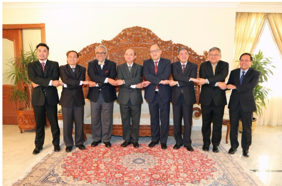
FIRST ASEAN-RIYADH COMMITTEE (ARC) MEETING OF 2016

The First ASEAN-Riyadh Committee (ARC) Meeting of 2016 was held on 16 February 2016 at the Residence of the Ambassador of Indonesia to Riyadh.