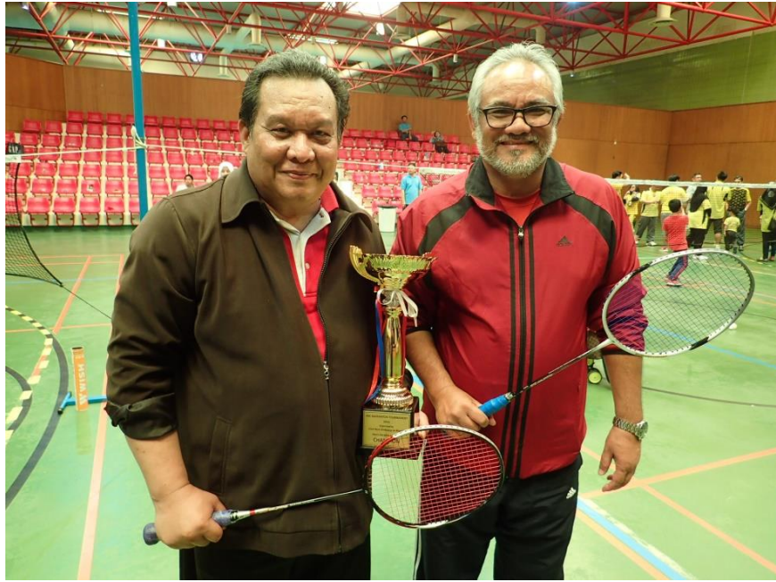
MEN'S DOUBLE CHAMPIONS

Malaysia won the men's double category beating the Philippines in the finals.