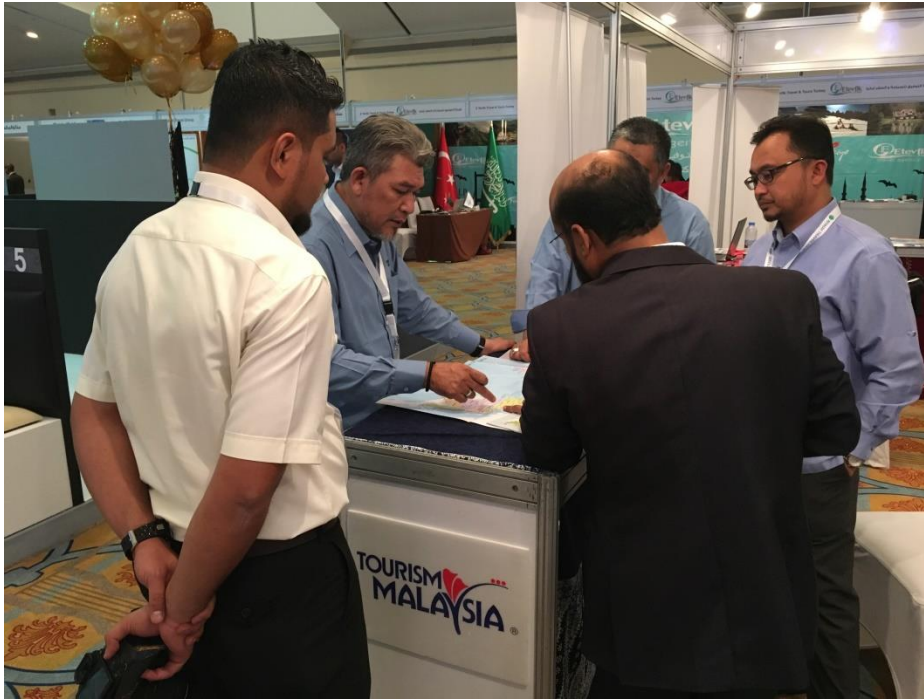
THE TOURISM MALAYSIA BOOTH