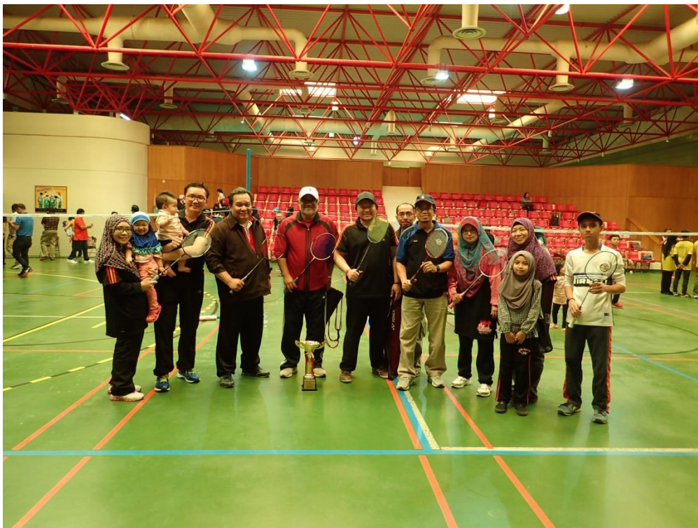
THE ASEAN BADMINTON TOURNAMENT 2016