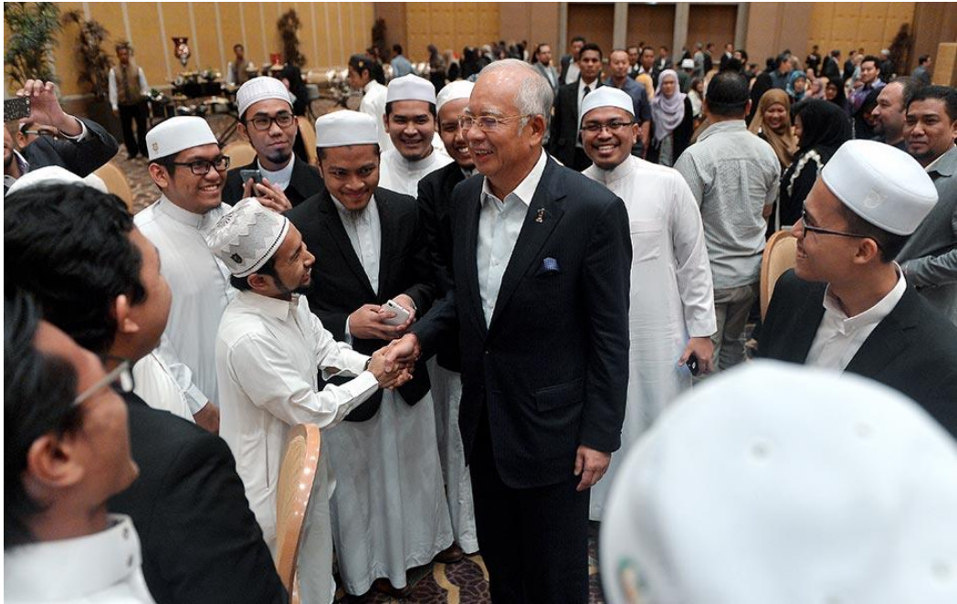
DINNER HOSTED BY YAB PRIME MINISTER WITH MALAYSIANS IN RIYADH

YAB Prime Minister hosted dinner with the Malaysian community in Riyadh on 3 March 2016 at the Four Seasons Hotel, Riyadh. The dinner was held in a warm and casual manner, with Malaysians taking the opportunity to personally interact with YAB Prime Minister. More than 250 Malaysians attended the dinner.