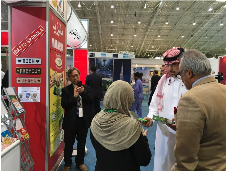
THE 15 TH OIC TRADE FAIR (2016)

The Malaysia External Trade Development Corporation (MATRADE), Jeddah opened a Malaysian booth at the 15 th OIC Trade Fair, Riyadh Exhibition Center on 22 – 26 May 2016. The Malaysian booth comprises Malaysian businesses from various fields, namely food and beverage, engineering, advertising, and also perfumery promoting Malaysian oud-based products.