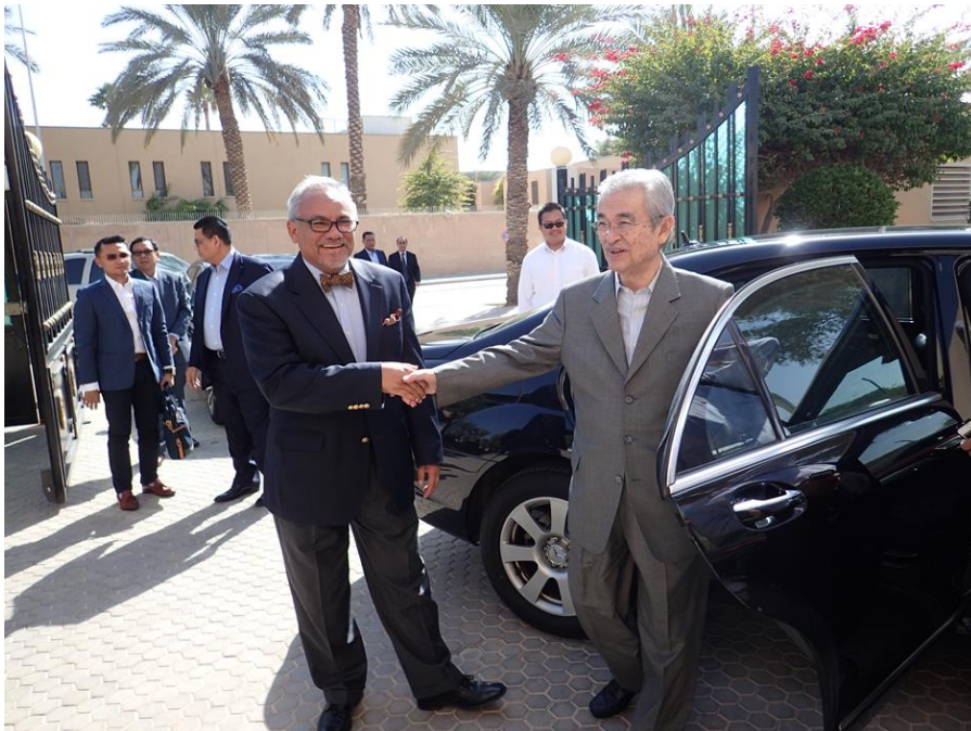
ARRIVAL OF YABHG. TUN ABDULLAH AHMAD BADAWI AT THE AMBASSADOR'S RESIDENCE

YABhg. Tun Abdullah Ahmad Badawi, the Fifth Prime Minister of Malaysia undertook a working visit to the Kingdom of Saudi Arabia from 17 – 21 January 2016, to attend the 38 th King Faisal International Prize for Service to Islam in Riyadh and chair an International Development Bank (IDB) meeting in Jeddah.