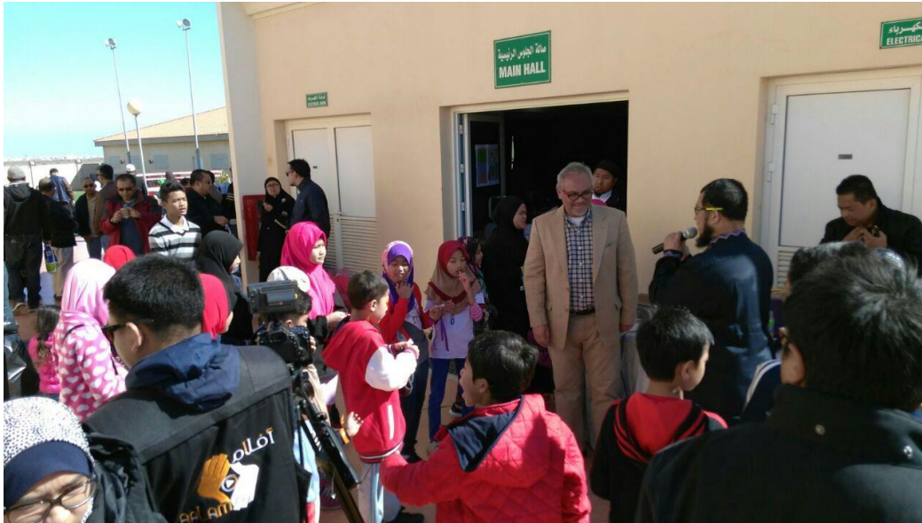
MALAYSIA FEST 2016, SABIC BEACH CAMP, JUBAIL

The Kelab Rakyat Malaysia Jubail (KRMJ) organised the Malaysia Fest 2016 at the SABIC Beach Camp in Jubail, located in the Eastern Province of Saudi Arabia on 30 January 2015. Officials from the Embassy of Malaysia were invited to participate at the event.