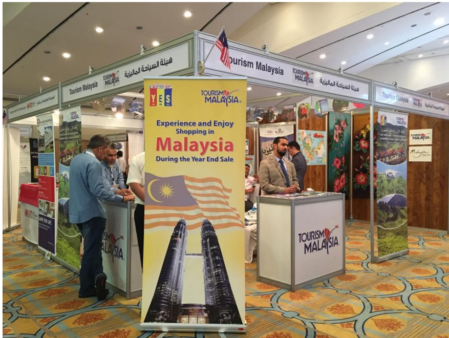
THE RIYADH TRAVEL FAIR 2016

Tourism Malaysia and the Malaysia Healthcare Travel Council (MHTC) participated at the Riyadh Travel Fair 2016 on 12-16 April 2016. The Malaysian booths were among the most visited reflecting the interest of the Saudis in particular, to visit Malaysia.