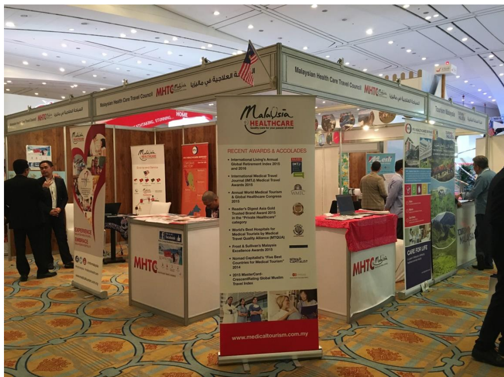
THE MALAYSIA HEALTHCARE TRAVEL COUNCIL (MHTC) BOOTH