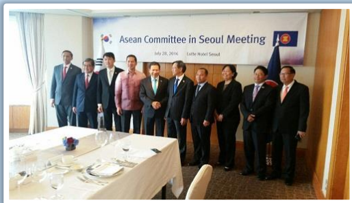
H.E. Ambassador with ASEAN Ambassadors