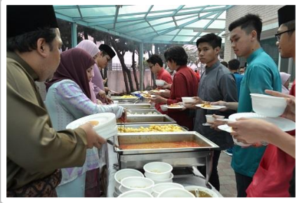
Malaysians in the Republic of Korea enjoying the food