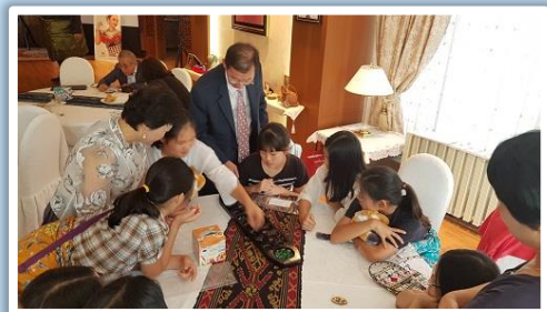
Korean school teachers and students enjoying the congkak