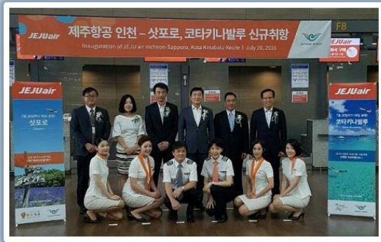
Director Tourism Malaysia with Jeju Air