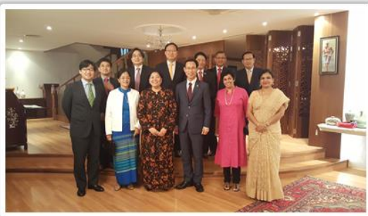
H.E. Ambassador with Vice Minister of Transport, MOLIT