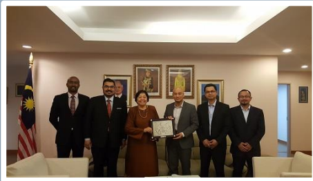
H.E. Ambassador receiving a souvenir from MISC Berhad