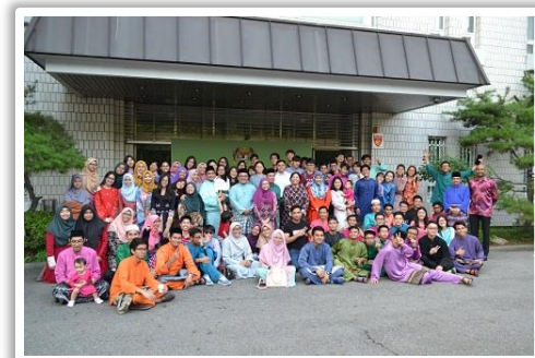
H.E. Ambassador with Malaysian students in the Republic of Korea who attended the Majlis Sambutan Hari Raya Aidilfitri