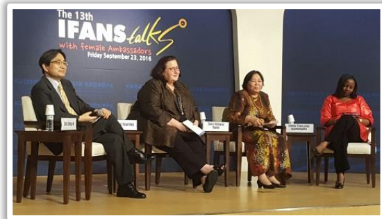
H.E. Ambassador at the Institute of Foreign Affairs and National Security (IFANS)