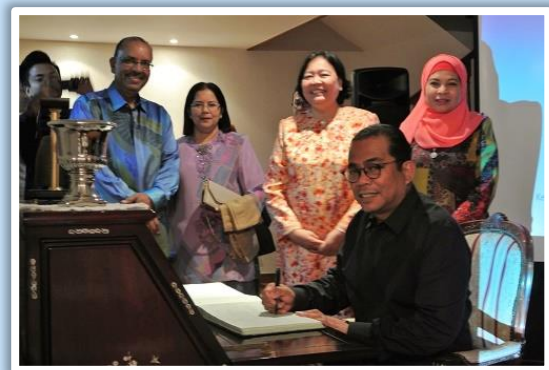
CM Johor signing the guest book