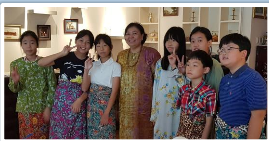
Korean school children trying the kain batik with H.E. Ambassadors

The Embassy of Malaysia organised a cultural awareness programme in collaboration with Tourism Malaysia, on 3 September 2016. The target group was local school children and their teachers. H.E. Ambassador presented an overview of Malaysia, which was followed by a quiz of Malaysia. The children also had the opportunity to try Congkak , Sepak Takraw and to try on the Baju Melayu and Kain Batik .