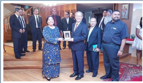
H.E. Ambassador receiving a souvenir from YB Dato' Seri Richard Riot

YB Dato' Seri Richard Riot Anak Jaem, Minister of Human Resources of Malaysia made a working visit to the Republic of Korea from 21-24 August 2016. During his visit, YB Dato' Seri had meetings with the Korea Research Institute for Vocational Education and Training (KRIVET), Global Institute for Transferring Skills (GIFTS) and Korea Employment Information & Services (KEIS).