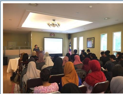
H.E. Ambassador sharing her experience with Malaysian students

The Education and Training Section of the Embassy of Malaysia organised a general etiquette and fine dining workshop on 10 September 2016. During the workshop, H.E. Ambassador shared her vast experience and knowledge on fine dining and etiquette with Malaysian students in the ROK.