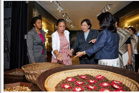
H.E. Ambassadors with other lady Ambassadors being shown the flowers used for skincare products by Amore Pacific.

The Embassy of Malaysia coordinated a visit among several lady Ambassadors to Amore Pacific factory in Osan. Amore Pacific is one of the largest skin care producers in the ROK, with leading brands such as Sulwasoo, Innisfree and Etude House.