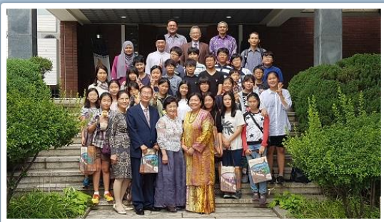
H.E. Ambassador and Embassy officials with Korean students and teachers