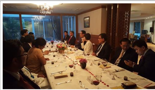
Guests enjoying the dinner

H.E. Ambassador hosted a dinner for Vice Minister of the Ministry of Land, Infrastructure and Transport (MOLIT) of the Republic of Korea on 15 July 2016. The guests included among others, the Deputy Minister for Multilateral and Global Affairs, Ministry of Foreign Affairs, President of the Institute of Foreign Affairs and National Security (IFANS), CEO of KORAIL, Ambassador of Brunei, Ambassador of Bangladesh, Ambassador of Myanmar, Ambassador of Laos and Ambassador of Sri Lanka.