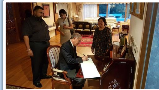
YB Dato' Seri Richard Riot signing the guest book at Ambassador's residence