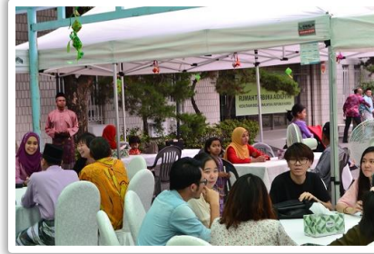
Guests relaxing and enjoying the day