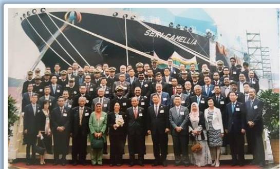
Group photo of the naming ceremony