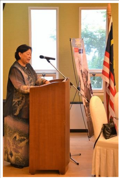
H.E. Ambassador addressing the guests