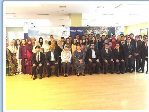
H.E. Ambassador and Embassy officials with Malaysian students