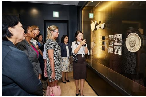
H.E. Ambassador and other Lady Ambassadors being guided on the history of Amore Pacific company.