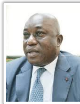
H.E. Ambassador of Cote d'Ivoire