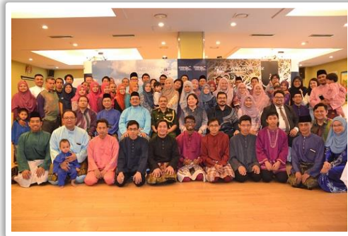
H..E. Ambassador with Malaysians attending the Flag Raising Ceremony.

Due to weather conditions the ceremony had to held in-doors.