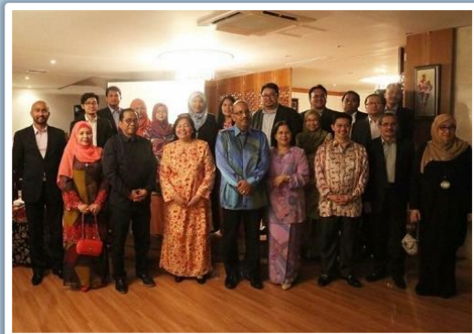
CM and KSN with the HBS at Ambassador's Residence