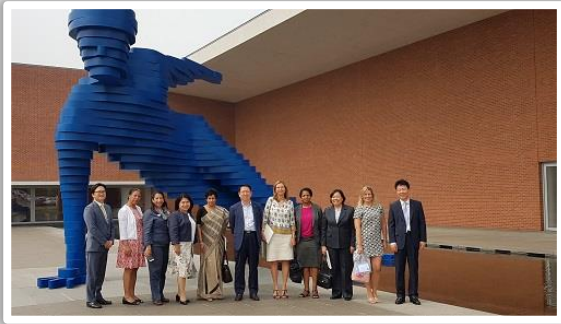
H.E. Ambassador and several lady Ambassadors with officials from Amore Pacific