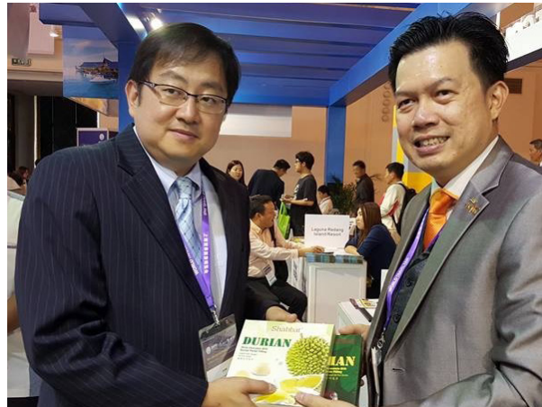
World Travel Fair (WTF) 2016 on 20 May 2016 China Leading International Tourism Marketplace