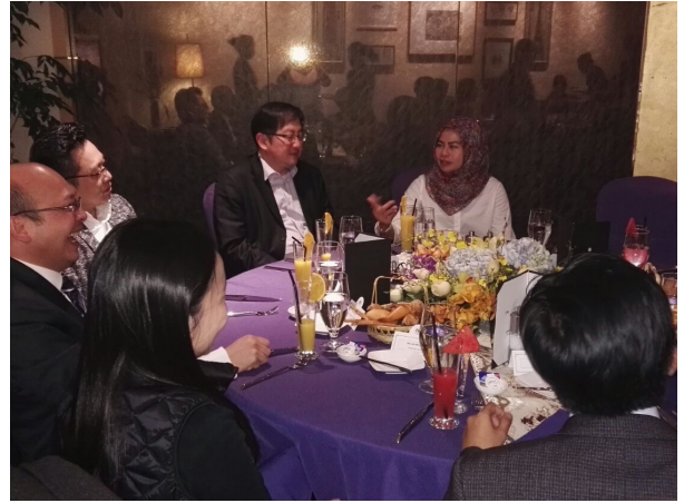
Networking Dinner with YBhg. Dato' Noraini Ahmad, Chairman of MATRADE and Diaspora at Guoman Hotel , 8 January 2016