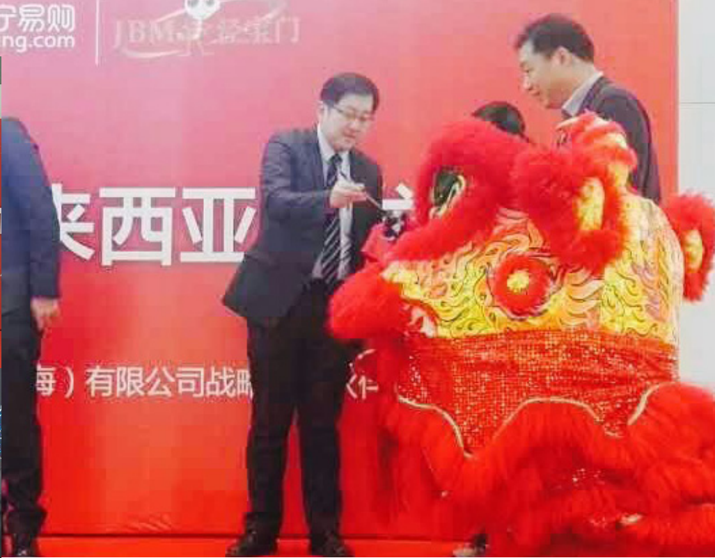
Suning E-Commerce Malaysia Pavilion Strategic Cooperation Agreement Signing 2 January 2016 Suning E-Commerce Platform Headquarters, Nanjing