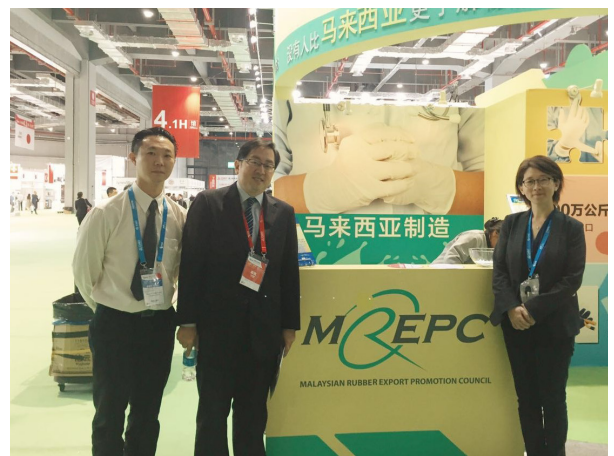
Malaysian Rubber Export Promotion Council (MREPC) together with 12 Malaysian Rubber Medical Device (RMD) manufacturers are in CMEF Spring Shanghai from 17 to 20 April 2016 at National Exhibition and Conference Center (NECC)