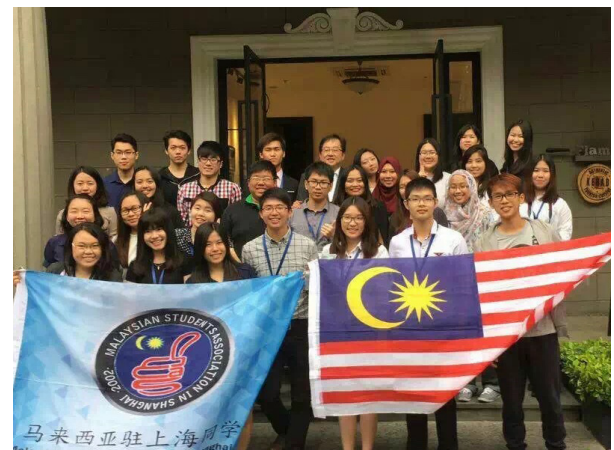
Malaysia Student Association in Shanghai (MSAS) Farewell Gathering and Committee Election Day 2 May 2016 at Taste and See Restaurant, Shanghai