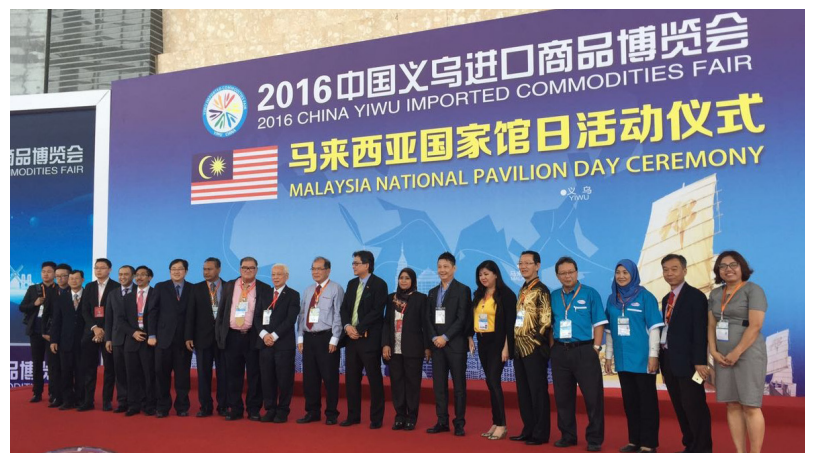
H.E Ambassador Dato' Zainuddin Yahya officiated the Malaysian Pavillion in China Yiwu Imported Commodities Fair 12 - 14 May 2016 Yiwu International Expo Center