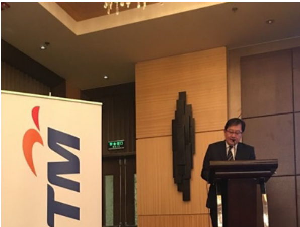
Lunch Event Organized by Telekom Malaysia and Nova 30 August 2016