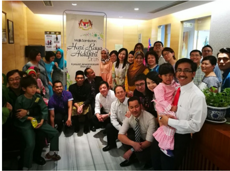
Hari Raya Aidilfitri Consulate General of Malaysia in Shanghai 27 July 2016

Consulate General of Malaysia in Shanghai hosted a Hari Raya Aidilfitri Gathering with Malaysian community in Shanghai. The foods was prepared by PERWAKILAN Ladies in Shanghai. Consul General took this opportunity to wish “Selamat Hari Raya” to all guest and presented “Duit Raya” to the children.