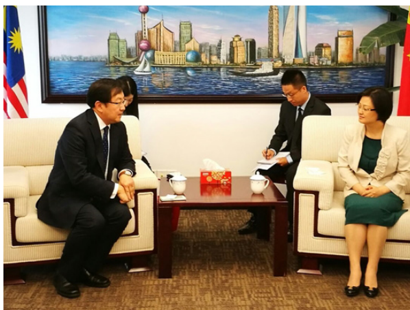
Courtesy Call to Deputy Director SCOFCON 26 September 2016