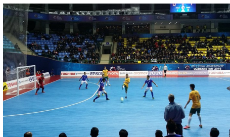
Malaysia vs Australia