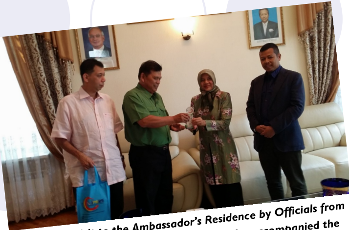
A courtesy visit to the Ambassador's Residence by Officials from the Federal Territory of Kuala Lumpur who accompanied the boxing team