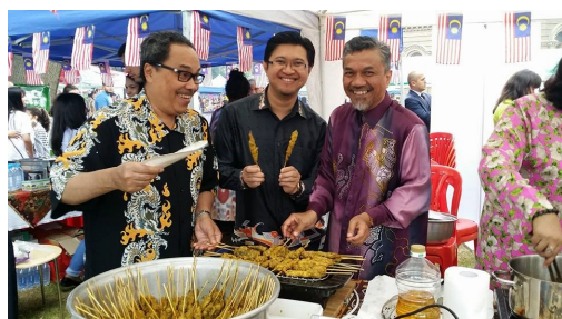
Satay cooking live demonstration

The Embassy of Malaysia in Tashkent once again participated in the International Food and Cultural Festival organized by the Diplomatic Service of the Ministry of Foreign Affairs of Uzbekistan. This colorful event was held on 14 May 2016 at the historic and scenic MFA's Guest House which is