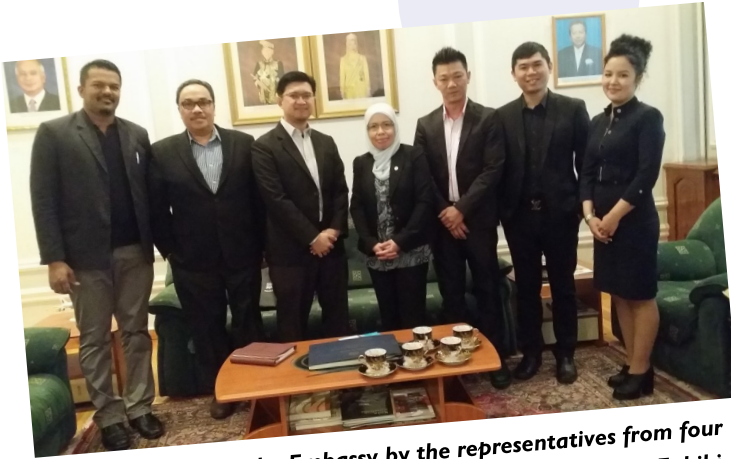
A courtesy visit to the Embassy by the representatives from four Malaysian universities who participated in the Education Exhibition in April 2016