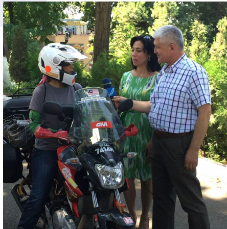
Interviewed by Uzbek media