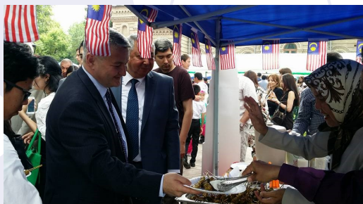
His Excellency Khakimov Dilyor, Deputy Minister of Foreign Affairs of Uzbekistan was served satay by the Ambassador

The Embassy of Malaysia in Tashkent once again participated in the International Food and Cultural Festival organized by the Diplomatic Service of the Ministry of Foreign Affairs of Uzbekistan. This colorful event was held on 14 May 2016 at the historic and scenic MFA's Guest House which is