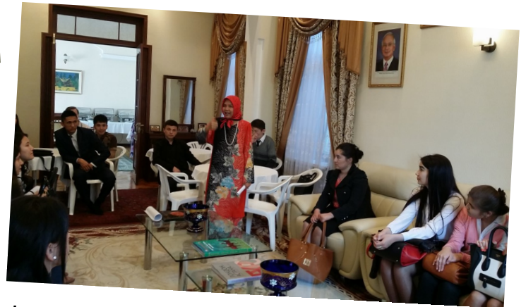
Interactive Session with the Bahasa Malaysia Students at Ambassador's Residence on 27 February 2016.