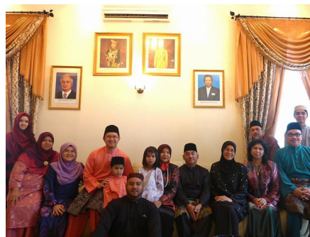
Celebrating Eid ul-Fitr with Malaysian community in Tashkent