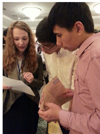
Interested students at the Malaysian universities booths

eration in Uzbekistan. The exhibition was held in three major cities in Uzbekistan namely Tashkent, Samarkand and Bukhara from 22 to 27 April 2016.