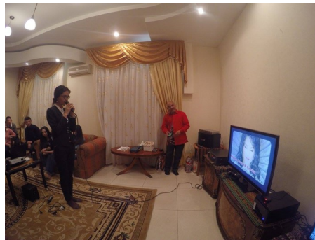
Crooning to Siti Nurhaliza's 'Bukan Cinta Biasa'

Apart from that, they also had a chance to savor some Malaysian traditional food such as nasi goreng , fried noodles, curry puff, sweet cakes and other desserts wholly prepared by the Embassy's Home Based Staff.