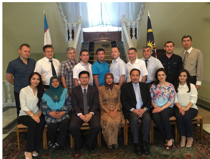
The Ambassador with the Home Based and Local Staff of the Embassy at the former Chancery building before moving to new site