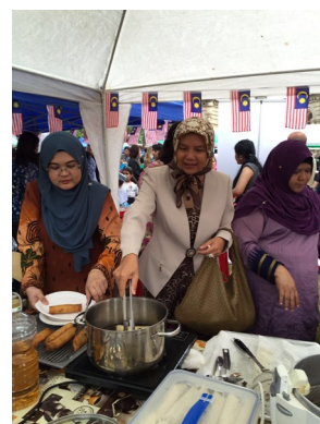
We also had spring rolls cooking demonstration

Other than satay, visitors to our corner had a chance to savor our tasty spring rolls, an assortment of cakes and Malaysian favorite drink, teh tarik (milk tea). The food was prepared by the Ladies Association of the Embassy (PERWAKILAN).