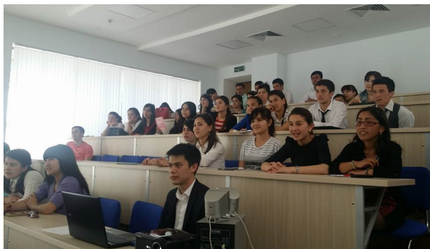
Part of the audience