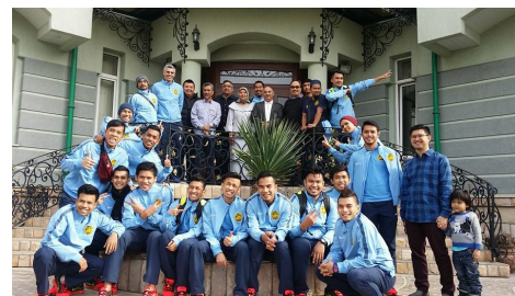
The National Futsal Team at the Ambassador’s Residence

The Ambassador also hosted a luncheon to the Team at her residence on 8 February 2016. She also took the team for a taste of local cuisine at the Plov Center which is located not far from the tournament venue.