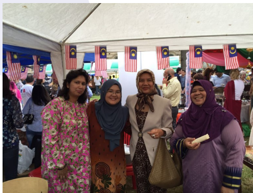
PERWAKILAN led by the Ambassador herself

located not far from Mustakiliq (Independence) Square.