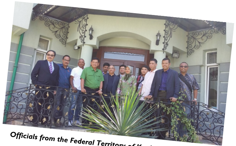
Officials from the Federal Territory of Kuala Lumpur with the Ambassador at her Residence