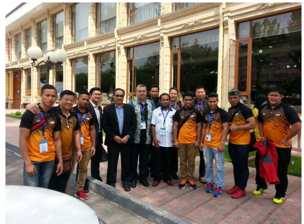
Luncheon hosted by the Embassy at a local restaurant