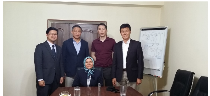
The Ambassador with the local businessmen who are also Friends of Malaysia