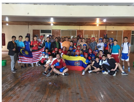
The team with members of one of the local boxing clubs

A group of athletes and officials from the Federal Territory of Kuala Lumpur Boxing Team was in Tashkent from 16 to 20 May 2016 to practice with the members of the local boxing clubs and participate in friendly matches. This visit was part of the preparation by the Kuala Lumpur Boxing Team towards the 16th SUKMA Games which is scheduled to be held in Sarawak in July 2016.