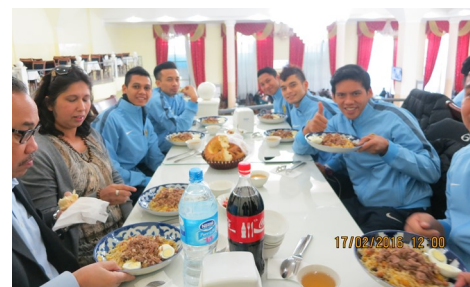
Savoring the delicious Uzbek cuisine “Plov”