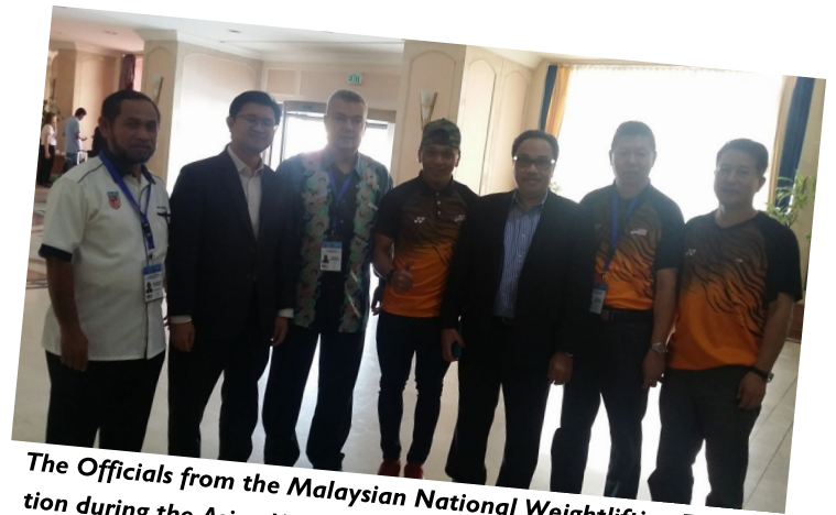
The Officials from the Malaysian National Weightlifting Federation during the Asian Weightlifting Qualifying Championship for the Olympics, April 2016