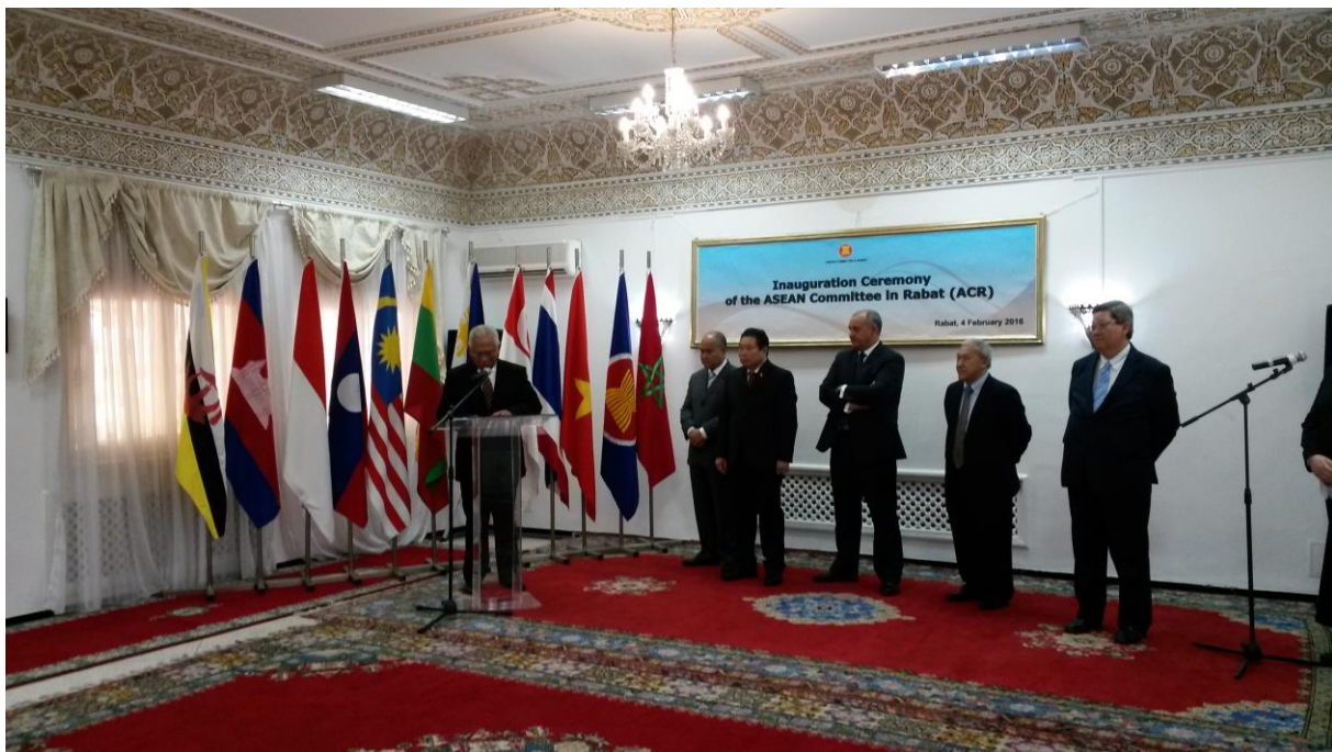
Ambassador of Indonesia delivering his speech