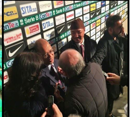
TYT Dato' Abdul Samad Othman being interviewed by local press.