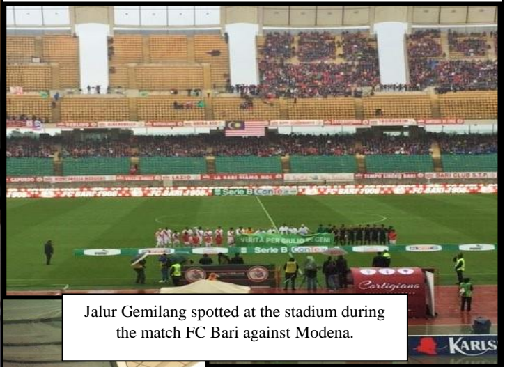
Jalur Gemilang spotted at the stadium during the match FC Bari against Modena.