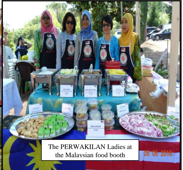
The PERWAKILAN Ladies at the Malaysian food booth