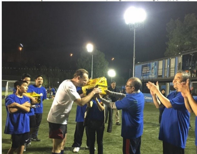
All ASEAN Ambassadors played at the game against the U.S. Embassy team.

ASEAN-USA Friendship Futsal Game held at Club Rinconada, Santiago Chile this evening. (Friday, 1/4/2016).