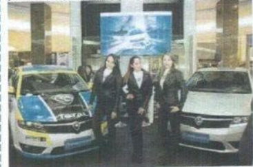
Proton Holdings Bhd launching the Preve in Chile. Proton is re-entering the Chilean market through its partnership with Andes Motor, the country's leading distributor of buses, trucks and luxury cars.

The standard and executive variants come with 107 horsepower, ISO newton metres and a five-speed manual gearbox. The premium variant has the turbo-charged engine with a seven-speed continuously variable transmission Protronics mode that can go from 0-100km in