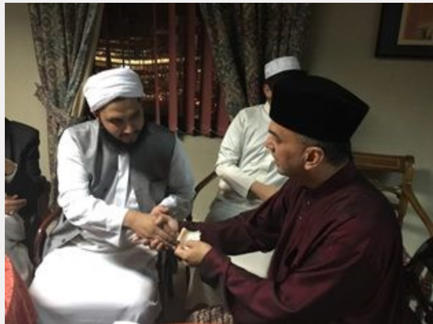
Paying of Zakat and Tarawikh Prayer at the Embassy of Malaysia in Santiago.

Meeting held between the Embassy and the Chilean Business Community after prayers at the Embassy of Malaysia in Santiago, Chile.