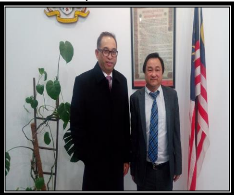
Charge d'Affaires a.i. with Ambassador of Brunei Darussalam