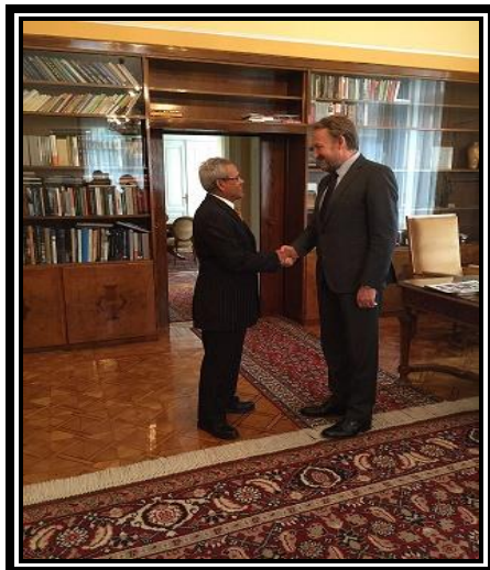
Ambassador with BiH Chairman President Bakir Izetbegovic