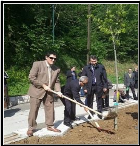
Mayor of the Stari Grad and Chairman of the Municipality Council of Stari Grad