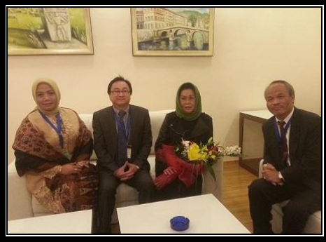
Charge d'Affaires a.i. with Ambassador designate of Indonesia to BiH on his left