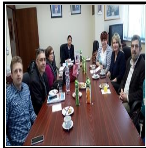
Minister Counsellor with the Committee members of MTCP Alumni Association, Bosnia and Herzegovina