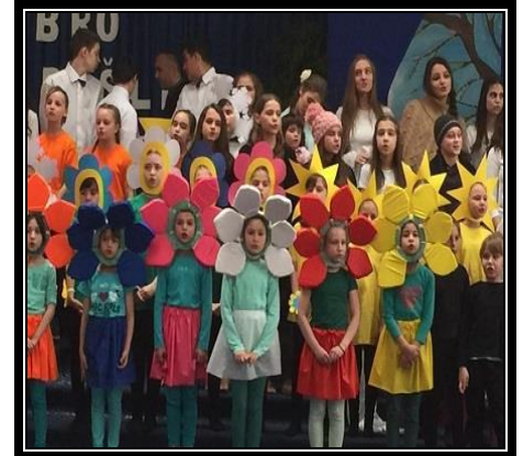
Primary students of Camil Sijarac School