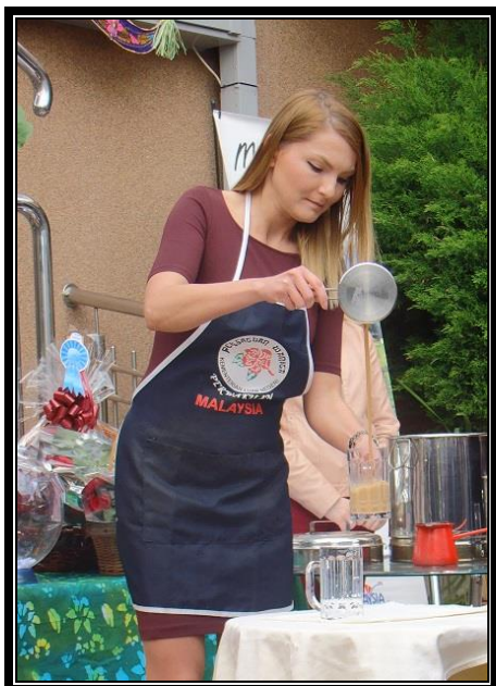
Teh Tarik competition

The Annual Gathering of Malaysian Technical Cooperation Programme (MTCP) Alumni Association of BiH was held on 18 May at the official residence of the Ambassador of Malaysia. The event was jointly organized by the Embassy of Malaysia and the MTCP Alumni Association of BiH.