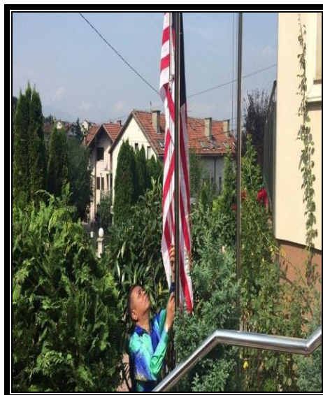
Flag being raised in conjunction with Merdeka Day

The Flag Raising Ceremony was held on 31 st August at the official residence of Ambassador of Malaysia.