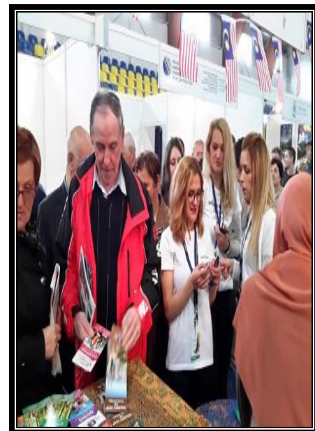
Embassy's booth being visited by the public

The 14th International Tourism Fair "List" was held on 14 th May in Lukavac, Tuzla about four hours drive from Sarajevo.