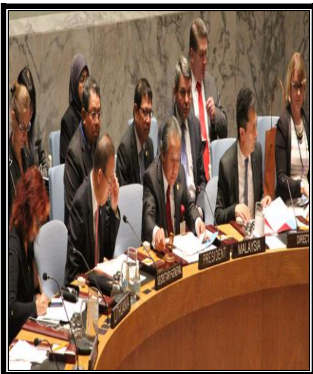
Foreign Minister of Malaysia seen delivering statement during Malaysia's Presidency at UNSC

For the second time, Malaysia has assumed the presidency of the United Nations Security Council effective Aug 1, 2016. Malaysia held the Security Council Open Debate on the issue of Children and Armed Conflict (CAAC) on Aug 2. UN Secretary-General Ban Ki-moon