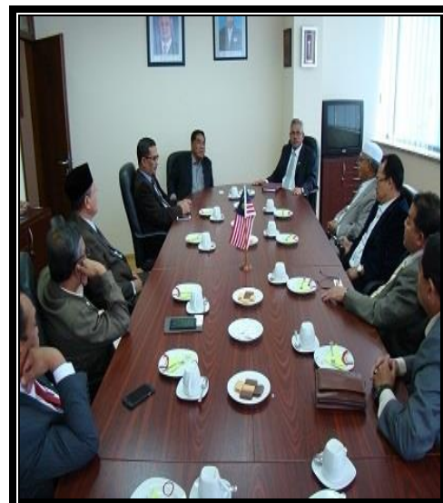
Members of State Assembly and former government officials from Kedah met Ambassador of Malaysia