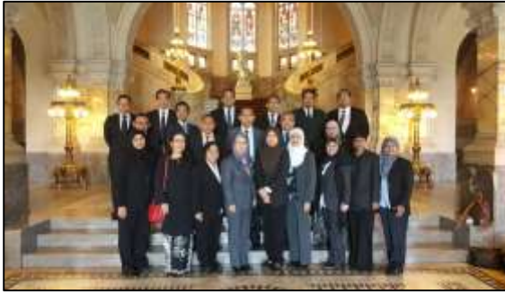
Working Visit of Malaysian Judges to ICC, ICJ and PCA, 19 May 2016