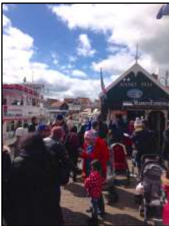
PERWAKILAN Day Out to Volendam and Marken, 16 April 2016