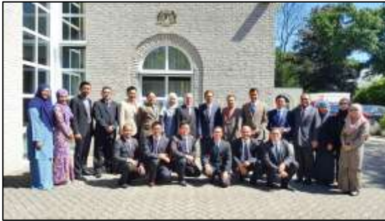
Working Visit of PPM (Persatuan Peguam Muslim Malaysia) to the Embassy of Malaysia in The Hague, 18 July 2016