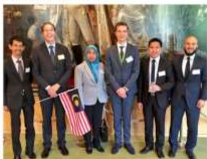
27/05/2016, 1:58 PM