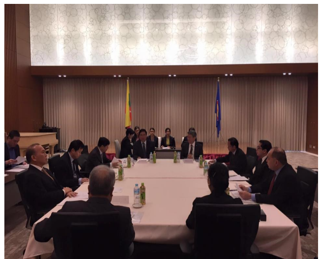
The first meeting under Myanmar's Chairmanship: The 273rd ASEAN Committee in Tokyo (ACT) meeting at the Embassy of the Union of Myanmar on 24 February.