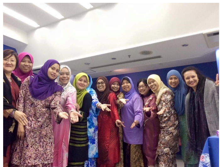
The 34th Perwakilan Meeting at Kami-meguro staff apartment.