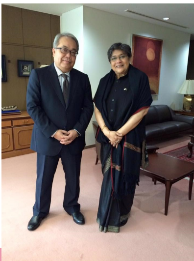
Courtesy call by HE Rabab Fatima, the new Ambassador of Bangladesh to Japan.