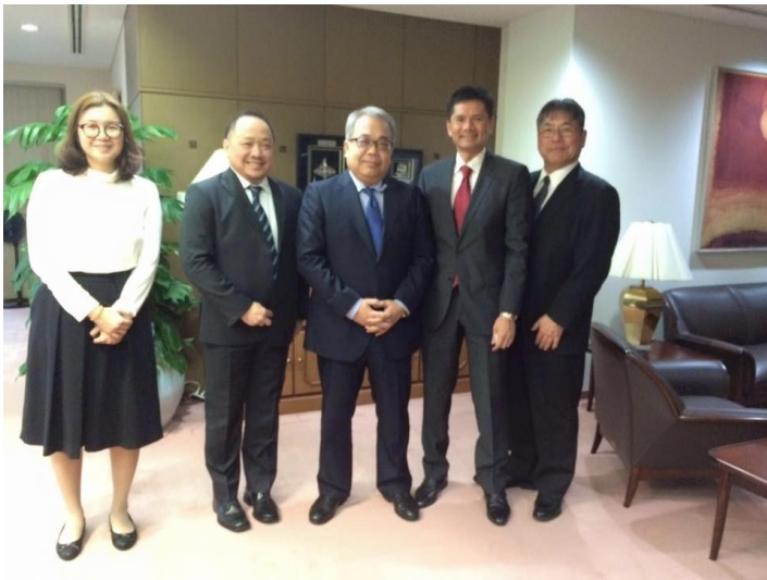
Courtesy call on HE Dato' Ahmad Izlan by the delegation from Invest KL led by its CEO, Datuk Zainal Amanshah.