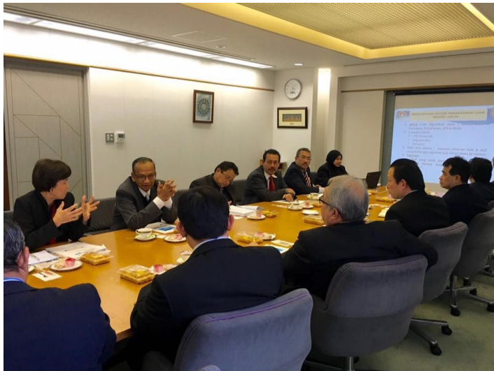
The exit conference at the end of the Auditor General of Malaysia's visit to the Embassy on 25 March.