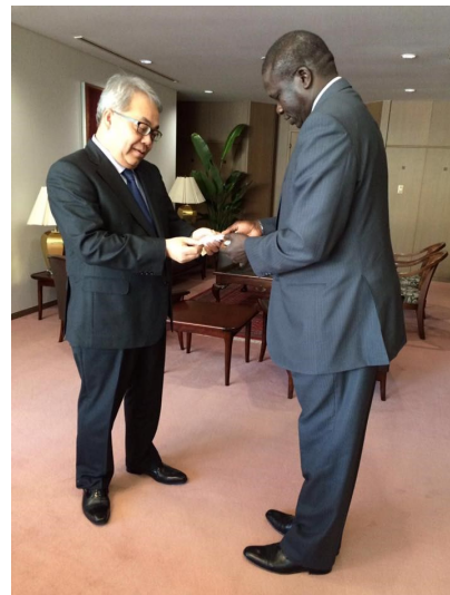
Courtesy call by HE Cham Ugala Uriat, the new Ambassador of Ethiopia to Japan.