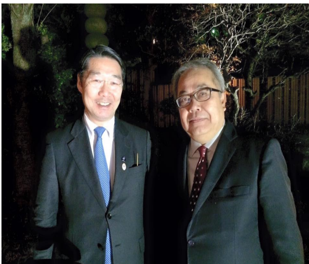
Sports and Cultural Exchange Reception hosted by Hon. Minister Hironori Hase, Minister of Education, Culture, Sports, Science and Technology (MEXT).