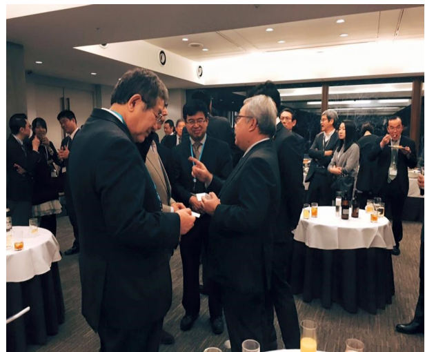
New Year Reception by Japan and Tokyo Chambers of Commerce and Industry at the Imperial Hotel on 5 January.