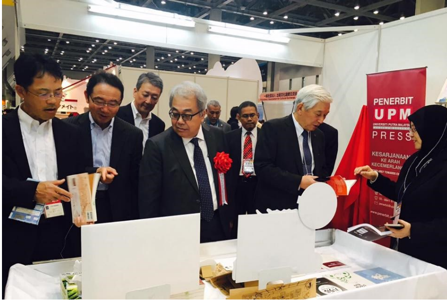
HE Dato' Ahmad Izlan at the opening ceremony of Tokyo International Book Fair at Tokyo Big Sight on 23 September 2016.