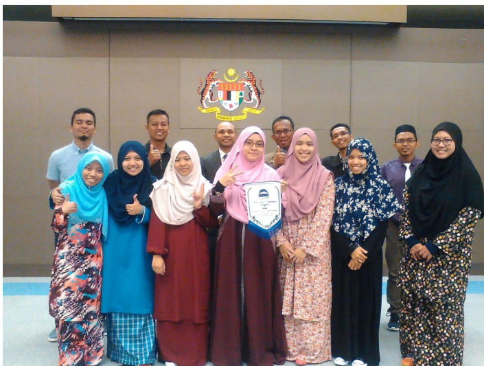
Study visit by students from the Islamic Science University of Malaysia (USIM) . The student's visit was part of their study tour to Japan from 24-28 July 2016.