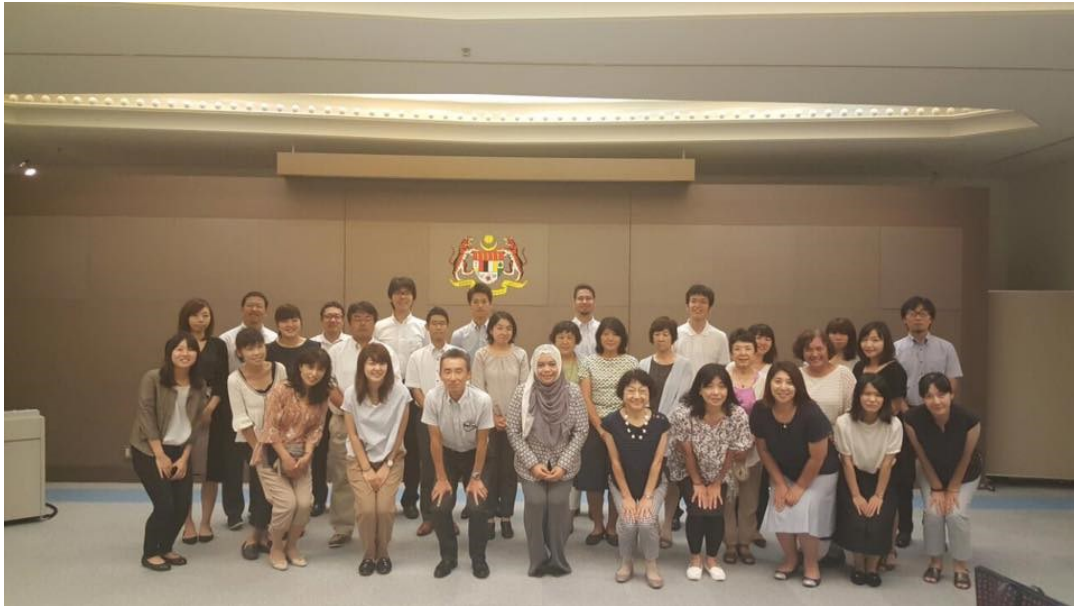
Study visit by teachers from the International Education Study Group of Kawasaki City's public elementary school.

The outreach programme by the Embassy continues in the third quarter of the year. The Embassy received students from the Kawasaki City's public elementary school, Yuhana's English Tutorial , Kizaki Junior High School and Islamic Science University of Malaysia (USIM) .