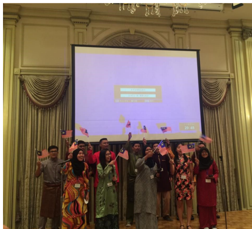
Students from University of Malaya representing Malaysia at the Opening Ceremony of 2016 Asian Students Environment Platform (ASEP) at Waseda University Tokyo. Seven prestigious universities from Asia were selected in this year's programme