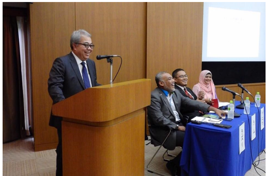
The Ambassador giving his opening remarks at the Symposium on Islamic and Finance with Application in Malaysia organized by Japan Malaysia Association at International House of Japan.