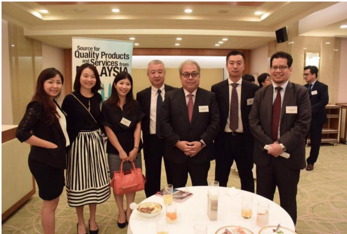
The Ambassador at the networking lunch reception with Japanese Digital Content Players organized by MATRADE Tokyo at the Imperial Hotel. The reception was held in conjunction with the Export Acceleration Mission on Creative Multimedia & Content Industry to Japan 12-17 September 2016.