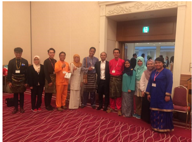
Malaysian participants and Embassy officers at the Presentation and Farewell Party JENESYS 2016 Inbound Program in Tokyo (above)