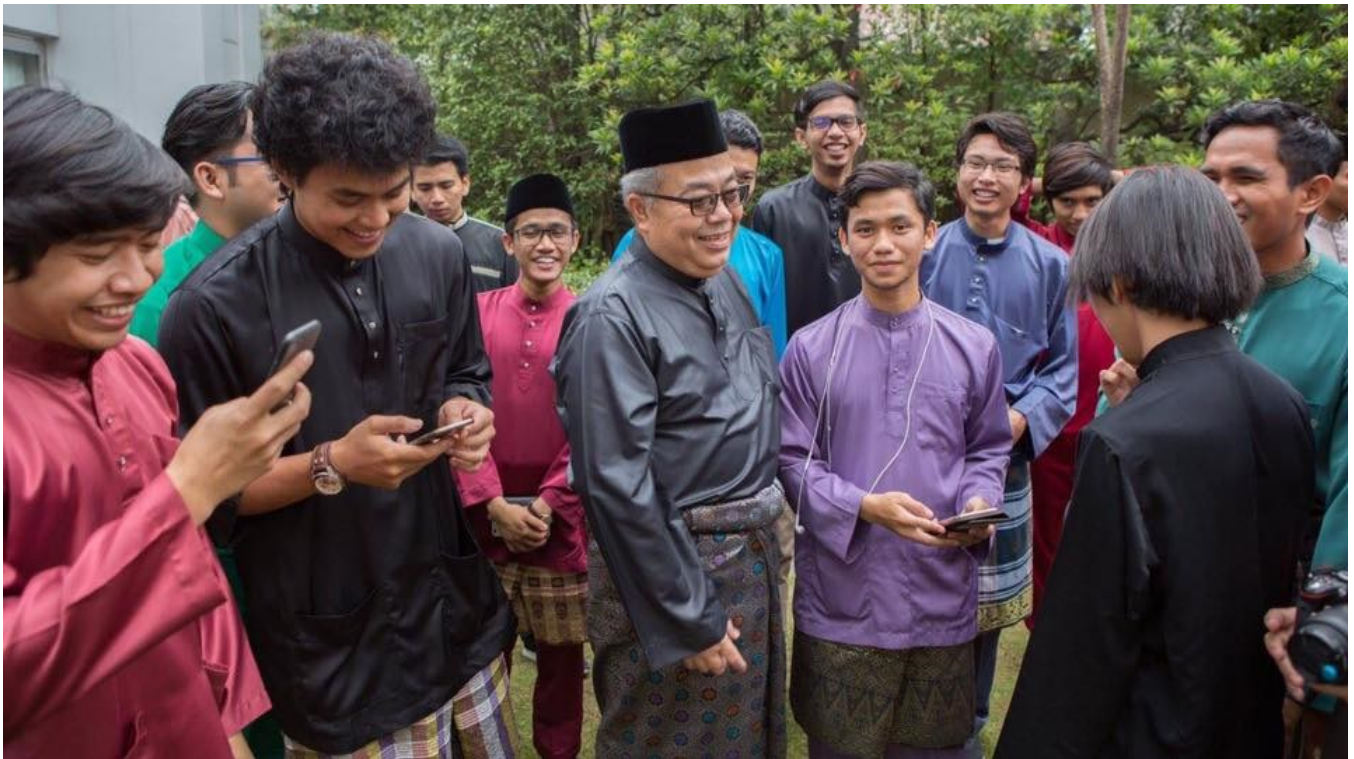
The Ambassador with the Malaysian students at the Embassy's open house

The Embassy hosted the Hari Raya open house for the Malaysia students and diaspora on 6 July 2016. Close to 500 Malaysians and friends of Malaysia attended the event. Various Malaysian dishes were served including the well sought after by Malaysians abroad, satay. The Aidil Firti prayer was also organized at the Embassy hall.