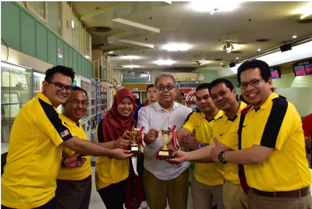
The ACT Bowling Tournament 2016. Congratulations to the Malaysian team for the second runner up trophy as well as for the individual category (female).