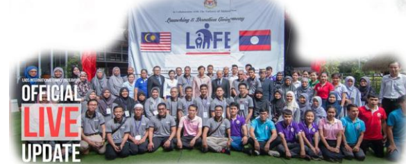
Outreach Programme 3/2016 with the students from the Cyberjaya University College of Medical Sciences (CUCMS) Malaysia on 14 July 2016