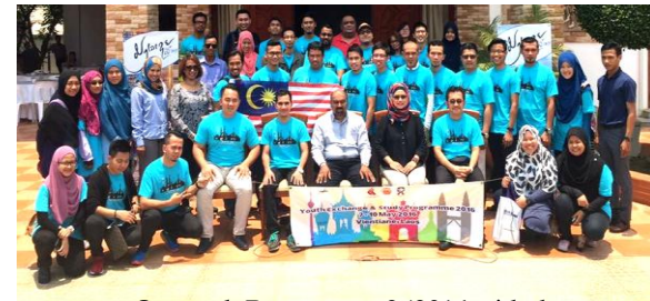
Outreach Programme 2/2016 with the International Youth Centre, Malaysia on 7 May 2016