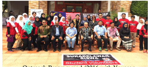
Outreach Programme 1/2016 with Yayasan Sukarelawan Siswa on 26 March 2016

The Embassy will continue to embark on such an initiative throughout the 50 th anniversary commemorative year of bilateral relations in collaboration with the universities and colleges in the Lao PDR.