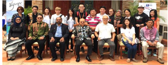
Outreach Programme 1/2016 with the Malaysian Smile Action Team, a registered NGO aiming to organise dental outreach programmes in the Lao PDR, on 26 March 2016