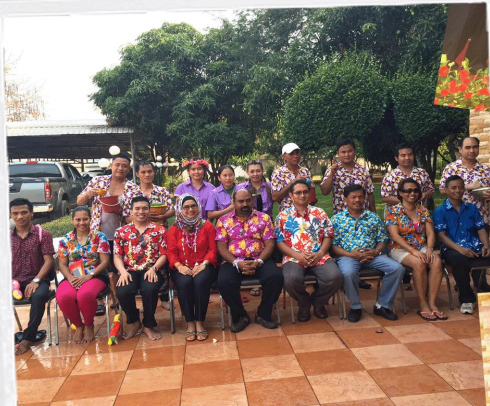
The Lao New Year or famously known as Pimai Lao for the year 2016 was hosted by the Embassy of Malaysia in Vientiane to celebrate the festival with LRS of the Embassy