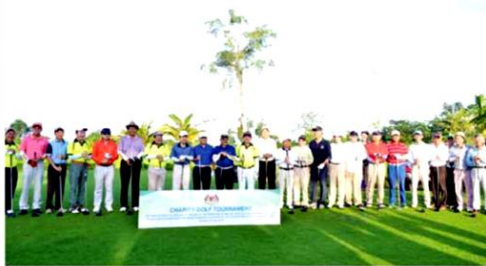
Ministers and senior officials attend the opening ceremony of a charity golf tournament at the Long Vien Golf Club in Vientiane on Saturday.

The Embassy of Malaysia also wanted to express its appreciation for the generous contributions and support given by both the players and event sponsors.