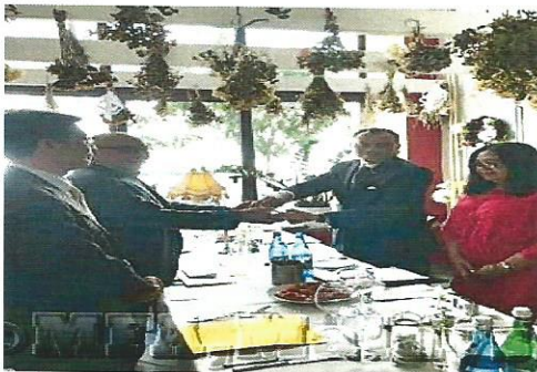
Current Chair of ASEAN Committee in Warsaw (ACW) August 2016 to February 2017