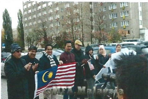
'KEMBARA PAHANG'S' in Warsaw for 'Visit Pahang Year 2017'