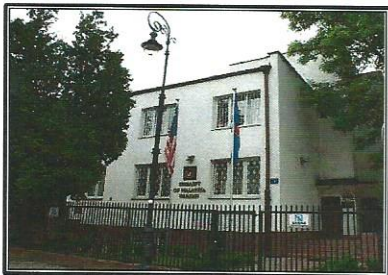
THE EMBASSY OF MALAYSIA , WARSAW, REPUBLIC OF POLAND