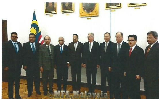
Working visit by YB Senator Dato' Sri S.A Vigneswaran, Speaker of Dewan Negara to Warsaw, Poland – 18-21 September 2016