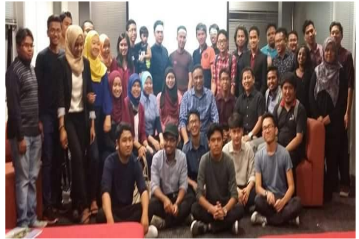
Meeting with Malaysian students in Auckland