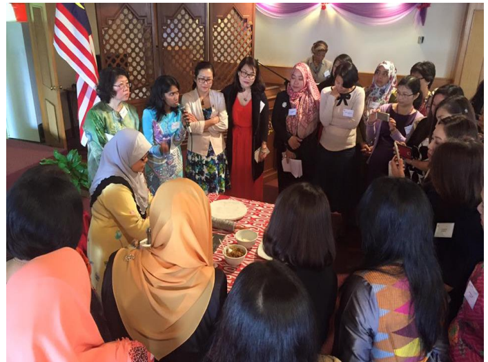
ALC members paying attention to the "Kariapap Pusing" demonstration