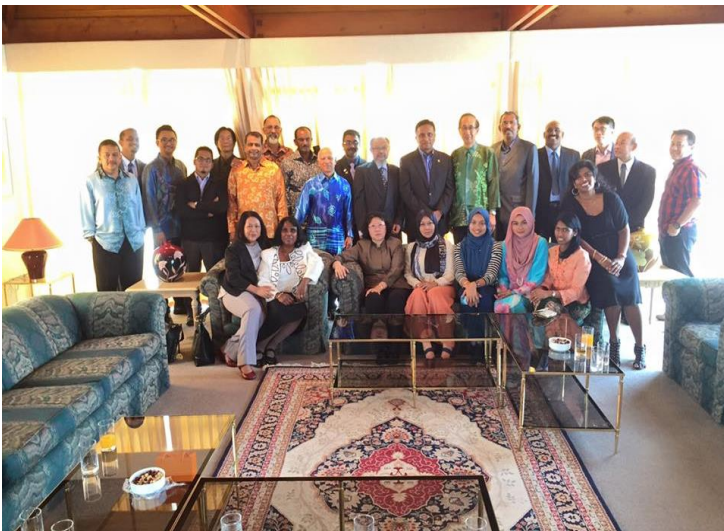
At Rumah Malaysia, Official Residence of the High Commissioner