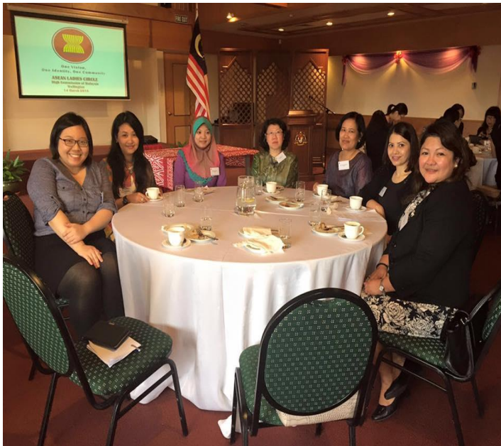
At ALC Lunch event on 14 March 2016