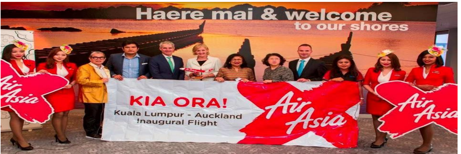
Arrival at Auckland International Airport, 23 April 2016