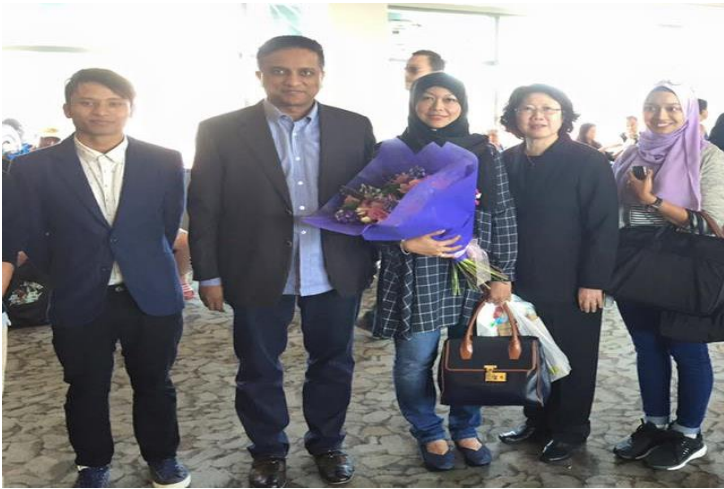
Arrival at Wellington Airport

While in New Zealand, YB DFM who is also the Chairperson of the UMNO Bureau of Malaysian Overseas Students, met with Malaysian students in Auckland (21 February), Queenstown (23 February) and Wellington (24 February), before departing Auckland in the early hours of 26 February 2016.