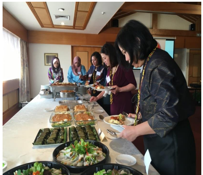
Various national dishes from the 6 ASEAN Missions in Wellington