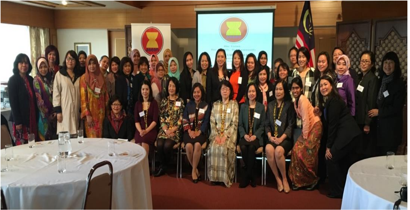
ALC members posing for a group photo