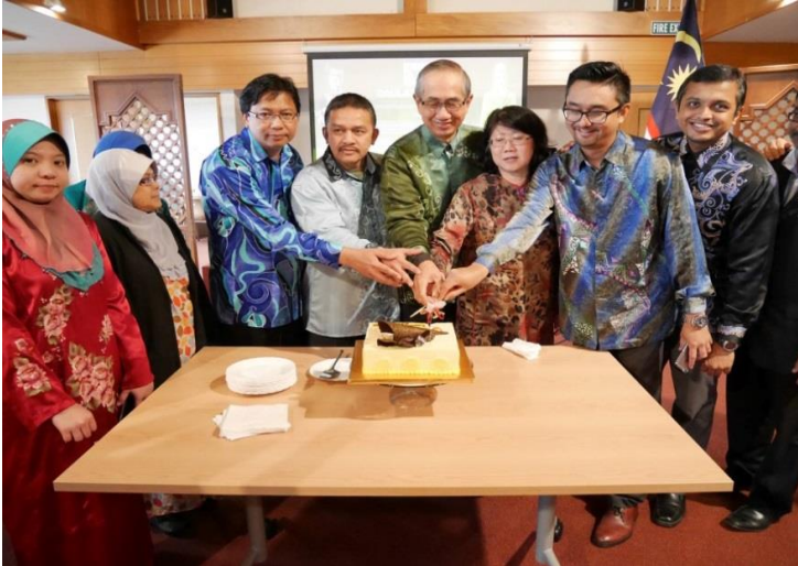
Birthday Cake to mark the auspicious Hari Keputeraan of Seri Paduka Baginda Yang di-Pertuan Agong

The auspicious event was welcomed by all the Malaysian staff at the High Commission. Some twenty Malaysian university students in Wellington were invited to share the significance in celebrating the occasion.