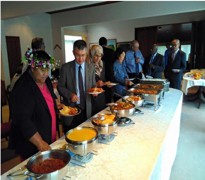
Diplomats and Guests enjoying the spread of Malaysian food at Rumah Malaysia, Wellington