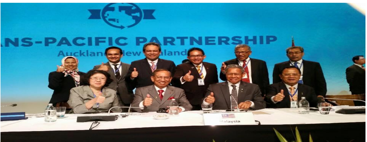
The Malaysian Delegation after the TPPA Signing Ceremony