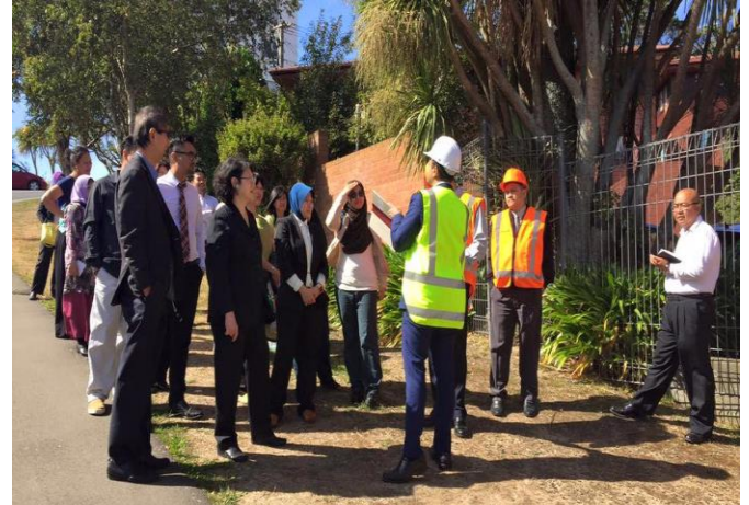
Gathering of staff outside the High Commission during the Emergency Drill