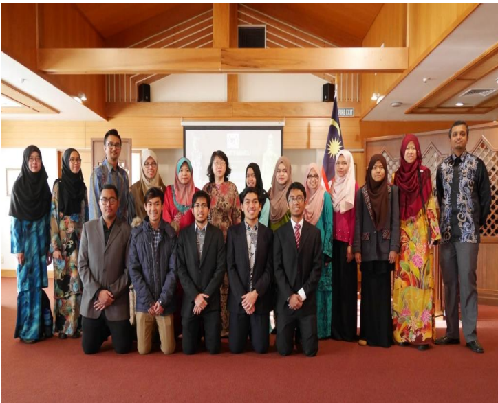
Malaysian students from Victoria University in Wellington at the event.