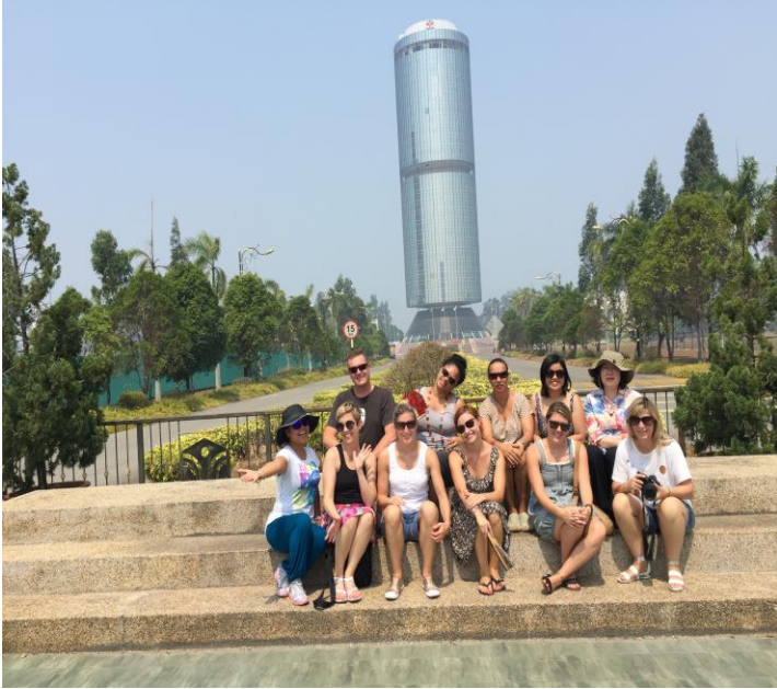
With Kiwi media and Travel agents