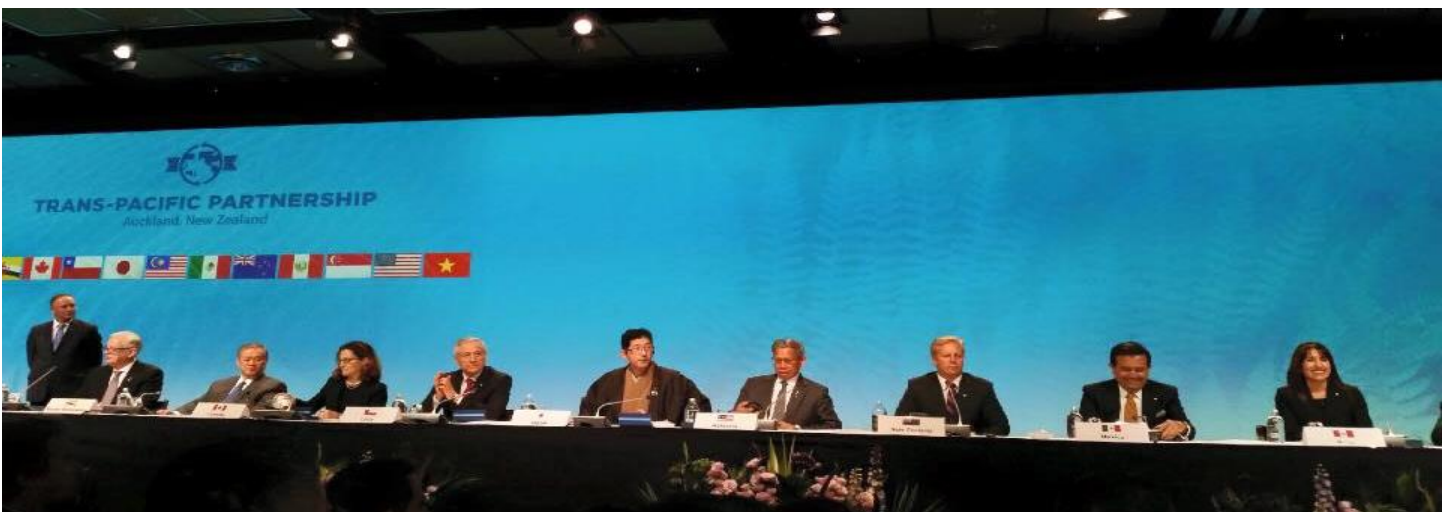
TPPA Signatories with NZ Prime Minister John Key at the Signing Ceremony at SkyCity Convention Centre.