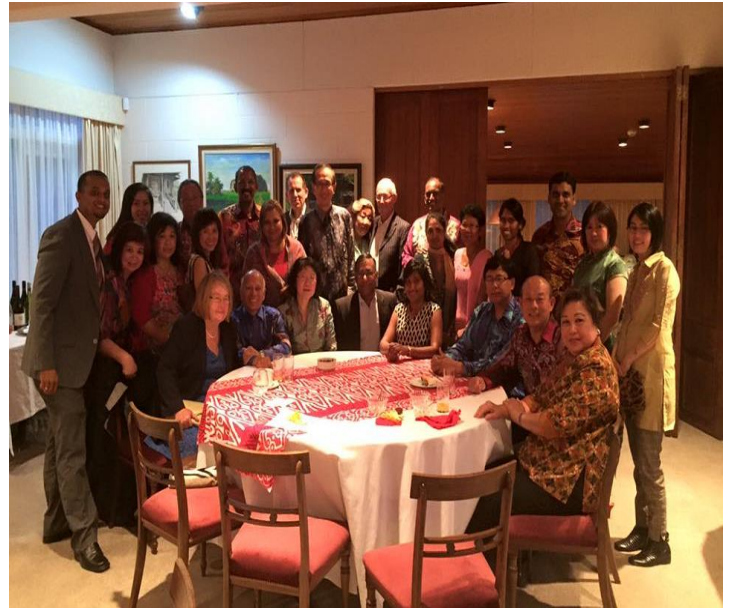
With the LRS and fellow Malaysians at Rumah Malaysia