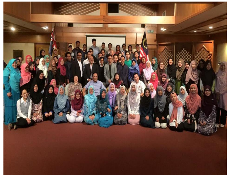
Dinner with Malaysian students at the High Commission of Malaysia IN Wellington