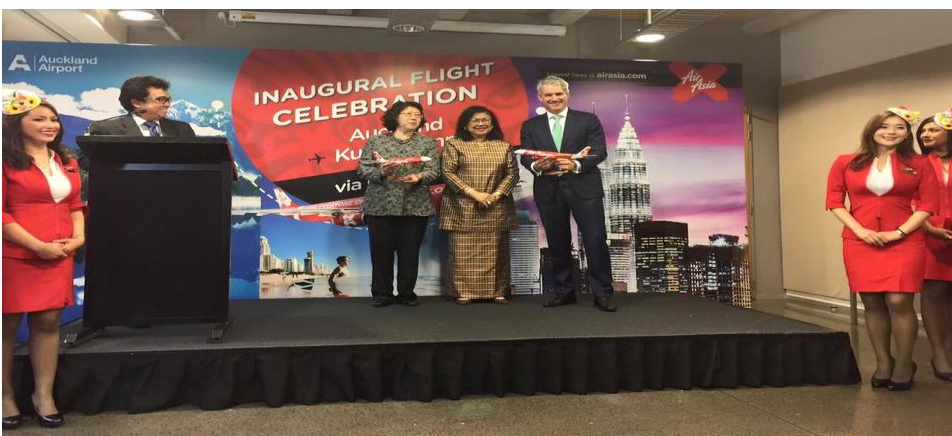
Media Launch of Air Asia X Inaugural flight from Kuala Lumpur to Auckland.