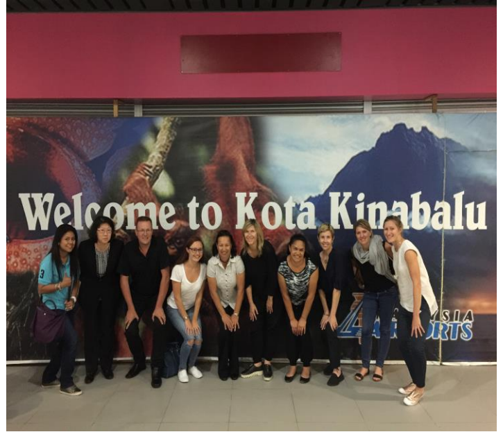
At Kota Kinabalu, part of the AirAsia familiarization trip