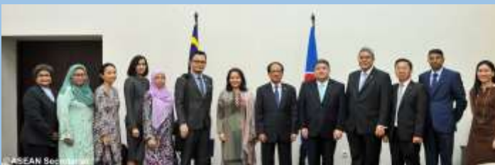
Presentation of Letter of Credence Ceremony at the ASEAN Secretariat