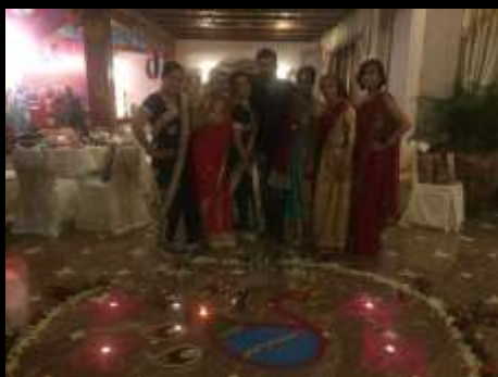
Bollywood Night hosted by PERWAKILAN Jakarta on 9 December 2016