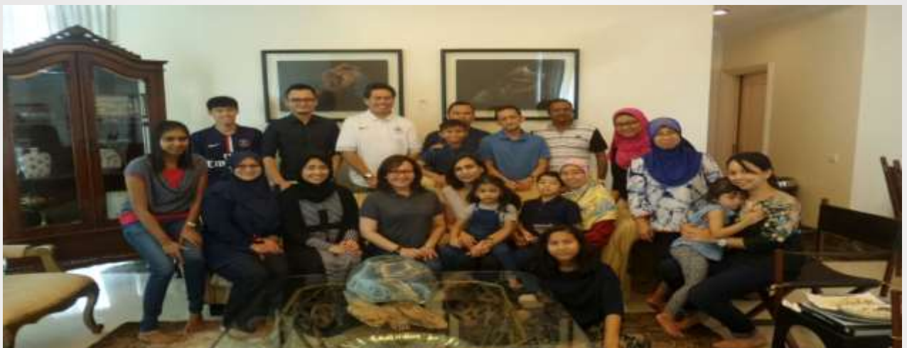
Welcoming Lunch hosted by the Deputy Permanent Representative of Malaysia to ASEAN