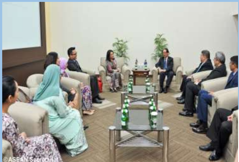
Audience with H.E. Le Luong Minh, Secretary General of ASEAN