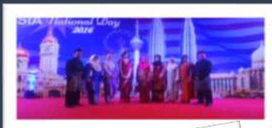
Flag Raising Ceremony on 31 August 2016 and National Day Reception with KBM Jakarta On 7 September 2016