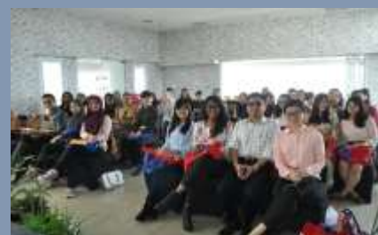
Students from Institut Pertanian Bogor

After the briefing by the Permanent Representative of Malaysia to ASEAN, all officers and students engaged in a fruitful discussion on issues pertaining to ASEAN. The interactive session was as a success as it went on for over an hour with questions posed by students on a myriad of issues relating to ASEAN. The Permanent Mission of Malaysia to ASEAN also hosted lunch following the interactive session.