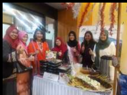
ASEAN Woman Circle Annual Charity Bazaar