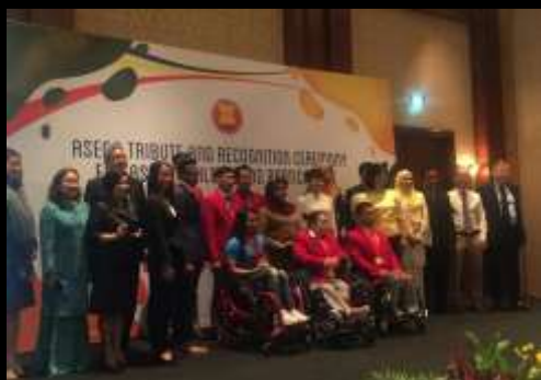
Permanent Representatives and Rio Olympics medalists pose together during an event organised by the ASEAN Secretariat to honor our sporting heroes.