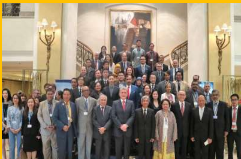
Participants and Speakers of the 5 th ASEAN-UN Workshop

The two-day workshop was the latest in an annual series of ASEAN-UN regional workshops on political-security cooperation since the ASEAN-UN Comprehensive Partnership was adopted by the Leaders of ASEAN and the United Nations Secretary-General in November 2011.