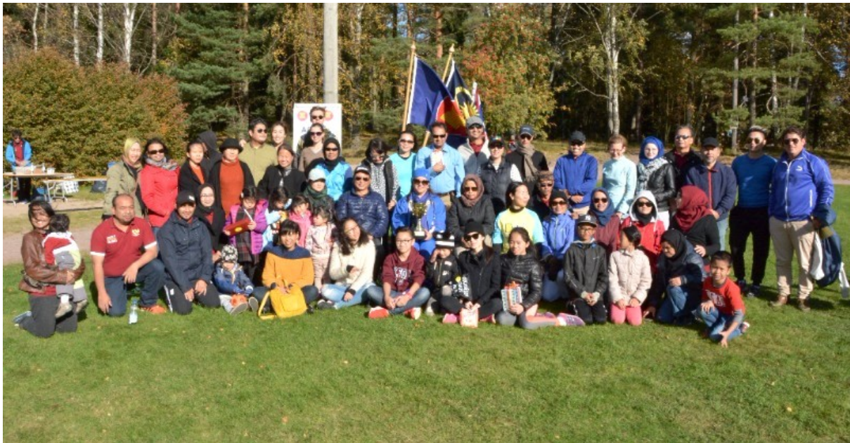
Members of ASEAN Embassies in Helsinki and their families on ASEAN Family Day 2016

Members of ASEAN Embassies in Helsinki and their families got together on Saturday, 1 October 2016 for an ASEAN Family Day at the Laajasalo sports park in Helsinki.