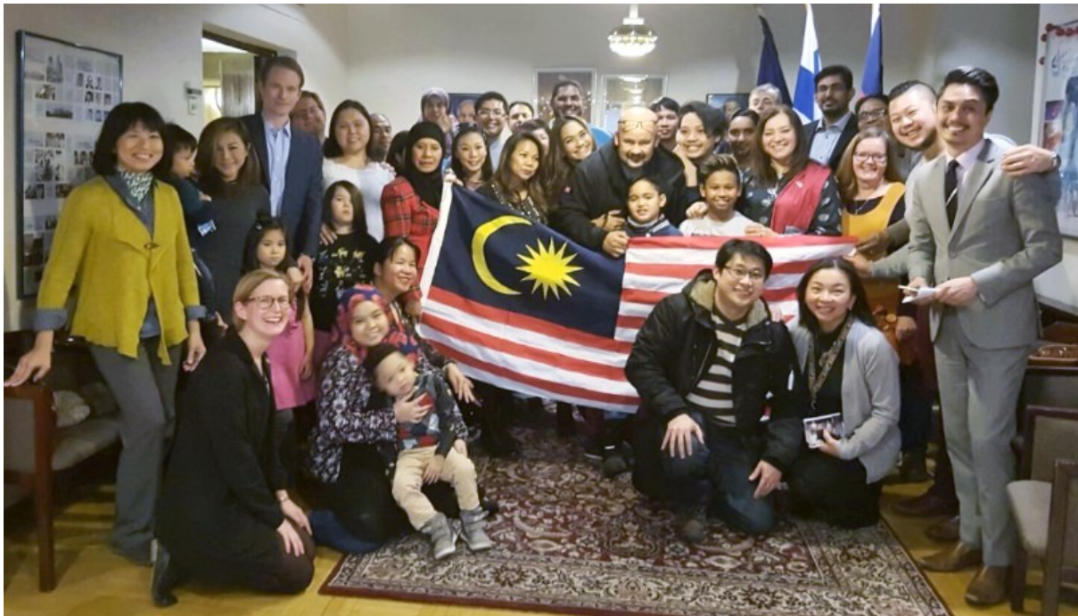
Malaysians in Finland with Mr. Harith Iskander, World's Funniest Person 2016