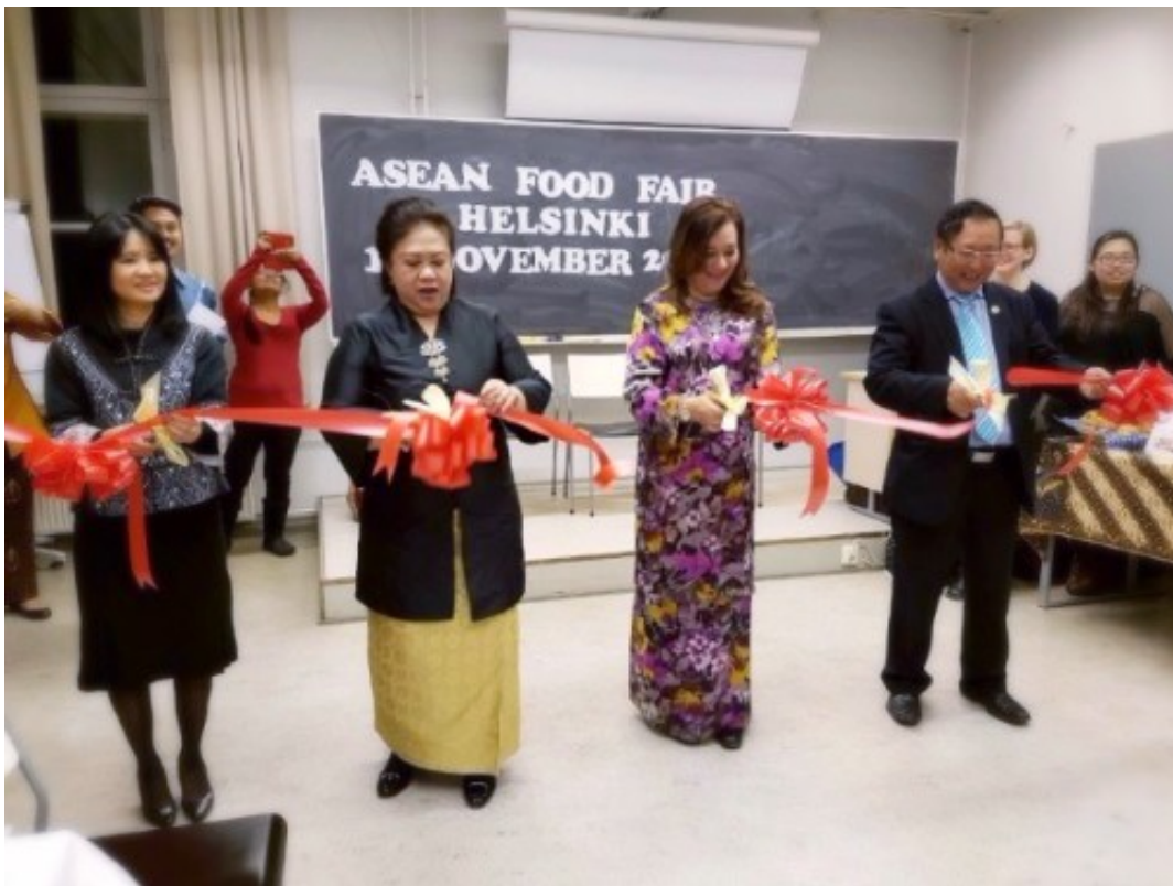
ASEAN Ambassadors (Indonesia, Malaysia, Vietnam) and Chargé d'affaires (Thailand) in the ribbon cutting ceremony for the ASEAN Food Fair

About 200 people attended the food fair celebrating Southeast Asian food cultures organised by some of the ASEAN Embassies in Helsinki in the concept of the Restaurant Day. The main organiser of the event was the Embassy of Malaysia in Helsinki as the chair of the ASEAN Helsinki Committee. The event included booths selling Malaysian, Indonesian, Thai, Philippine and Singaporean food.