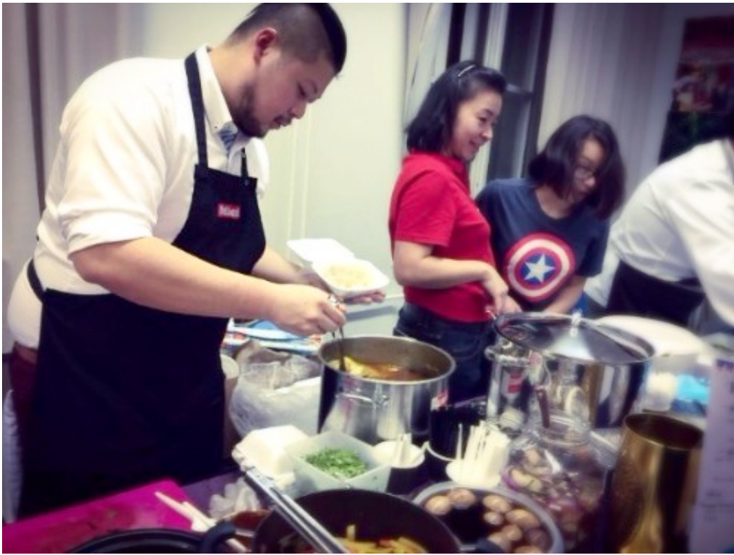
Malaysian food stand at the ASEAN Food Fair