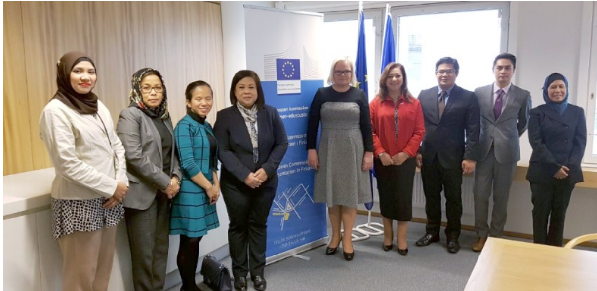
ASEAN Embassies visit to the European Commission representation in Helsinki

The ASEAN Embassies in Helsinki undertook a familiarisation visit to the European Commission office in Finland on Thursday 29 September 2016.