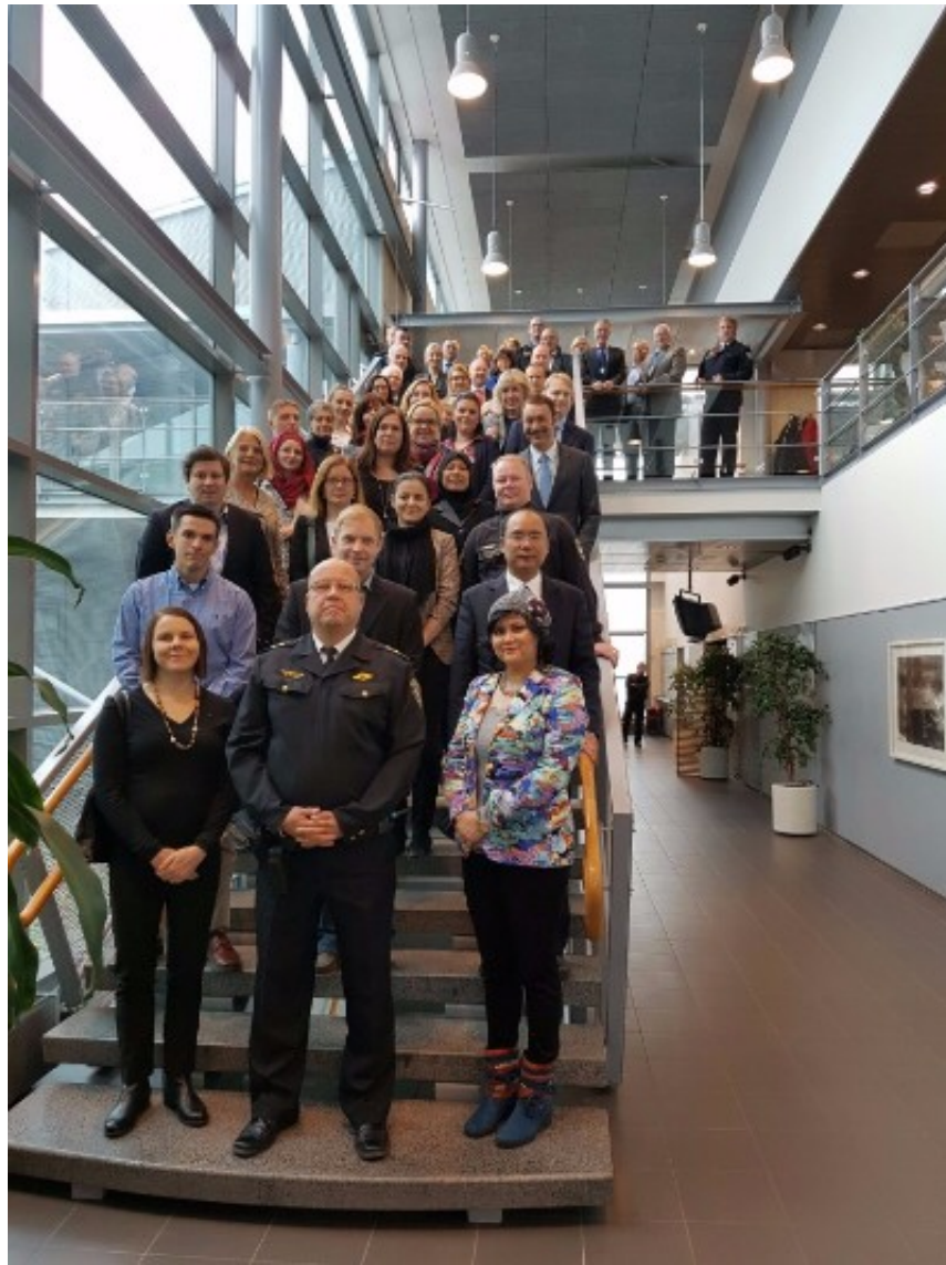
Participants at the visit to the Keski-Uusimaa Rescue Department