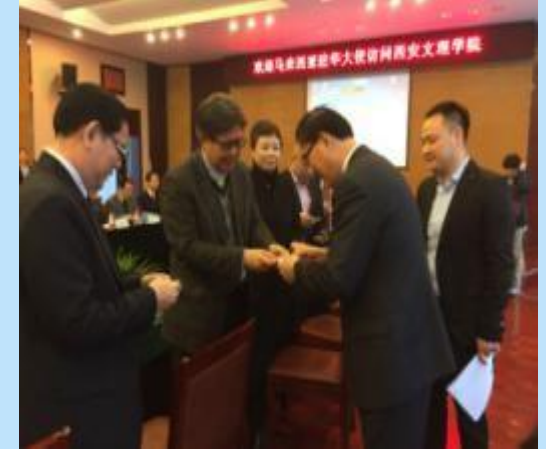
Visit to Xi'an University, Shaanxi Province, 28 March 2017