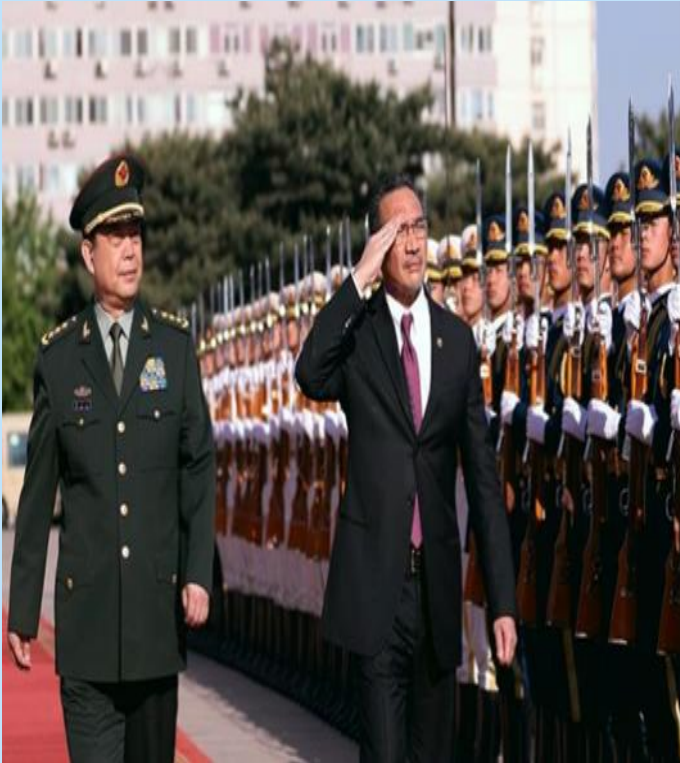
The Hon. Datuk Seri Hishammuddin Tun Hussein inspecting the Guard of Honour