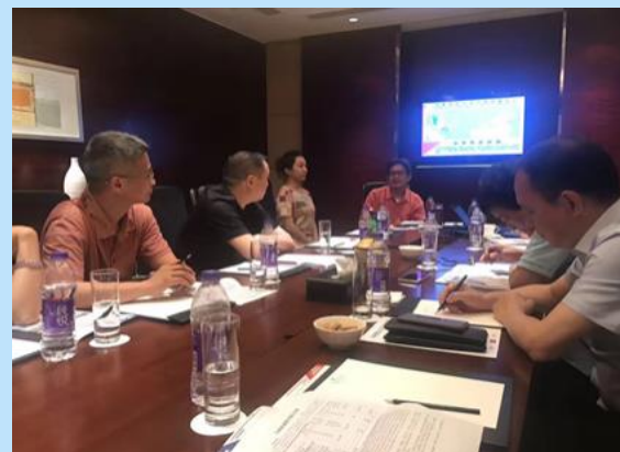
Meeting with 12 Senior High School Principals in Chengdu, Sichuan Province, 9 June 2017