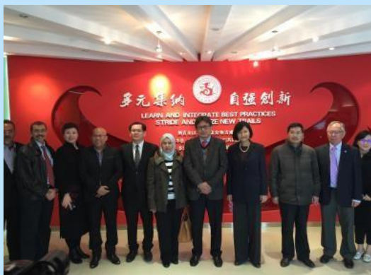
Visit to Xi'an University of Architecture and Technology, Shaanxi Province, 29 March 2017