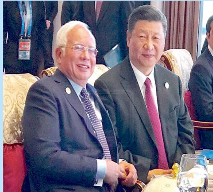
YAB PM was given the privilege to sit beside President Xi during the BRF working luncheon