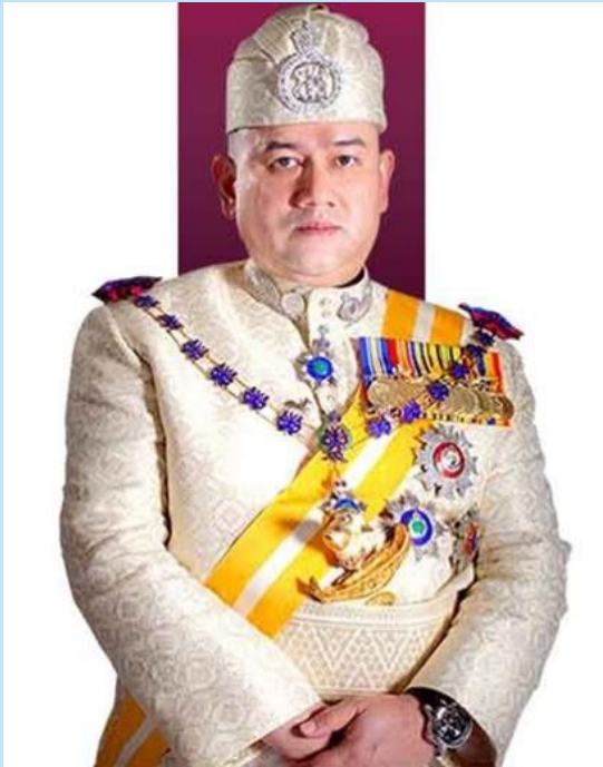
SULTAN MUHAMMAD V