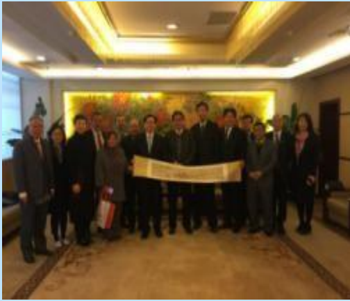
Visit to Department of Education, Shaanxi Province, 27 March 2017