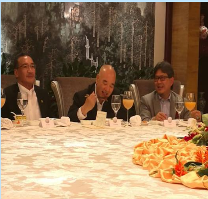
The Hon. Datuk Seri Hishammuddin Tun Hussein and H.E. Dato' Zainuddin Yahya having a light moment at a dinner reception hosted by General Xu Qiliang

"Both countries also agreed on the need to give serious attention to the global security landscape which is fast changing and becoming more challenging..." Hon. Datuk Seri Hishammuddin Tun Hussein.