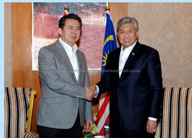
YAB DPM meeting with Interpol President, Meng Hongwei