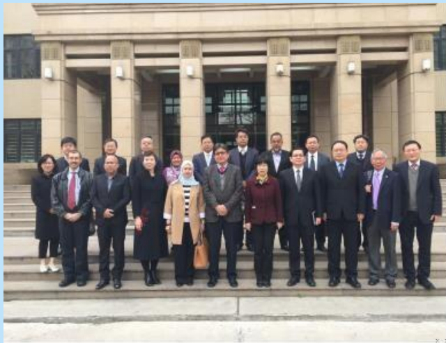
Visit to Xi'an International University, Shaanxi Province, 29 March 2017