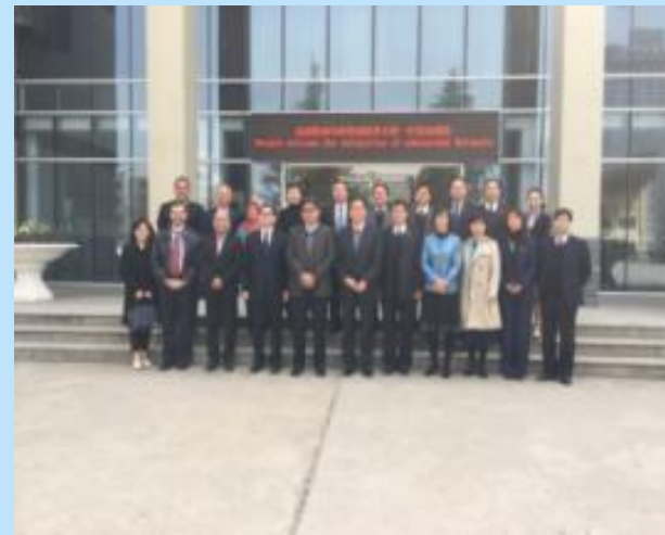
Visit to Xi'an University of Technology, Shaanxi Province, 28 March 2017