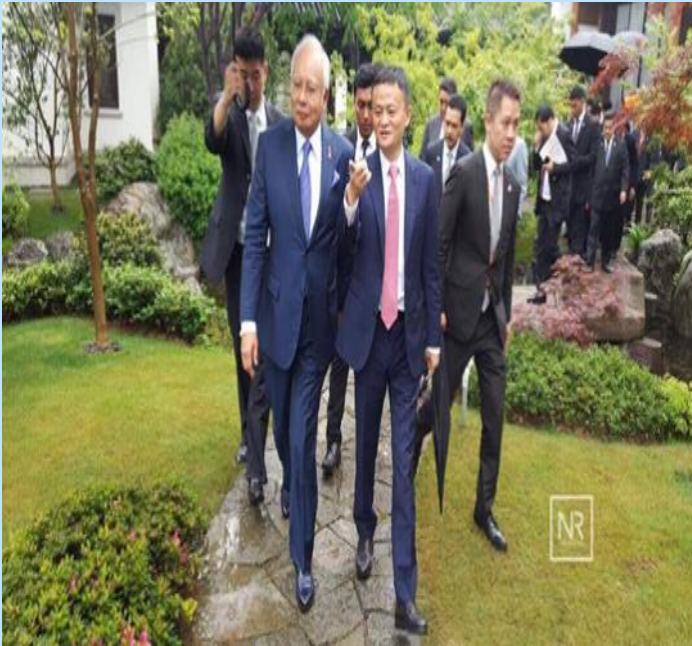
YAB PM and Alibaba Founder Jack Ma during the former's brief stopover in Hangzhou