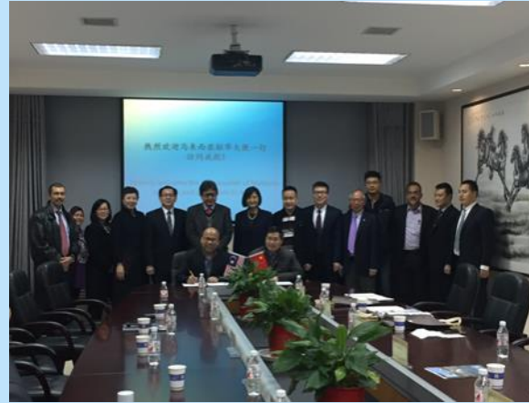
Visit to Fashion Engineering University, Shaanxi Province, 29 March 2017