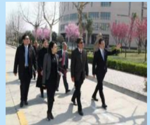
Visit to Peihua Xi'an University, Shaanxi Province, 27 March 2017