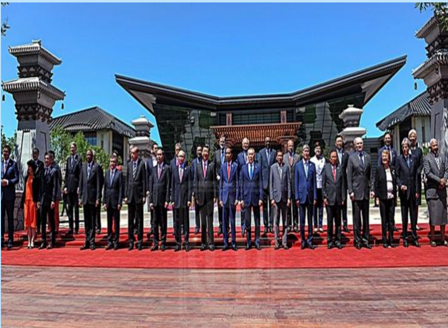
YAB PM together with 28 Leaders at the BRF