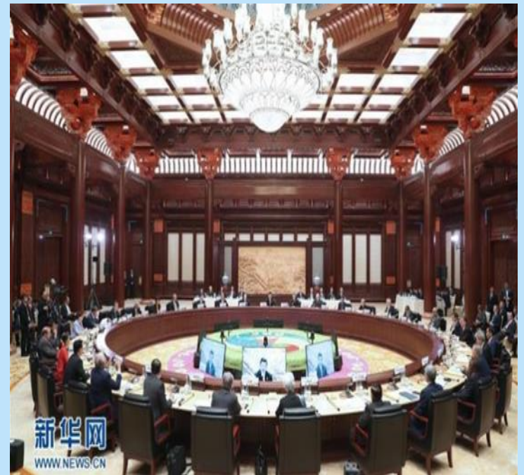
BRF Leaders' Round Table Meeting