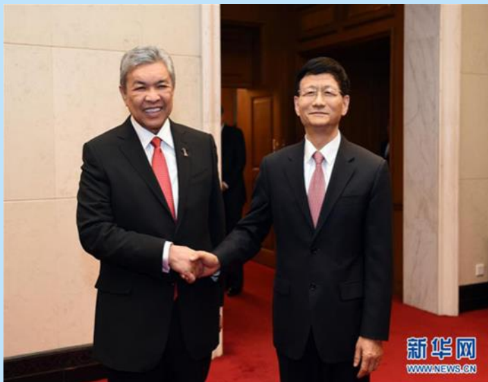
YAB DPM with H.E. Meng Jianzhu