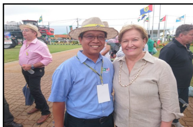
Ambassador with Senator Ana Amélia.

center of a region where it is grown over 500,000 hectares (including the Federal District, Goiás, Minas Gerais and Bahia) and soil conditions and climate representative of the Brazilian Midwest, allows the Fair spread innovations and conduct business the best companies in the industry with competent farmers and interested in technology.