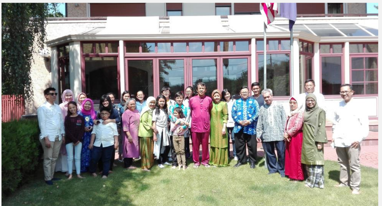
Bersama para tetamu dari Kedutaan Besar Indonesia, Bucharest, 26 Jun 2017

"Kami, wargakerja di Kedutaan Besar Malaysia dan juga warga Malaysia di Bucharest ingin mengucapkan "Selamat Hari Raya Aidil-Fitri" dan Maaf Zahir dan Batin kepada kaum keluarga dan sahabat-handai yang berada di Malaysia dan juga di perantauan."