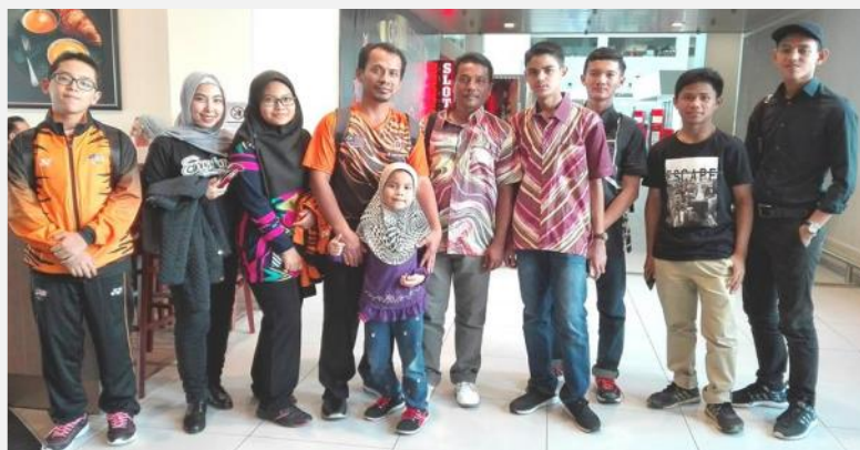
Young chess champions at the World Schools Chess Championships 2017, 21 April - 1 May 2017, Iasi, Romania

Four students from MRSM Kubang Pasu and Langkawi participated in the 15th Edition of the International Informatics Project Competition (INFOMATRIX 2017 WORLD FINALS) organized by Lumina Educational Institutions, Bucharest in collaboration with the Romanian Ministry of Education and Scientific Research, from 27 April – 1 May 2017. Malaysia won 1 gold medal and 1 silver medal for the short film and robotic category.