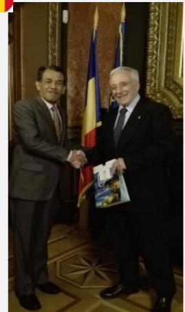
Courtesy call on H.E. Mr. Mugur Constantin Isarescu, Governor of the National Bank of Romania