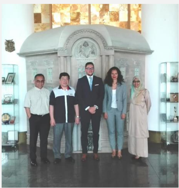
Courtesy call by MATRADE, Tourism Malaysia Istanbul and MIDA Munich on the Romanian Chamber of Commerce & Industry (CCIR), 13 June 2017