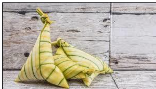
ketupat pulut (glutinous rice version)