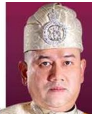
Sultan Muhammad V

The Sultan of Perak, Sultan Nazrin Muizzuddin Shah, was officially appointed as the Deputy Yang di-Pertuan Agong at the same ceremony.