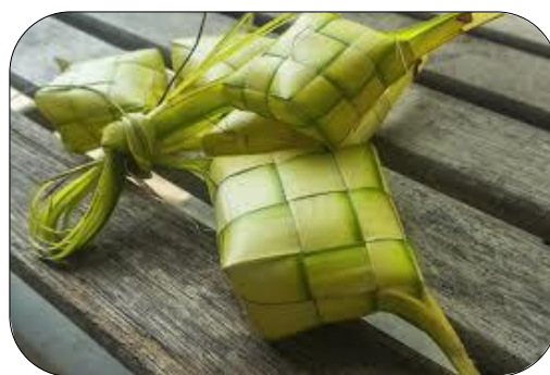
ketupat nasi (white rice version)

Literally a type of rice dumpling or rice cake made from glutinous rice. After it was cooked, skin (woven palm leaf) being removed, the inner rice cake is cut in pieces, and served as staple food, as the replacement of plain steamed rice. Two of the more common ones was ketupat nasi (white rice version) and ketupat pulut (glutinous rice version). Ketupat nasi is made from white rice and is wrapped in a square shape with coconut palm leaves while ketupat pulut is made from glutinous rice and is usually wrapped in a triangular shape using the leaves of the fan palm.