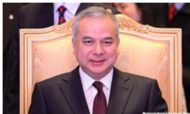
Sultan Nazrin Muizzuddin Shah

Hobbies: Horse-riding, reading, golfing, shooting, badminton, bowling, foot- ball, 4WD expeditions