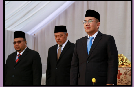
HRH Dr. Tengku Muhammad Fa-Iz Petra Ibni Sultan Ismail Petra, the Regent and Crown Prince of the State of Kelantan undertook a working visit to Cairo, Egypt on 9-11 February 2017. During the visit, the latter officiated the new Student's Residential Hostel of Kelantan in Nasr City, Cairo on 10 February 2017.