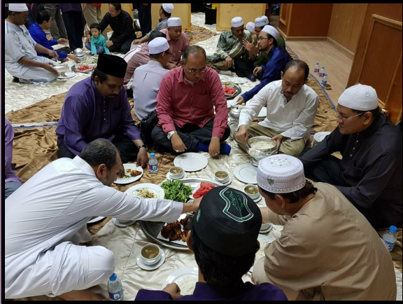
The Malaysian Embassy organized its "Ihya' Ramadhan" Program at the Malaysian Hall Abbasiyah, Cairo on 2 June 2017.