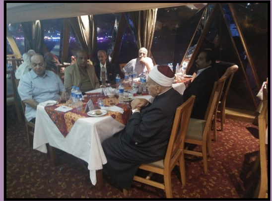
The Egyptian-Malaysian Friendship Association (EMFA) in collaboration with the Misr Asia Travel, hosted an Iftar programme with the officials of the Malaysian Embassy at the Nile Crystal Cruise on 7 June 2017.