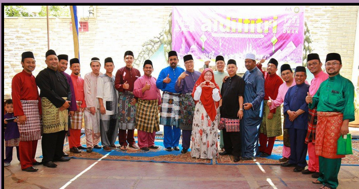
The Embassy of Malaysia in Cairo held its "Majlis Sambutan Hari Raya Aidilfitri" at the Malaysian Hall Abbasiyah, Cairo on 25 June 2017. More than 2,500 Malaysians attended the programme, mostly students residing in Egypt as well as the officials and families of the Embassy.