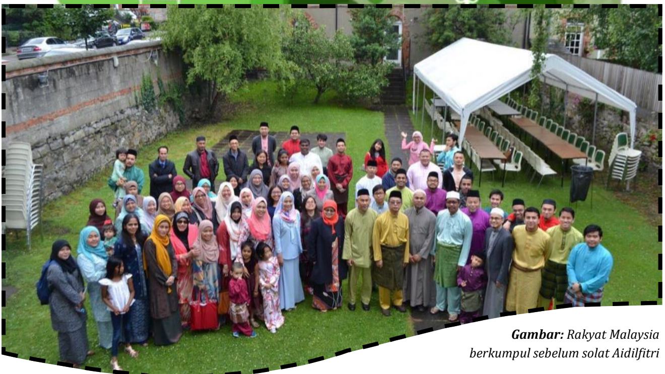
Gambar: Rakyat Malaysia berkumpul sebelum solat Aidilfitri

Seramai lebih 250 orang rakyat Malaysia berbilang kaum termasuk warga Ireland telah hadir ke majlis sambutan Aidilfitri yang telah diadakan sepanjang hari tersebut.