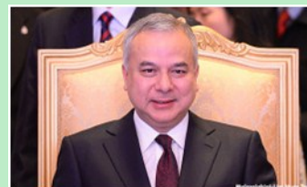
Deputy Yang di-Pertuan Agong

The Sultan of Perak, Sultan Nazrin Muizzuddin Shah (pix below), was officially appointed as the Deputy Yang di-Pertuan Agong at the same ceremony.