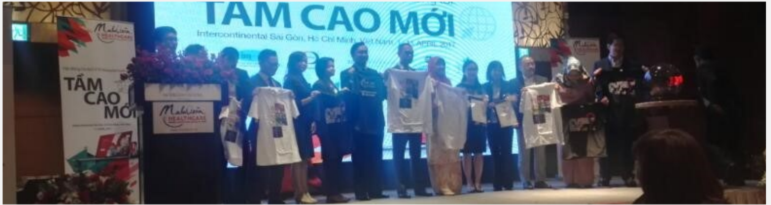
Launch of MHTC's ytemalaysia.vn website and Award of Certificate of Cooperation with Dr Binh Clinic, Hung Viet, Vigor Clinic and Saigon ENT Clinic on 11 April 2017. The event was officiated by HE Ambassador of Malaysia to Vietnam and attended by Consul General of Malaysia in Ho Chi Minh City. Also present were representatives from Malaysian hospitals including IJN, KPJ, Beverly Wilshire, Loh Guan Lye and Regency.