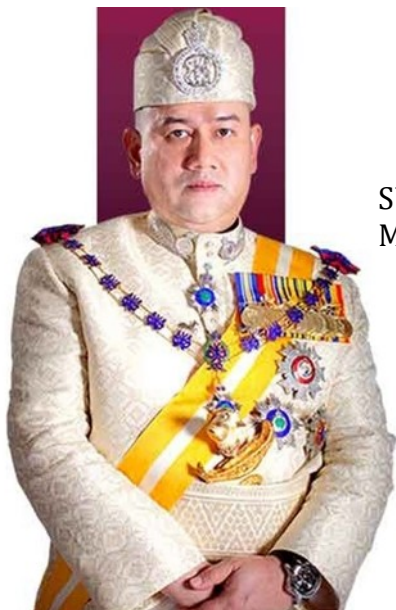
SULTAN MUHAMMAD V