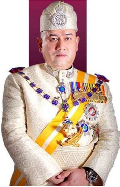
SULTAN MUHAMMAD V