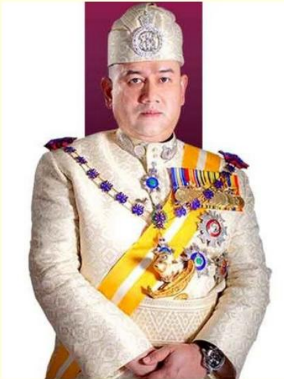
SULTAN MUHAMMAD V