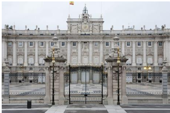
Palacio Real Madrid , the Official Residence of the King of Spain