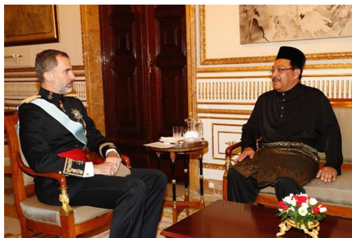
Courtesy Call on His Majesty King Felipe VI