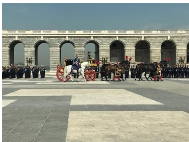
Procession of Ambassadors escorted by Royal Guards

The ceremony was full of pomp and circumstances, complete with 19 th century horse drawn carriages, footmen resplendent in their formal military regalia and the procession of Royal Guards escorting the Ambassadors from the Ministry of Foreign Affairs to the Royal National Palace.