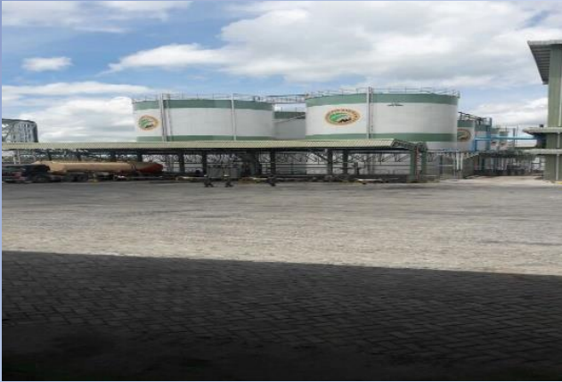
USD 80 MILLION GOLDEN AFRICA KENYA LTD. PALM OIL REFINERY PLANT ATHI RIVER, MACHAKOS COUNTY