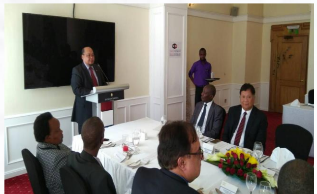
Farewell Luncheon by Ministry of Foreign Affairs of the Republic of Kenya