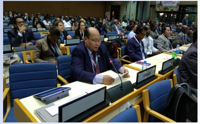
Delivering Statement on behalf of Asia Pacific Group during the 26th Session of UN-Habitat Governing Council