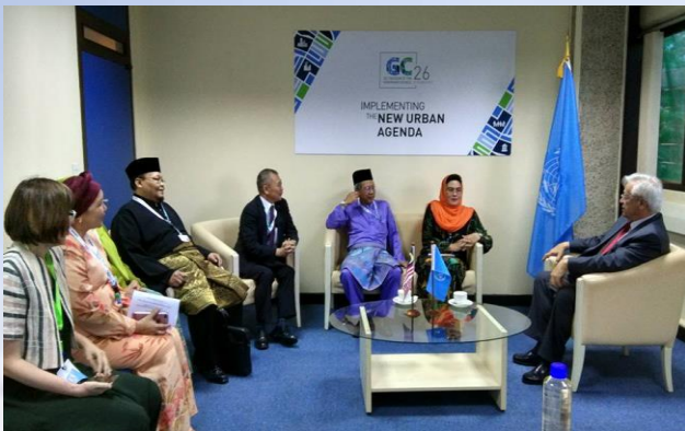
Courtesy Call on Dr. Joan Clos, Executive Director of UN-Habitat by YB Deputy Minister of Urban Wellbeing, Housing and Local Governments