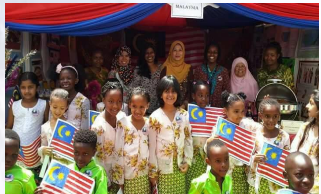
Nairobi International School Cultural Day