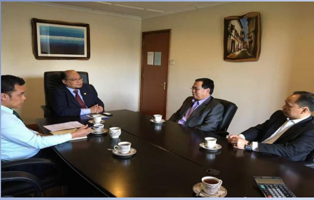
Meeting with the President of Petronas South Sudan