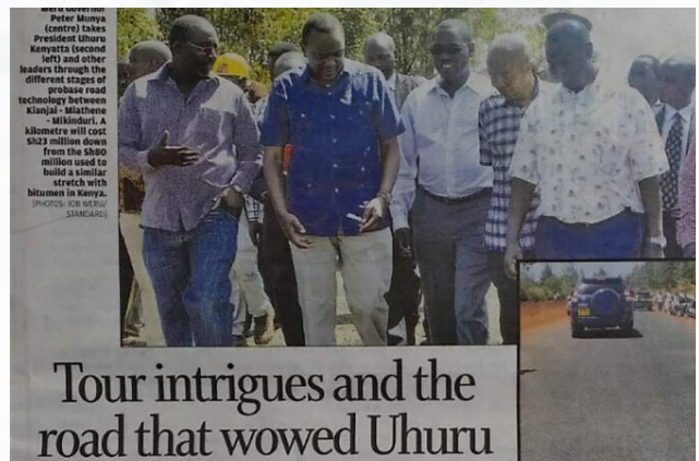
Tour intrigues and the road that wowed Uhuru