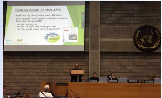
Presentation on Sustainable Waste Management in Malaysia at UNEP