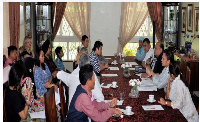
Program Mendampingi Rakyat Malaysia