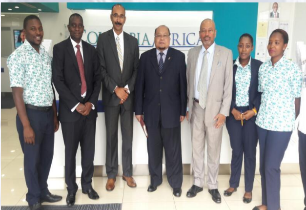
COLUMBIA AFRICA MEDICAL CENTRE (SUBSIDIARY OF COLUMBIA ASIA) AT LIMURU ROAD, NAIROBI