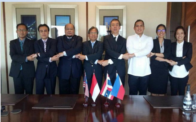
2nd ASEAN-Nairobi Committee Meeting February 2017