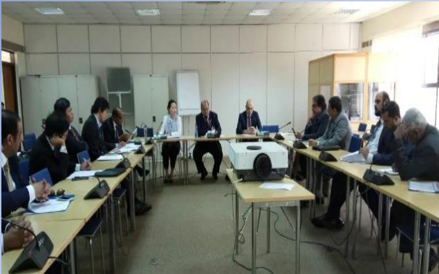
Chairing of Asia Pacific Group Meeting on UNEP and UN-Habitat issues