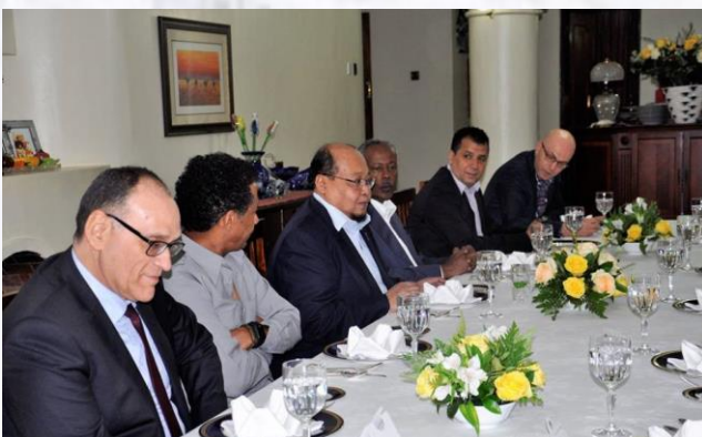
Dinner with Muslim Ambassadors