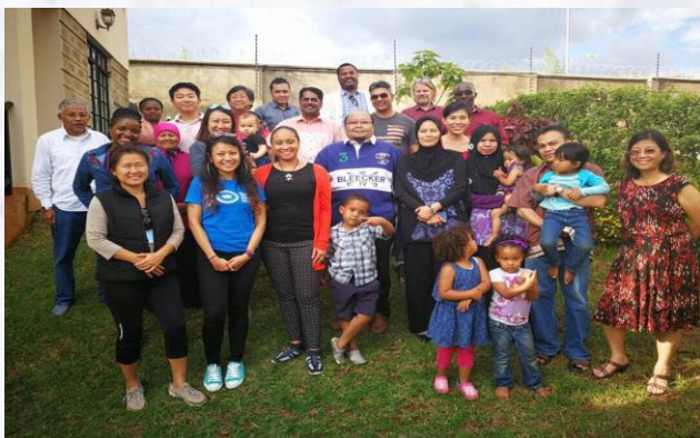
High Commissioner's Farewell Gathering with Malaysians