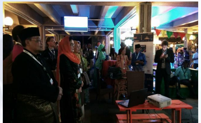
Special Reception on the Ninth World Urban Forum at United Nations Compound in Gigiri, Nairobi