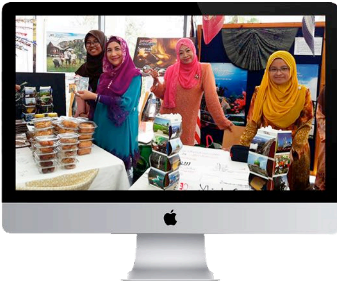
Thailand in Morocco.

This was done through various activities namely demonstration of calligraphy writing, cultural performance, exhibitions as well as food bazaar. The event was also participated by the Embassy of Indonesia and