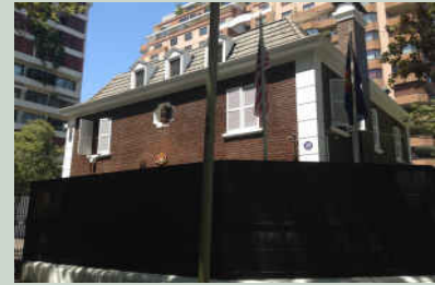
Embassy of Malaysia in Santiago Chile

Address : Callao 3461 Las Condes Santiago Chile