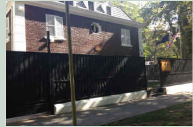
Embassy of Malaysia in Santiago Chile

Pada 5 Januari lalu, Kedutaan Besar Malaysia di Santiago, Chile dalam satu kenyataan berkata, seorang rakyat Malaysia terkandas di Ecuador hampir dua bulan selepas dipercayai diperdaya sindiket penyeludupan untuk membawa barangan diseludup ke Malaysia.