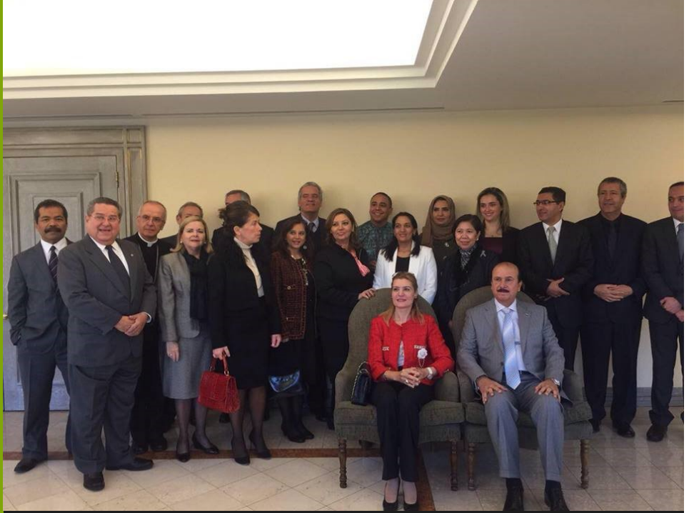
Norway's National Day