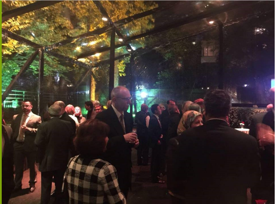
Norway's National Day