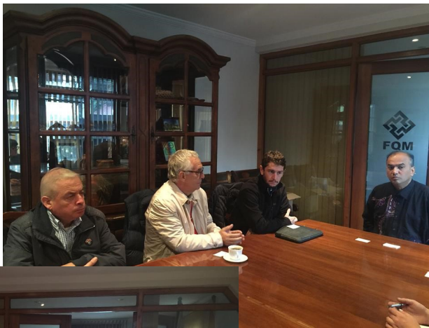
In the Meeting Room