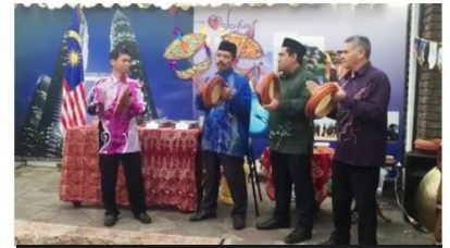
Kumpang Show Performed by Embassy Staffs today at the Embassy of Malaysia in Santiago Open House.