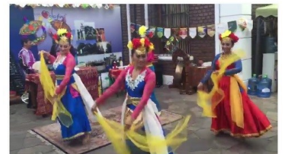
Tarian during the Embassy of Malaysia in Santiago Open Day

Public queuing up to taste Malaysian cuisine such as satay, pisang goreng, nasi pelangi, rendang ayam, ABC at the Embassy of Malaysia in Santiago. Thanking Perwakilan Santiago for their tireless efforts and also Staffs of the Embassy.