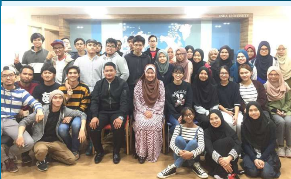
The Education Office organised Program Perjumpaan Pelajar Siri 4/2017 at Inha University