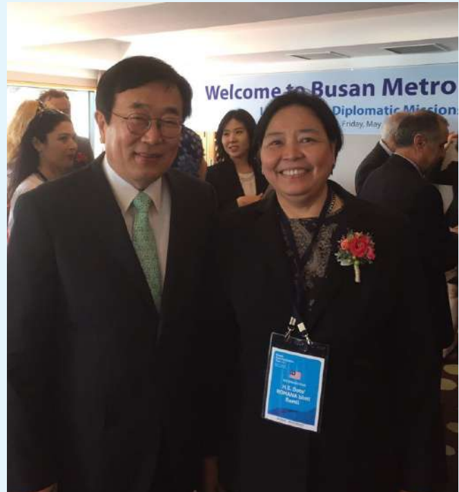
H.E. Dato' Rohana Ramli with Mayor of Busan, Suh Byung-soo