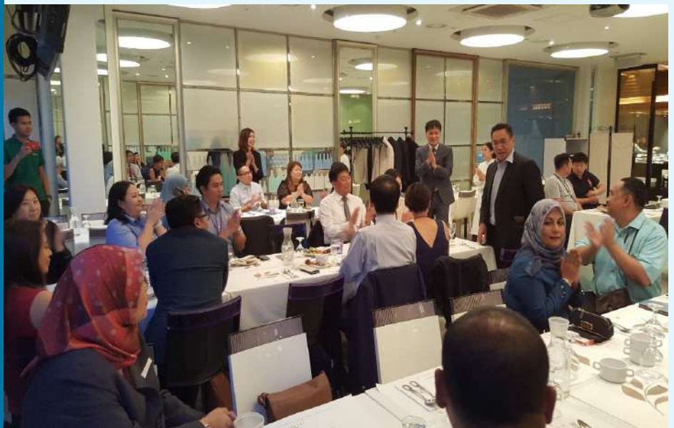
Dinner hosted by TM Seoul at The Buffet Restaurant