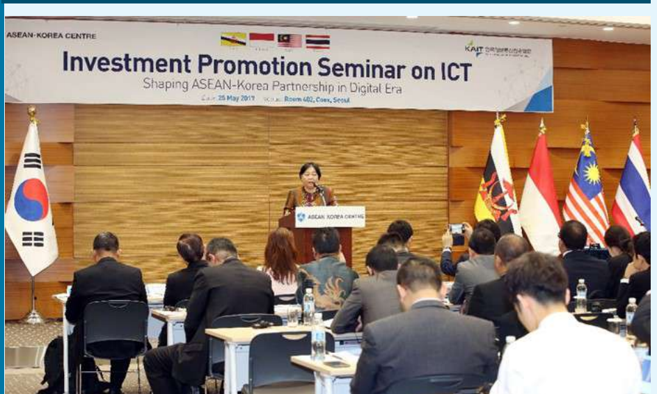
ASEAN-Korea Investment Promotion Seminar on ICT from 24-26 May 2017