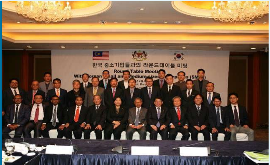
Roundtable meeting with Korean Small and Medium-sized Enterprises (SMEs) led by YB Dato' Sri Mustapa Mohamed, Minister of International Trade and Industry (MITI)