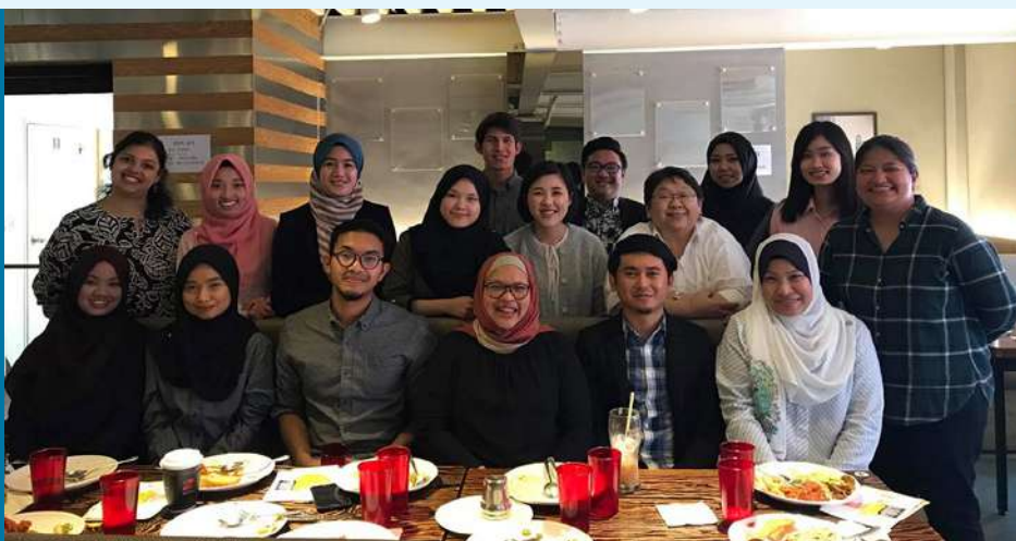
Meet up session between Talent Corporation Malaysia and Malaysian students in Seoul