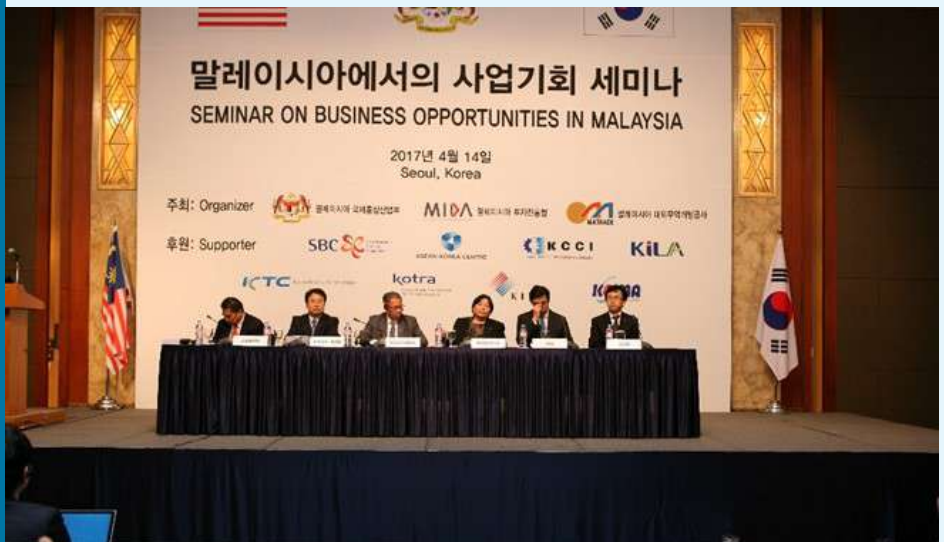
Seminar on Business Opportunities in Malaysia during YB Minister MITI's Trade and Investment Mission to Seoul, ROK