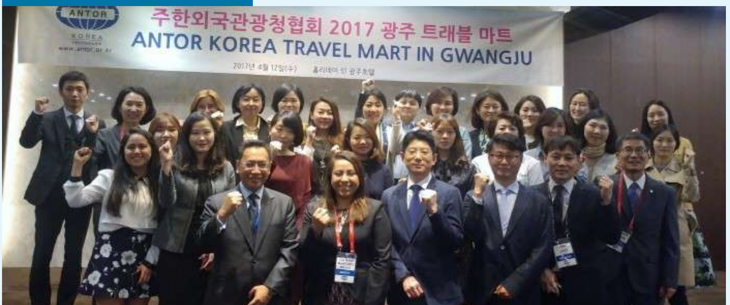
ANTOR Roadshow held in Gwangju from 11-12 April 2017