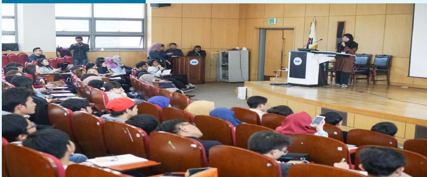
The Education Office organised Career Talk 2017: Your Future Begins Here for all final year students at Dongyang Mirae University