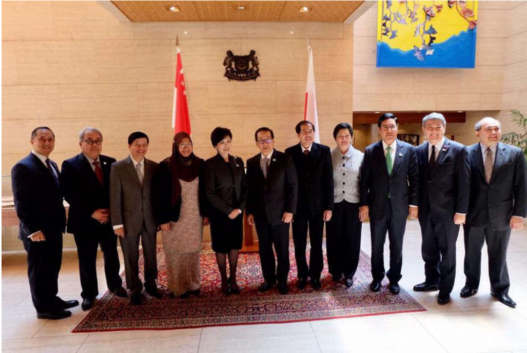
Top: ACT's Luncheon with Ms. Yuriko Koike, Governor of Tokyo on 4 April 2017 at the Embassy of Singapore, Tokyo.