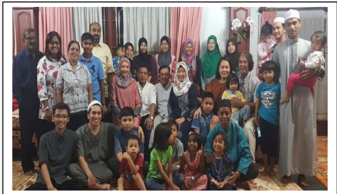
... group photo at Defence Attaché's house