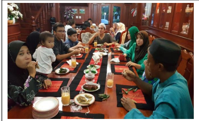
... at Defence Attaché's house

iii. Officials of Malaysian Embassy donated USD750 to Al-Azhar Mosque, Vientiane, to bear the cost of breaking fast for the 2 nd and 3 rd day of Ramadhan at the Mosque. Embassy Officials also joined the local Muslim communities during the breaking fast at Al-Azhar Mosque on the mentioned dates; (Continue in page 4).