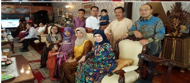
Hari Raya Open House hosted by Amb. of Indonesia.