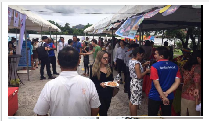
... view at the Food Bazaar