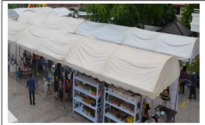
... ariel view of the Food Bazaar.