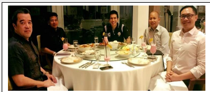
... breaking fast at Flavours & Spices as well as at Mercure Hotel