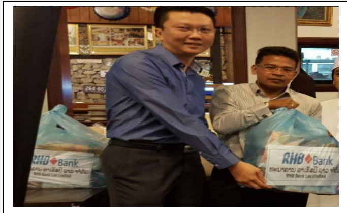
Donation to 40 Muslim families by RHB Bank, Lao PDR

vi. Attending breaking fast invitations hosted by (a) RHB Bank, Lao PDR on 5 June, (b) by Flavours and Spices Restaurant on 20 June; and (c) by Mercure Hotel on 21 June 2017.