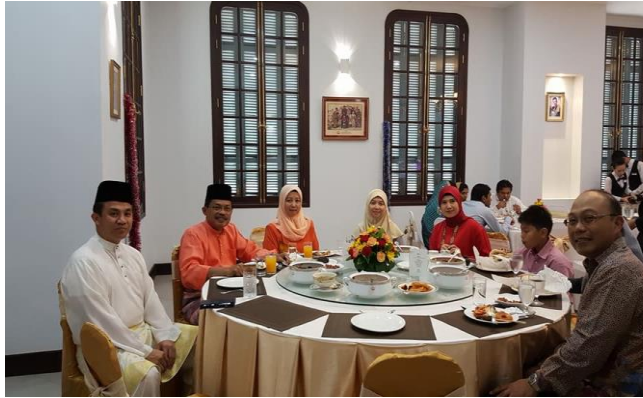
Hari Raya Open House hosted by Amb. of Brunei.