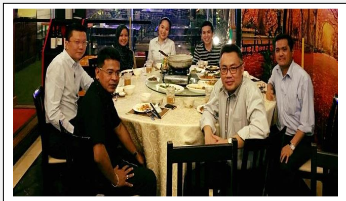
.. breaking fast hosted by RHB Bank, Lao PDR