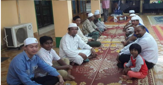
... breaking fast at Al-Azhar Mosque donated by Embassy Officials