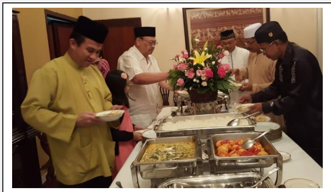
... breaking fast at Amb. of Indonesia's house