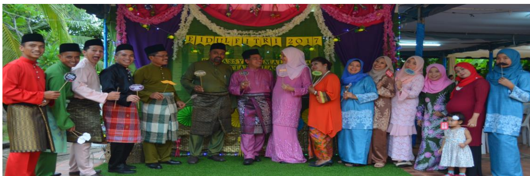
Officials of the Embassy & their spouses during the Hari Raya Open House Celebration.

Alhamdulillah, Ramadhan arrived again this year beginning on 27 May 2017. In the holy month for Muslims, Embassy of Malaysia joined hand with PERWAKILAN Vientiane in hosting as well as participating in various activities with the aim of fostering warm relations with the local and Muslim communities as well as to promote Malaysian food to the Lao government officials, members of the diplomatic corps as well as Malaysians residing in the Lao PDR. (Continue in page 2).