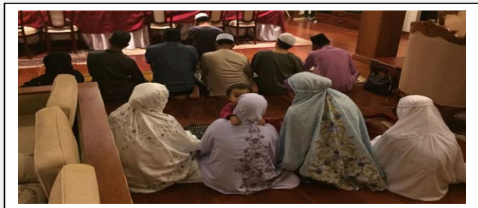
... Maghrib, Isyak and Terawih prayers after breaking fast at Rumah Malaysia