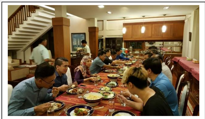
... breaking fast hosted by H.E. Amb. & spouse