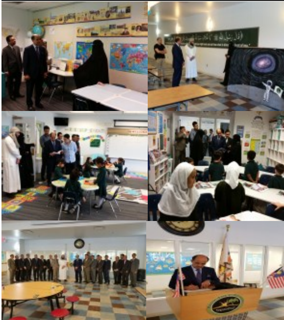
Visit to Palm Tree School, 28 April