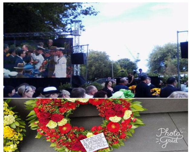
The wreath laid by the Malaysian High Commissioner, at the memorial