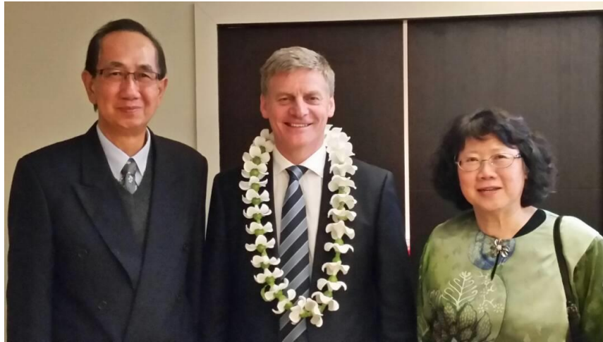
The Prime Minister of New Zealand, The Rt. Hon. Bill English, flanked by High Commissioner Dato' Lim Kim Eng and her spouse

The Diplomatic Corps hosted a reception on 17 March 2017 at the Intercontinental Hotel, Wellington to congratulate the current Prime Minister of New Zealand, the Rt. Hon. Bill English on his assumption of the Prime Minister's post on 13 December 2016, following the sudden resignation of former Prime Minister John Key.