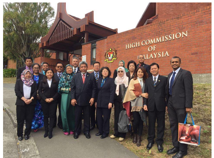
Photo with the PAC Sabah delegation at the front of the Malaysia High Commission in Wellington.