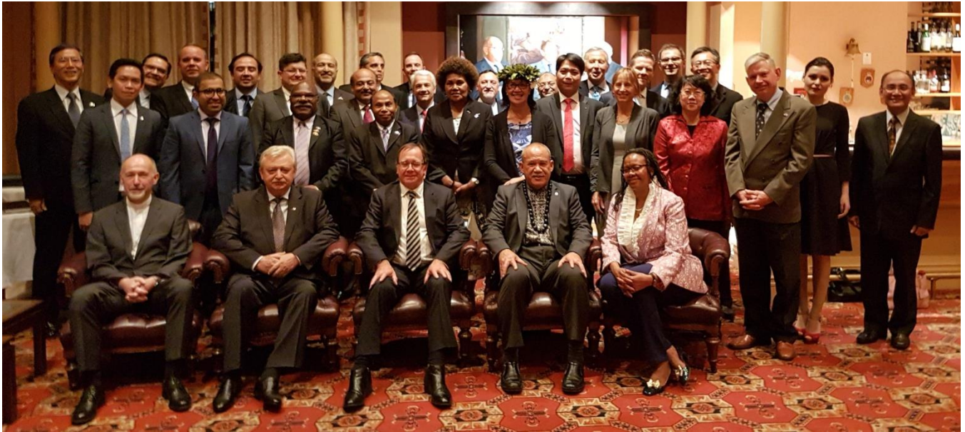
High Commissioner Dato' Lim Kim Eng with H.E. Murray McCully, Foreign Minister of New Zealand and the other Heads of Mission (HOM)

On 10 April 2017, the Diplomatic Corps in Wellington also hosted a farewell reception in honour of Honourable Murray McCully, who was a Foreign Minister of New Zealand since November 2008. As a National Party MP of 30 years, Hon. McCully is the third longest serving Foreign Minister of New Zealand who stepped down on 1 May 2017.