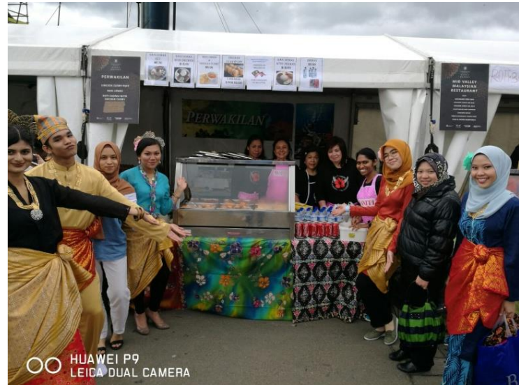
PERWAKILAN Wellington's booth selling Malaysian food.