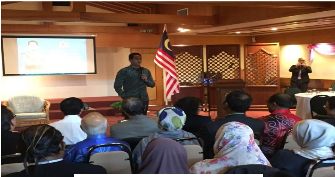
YB Brig. Gen. Khairy Jamaluddin engaging with the audience in Wellington on the TN50 roadmap.

YB Minister Khairy's office is tasked to collect, collate and compile all of the inputs and aspirations from all of these engagements to come up the policy paper that details Malaysia's direction by the year 2050, which is a 30-year period from 2020.