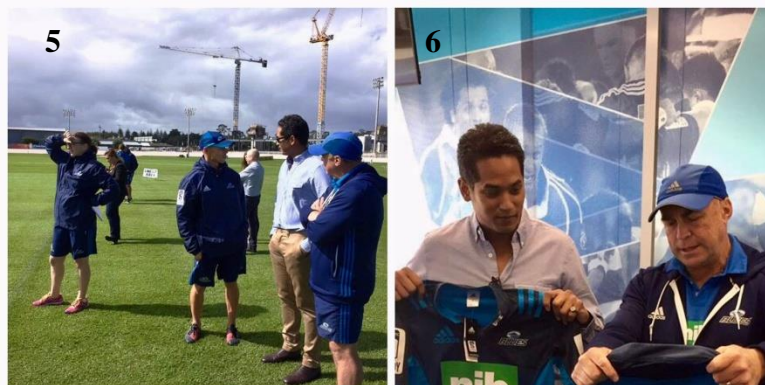
5 & 6. YB Minister Khairy with the NZ Blues Rugby Team in Auckland.