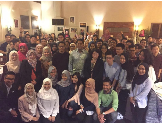
YB Brig. Gen. Khairy Jamaluddin and H.E. Dato' Lim Kim Eng, High Commissioner of Malaysia to New Zealand, with Malaysian students in Auckland.

YB Minister Khairy also took advantage of the visit to have two National Transformation towards 2050 (TN50) engagement sessions in Auckland and Wellington respectively with the Malaysian students and community. The engagements were part of a national consultation process on Malaysia’s National Transformation Plan towards 2050 or TN50 which was organised by the High Commission of Malaysia in Wellington.