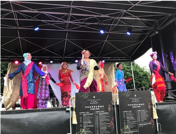
Colourful performances by Asiatic Dancers (comprising some Malaysian students in Wellington)

The High Commission of Malaysia in Wellington also set up the PERWAKILAN Wellington food booth to promote Malaysian food namely its iconic nasi lemak, karipap, roti chanai and kari ayam. In addition, Asiatic Dancers, comprising seven Malaysian students from the University of Victoria in Wellington represented Malaysia in entertaining the crowd with their medley of cultural dances from Malaysia. Many Kiwis expressed their delight in tasting the food and appreciating the dances that came from Malaysia, while acknowledging the 60 years of diplomatic relations between Malaysia and New Zealand.