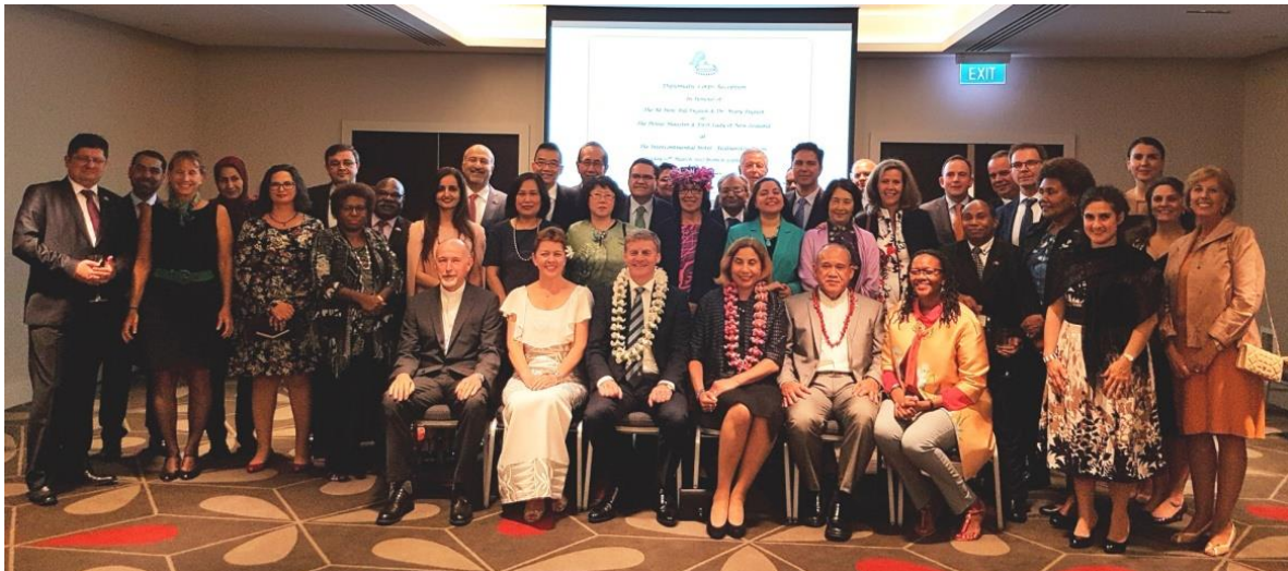
The Prime Minister of New Zealand, The Rt. Hon. Bill English with the Heads of Mission (HOM)