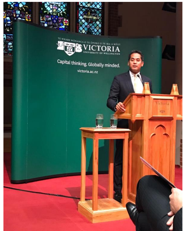
YB Brig. Gen. Khairy Jamaluddin delivering his speech at the 2017 Saad Lecture at the University of Victoria in Wellington.