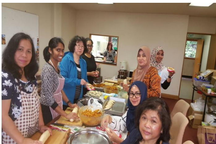
PERWAKILAN Wellington during the 'gotong royong' in making 'karipap' for the ASEAN Southeast Asian Night Market event

On a separate note, the High Commission of Malaysia in Wellington also took part in an ASEAN Ladies Circle Flower Demonstration event held at the Singapore High Commission on 23 March 2017.