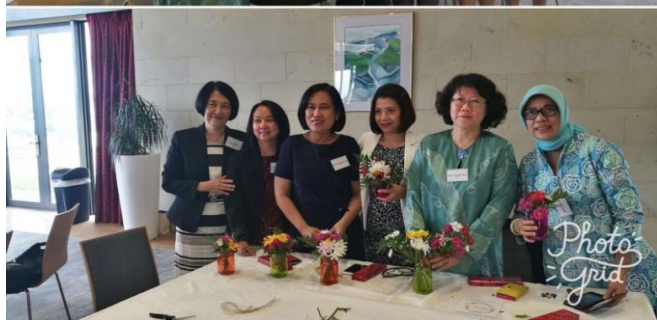
ASEAN Ladies Circle Flower Demonstration event hosted by Singapore at its High Commission in Wellington, 23 March 2017