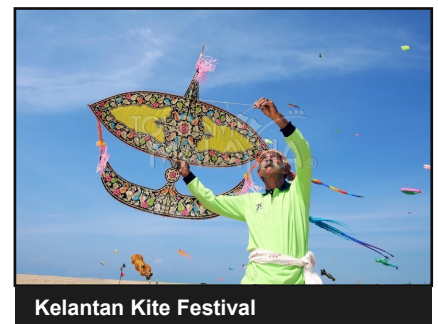
Kelantan Kite Festival

Cooperation was particularly evident in the exchange of support in the multilateral fields, higher education and training, culture, trade as well as in sports.