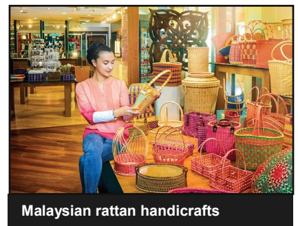
Malaysian rattan handicrafts