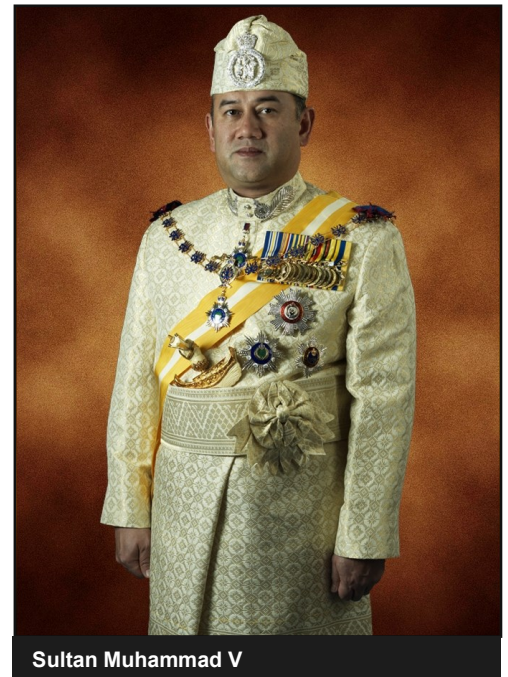
Sultan Muhammad V

Loves the outdoors and started the "Walk with Me" Walkathon D'Raja Kelantan, which has been held since 2011, where the Sultan will walk with his subjects for 10km around Kota Baru.