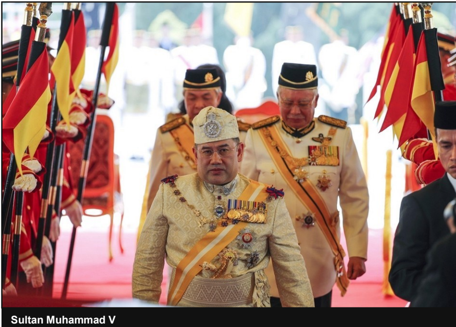
Sultan Muhammad V