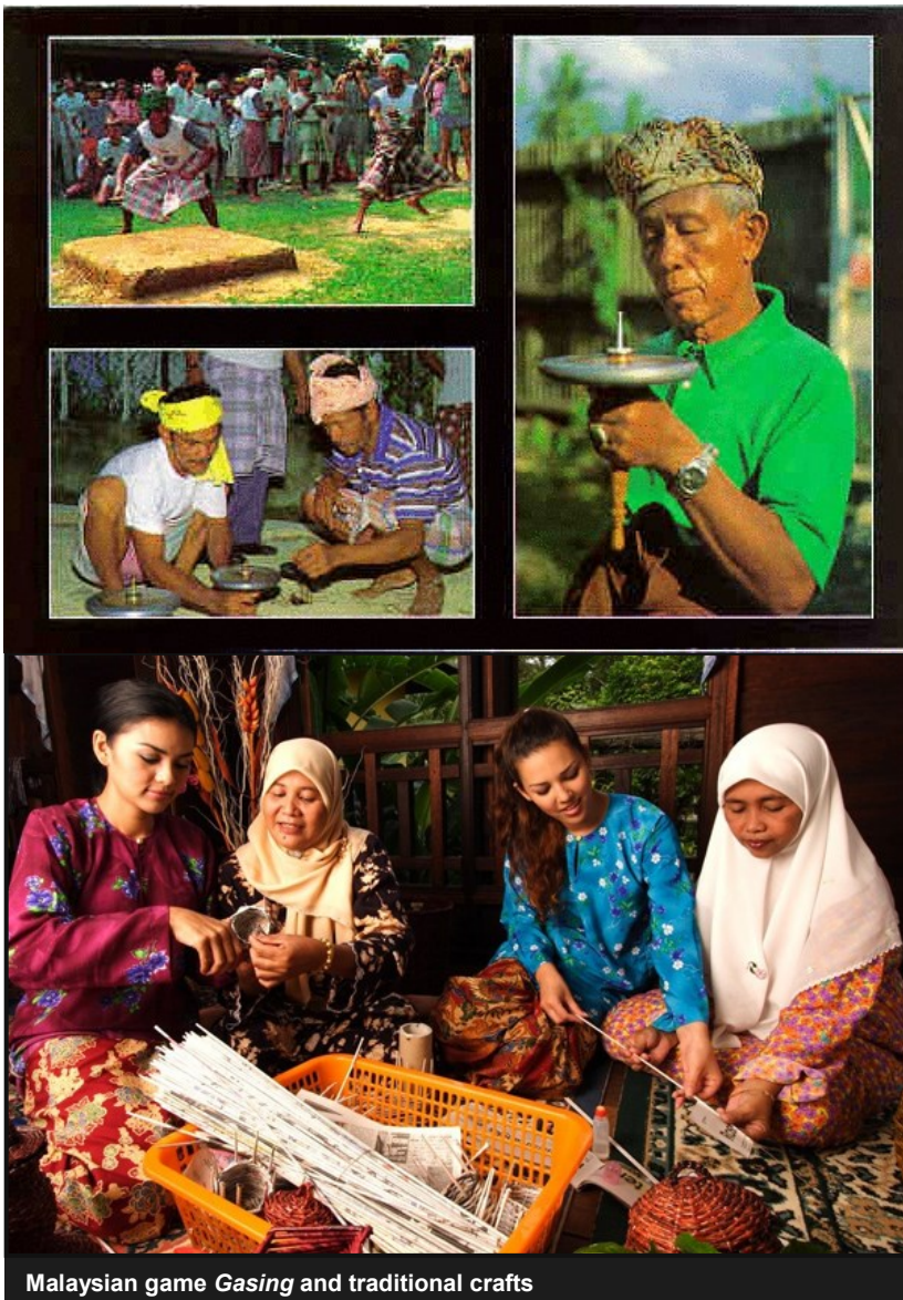
Malaysian game Gasing and traditional crafts

With the Malaysian homestay programme, tourists will experience life in a kampung or traditional village. The kampungs involved in the homestay programme are committed to ensure that visitors experience village-style living first hand. All kampungs taking part in the homestay programme are carefully selected and comply with strict guidelines from the Ministry of Tourism in order to bring out the best of Malaysia.