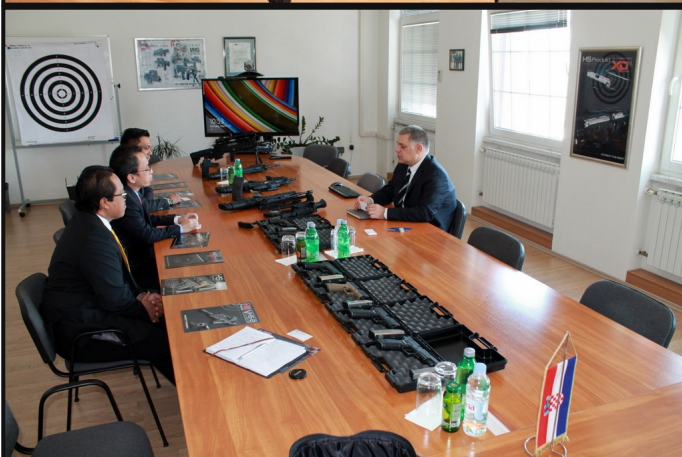
Visit to HS Produkt