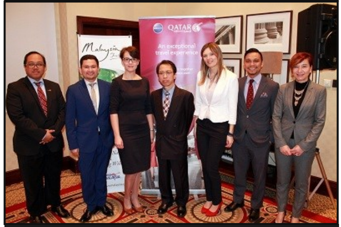
“Malaysia Truly Asia” Workshop