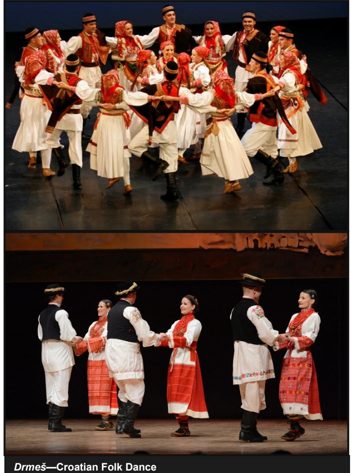
Drmeš—Croatian Folk Dance

Drmeš is a traditional and most popular folk dance of the central and eastern parts of Croatia which in its present form dates back to the late 19th century. Drmeš can be performed by a couple and by a group in a circle and it has two main forms, at the beginning dancers vertically jolt (Croatian "drmati" after which the dance got its name) at the same place, while later they spin around the place at great speed.