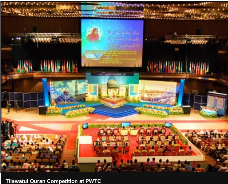
Tilawatul Quran Competition at PWTC

Tilawatul Quran is the international Quran recital event that is held annually since 1961 in Malaysia. Tunku Abdul Rahman (first Malaysian Prime Minister) was the founder of the International Quran Recital Competition. The program started on 9 March 1961 at Stadium Merdeka, Kuala Lumpur. Since 1985 the competition has been held in the Putra World Trade Centre (PWTC), Kuala Lumpur.