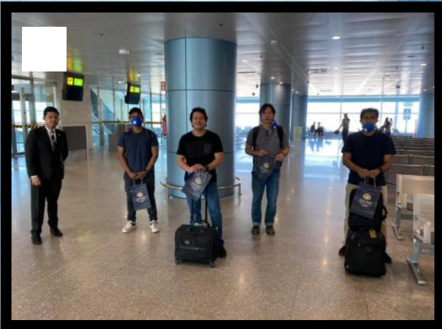
On 3 June 2020, the Embassy assisted the returning of four stranded Malaysians working in Algeria.