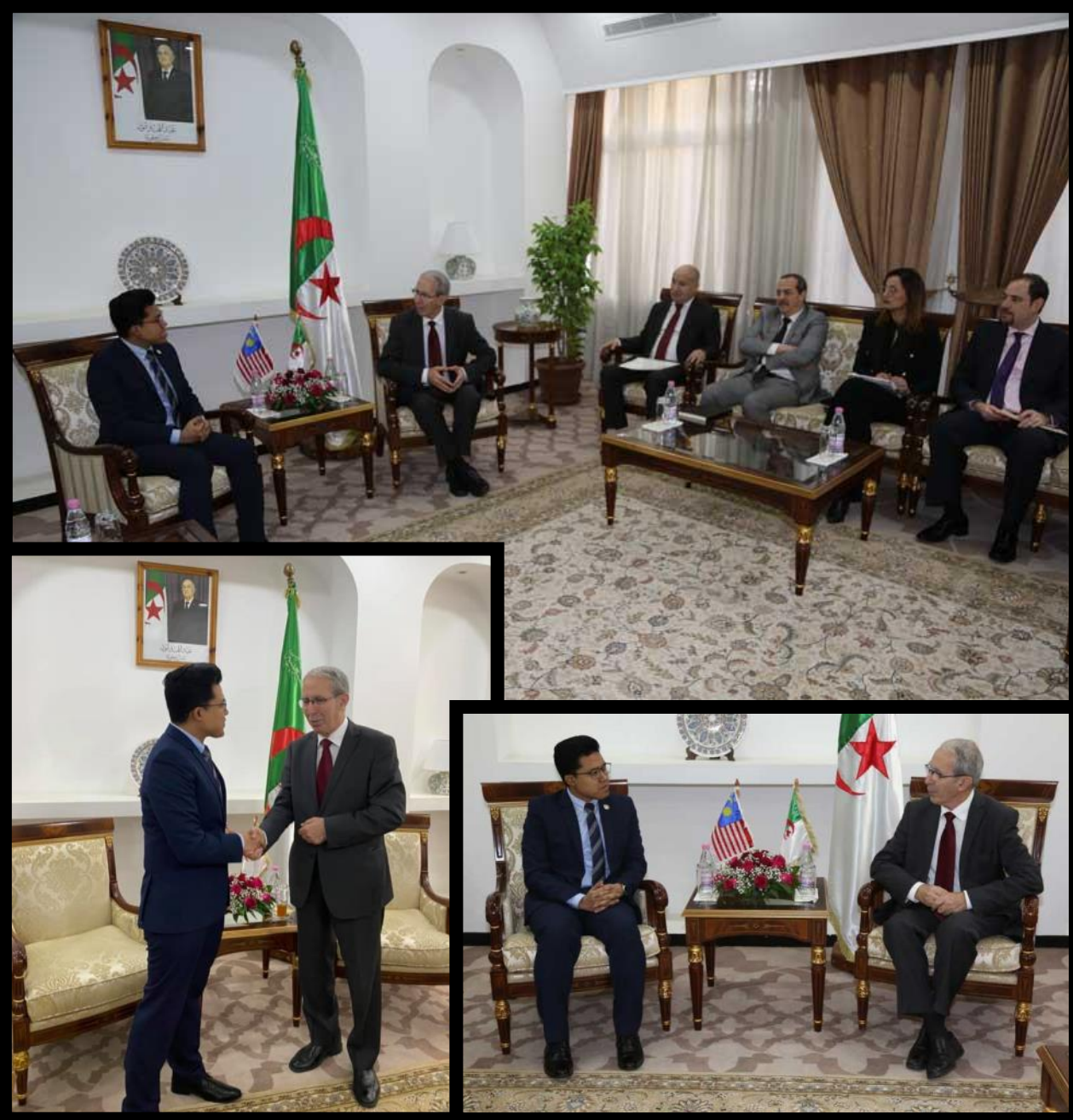
The Chargés d'Affaires a.i. paid a courtesy call on H.E. Farouk Chiali, Minister of Public Works and Transport of Algeria on 13 January 2020 to extend an invitation from YB Minister of Transport Malaysia and discuss broad issues of mutual interest.