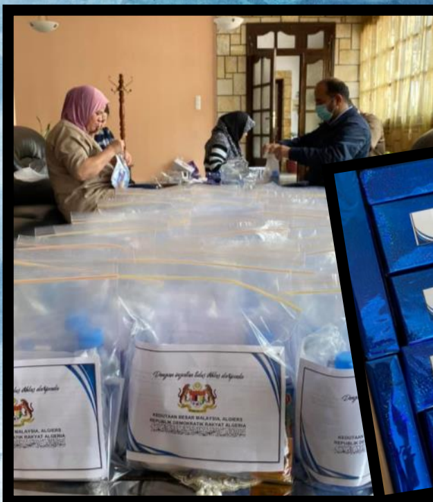
DISTRIBUTION OF FOOD PACKS AND COVID-19 HYGIENE KITS by the Embassy of Malaysia in Algiers.