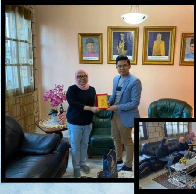
On 3 February 2020, the Chargè d'Affaires a.i. hosted a BREAKFAST MEETING with a delegation from the Malaysian Attorney General's Chamber.